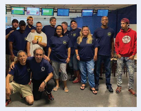
New City, NY Br. 5229 held a bowlathon in September to raise funds for the Muscular Dystrophy Association.