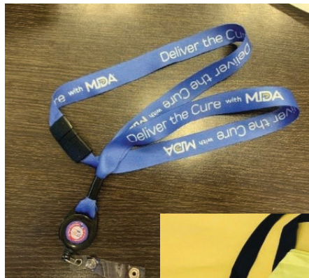
Below, the NALC/MDA gift bag and T-shirt; at left, the new lanyard being added.

You also can still purchase the NALC/MDA gift bags for $100. I will be adding a new MDA/NALC lanyard to the bag. Remember, it is first come, first serve, and all proceeds from every purchase will help children and adults in the MDA community and support innovative research to change the future for people with neuromuscular diseases.