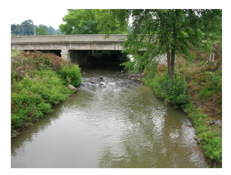
Figure 3. Salem Creek, looking upstream from the South Main Street bridge, City of Winston-Salem, Forsyth County. Bluehead Chub were collected in the riffle in July 2009. Bryn Tracey

On that day in July 2009, fish indigenous to and common in tributaries of the middle Yadkin River system such as the catostomids Brassy Jumprock, Moxostoma sp., and Notchlip Redhorse, Moxostoma collapsum, were absent as were Tessellated Darter, Etheostoma olmstedi, and Carolina Fantail Darter, Etheostoma brevispinum. Nonindigenous fish species syntopic with the Bluehead Chub at this site were the tolerant Red Shiner, Cyprinella lutrensis, the nest associate Rosefin Shiner, Lythrurus ardens, and the piscivorous Flathead Catfish, Pvlodictis olivaris (including one specimen about 850 mm total length). Only two indigenous species were collected along with Bluehead Chub-the tolerant Redbreast Sunfish, Lepomis auritus, and Largemouth Bass, Micropterus salmoides.