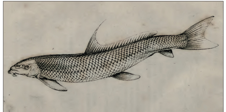
Figure 1. LeSueur’s illustration of a (dried) Blue Sucker.

For expanded information, a complete list of sources used in this article, links to original texts, and more images, please see http://moxostoma.com/bluesuckernames .