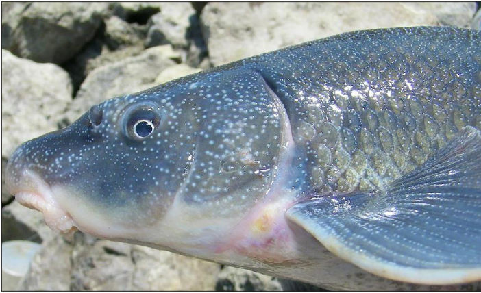
Figure 2. They really do get that blue. Kansas Blue Sucker, during the spawn. May, 2011.

Though its scientific name was sorted out in under 40 years—a quick resolution compared to some fishes—settling on a common name would take nearly three times as long, and priority would have no role at all in the decision.