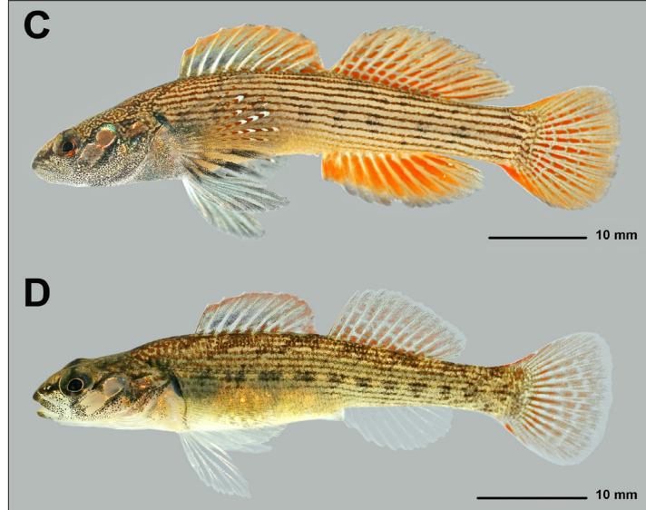
Live adult male and female specimens of Etheostoma nebra and E. virgatum . A, Etheostoma nebra paratopotype , YPM ICH 27039, 55 mm SL male, Flat Lick Creek, Pulaski Co., Kentucky, 8 April 2010; B, E. nebra paratopotype, YPM ICH 026966, YFTC 24305, 44 mm SL female, Flat Lick Creek, Pulaski Co., Kentucky, 13 May 2014; C, E. virgatum , YPM ICH 027042, 53 mm SL male; D, E. virgatum , YPM ICH 027042, 42 mm SL female, both Birch Lick Creek, Jackson Co., Kentucky, 29 June 2009.