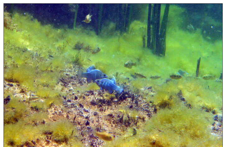
Figures 7 and 8. Male Owens Pupfish displaying to females in Fish Slough Area of Critical Environmental Concern (Inyo County, California).