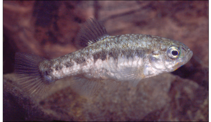
Figure 9. Female Owens Pupfish.

Rank-and-file American citizens have been generally apathetic about the conservation of biological diversity, but one would hope not to find similar unconcern within the scientific community. Yet there is much complacency among professionals, particularly among those biologists