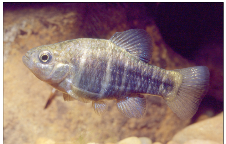
Figure 11. Different color phase of Male Owens Pupfish.