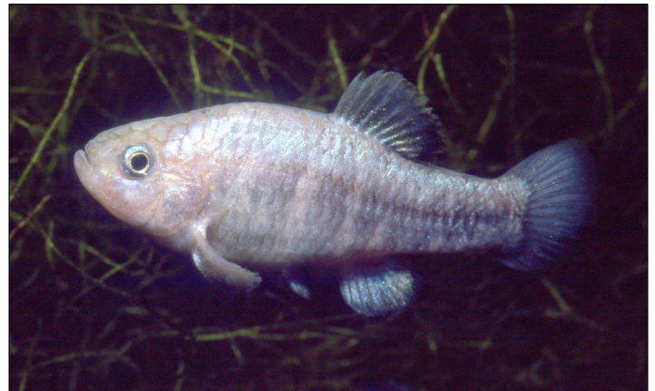
Figure 10. Male Owens Pupfish.