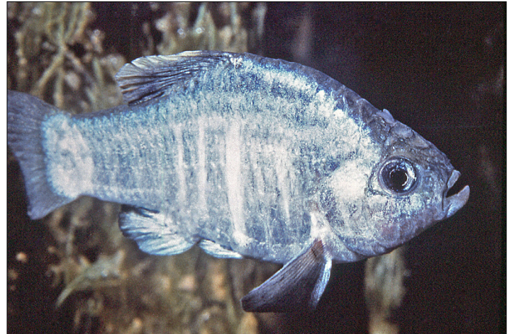
Figure 1. Male Owens Pupfish.

Journal of the Royal Geographical Society (1863)