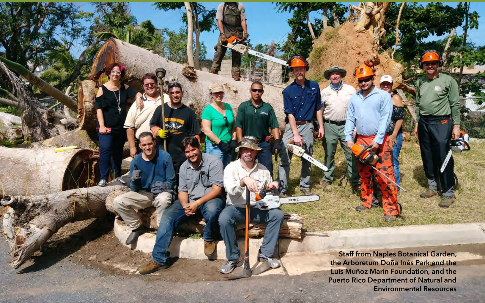
Staff from Naples Botanical Garden, the Arboretum Doña Inés Park and the Luis Muñoz Marín Foundation, and the Puerto Rico Department of Natural and Environmental Resources