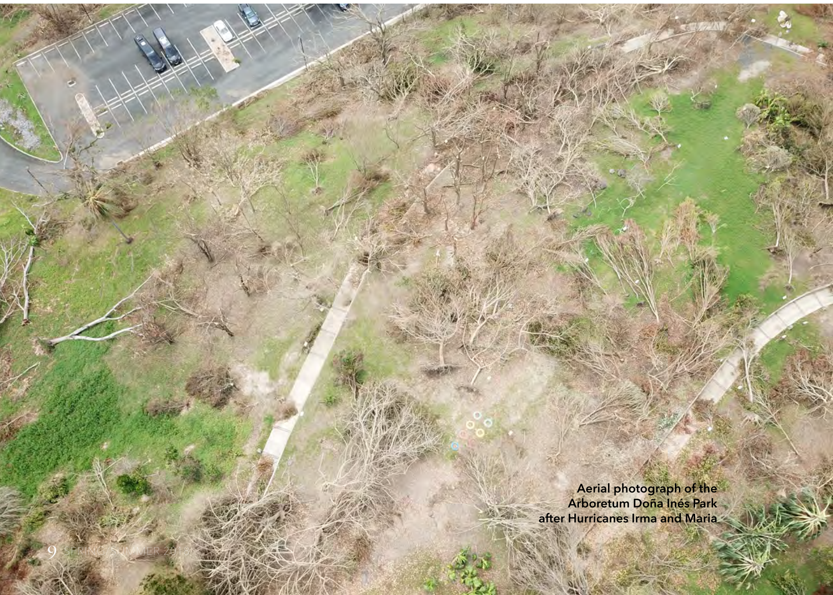
Aerial photograph of the Arboretum Doña Inés Park after Hurricanes Irma and Maria