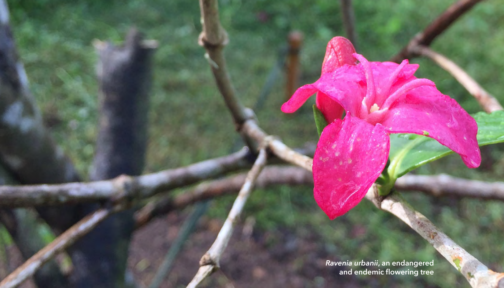
Ravenia urbanii , an endangered and endemic flowering tree