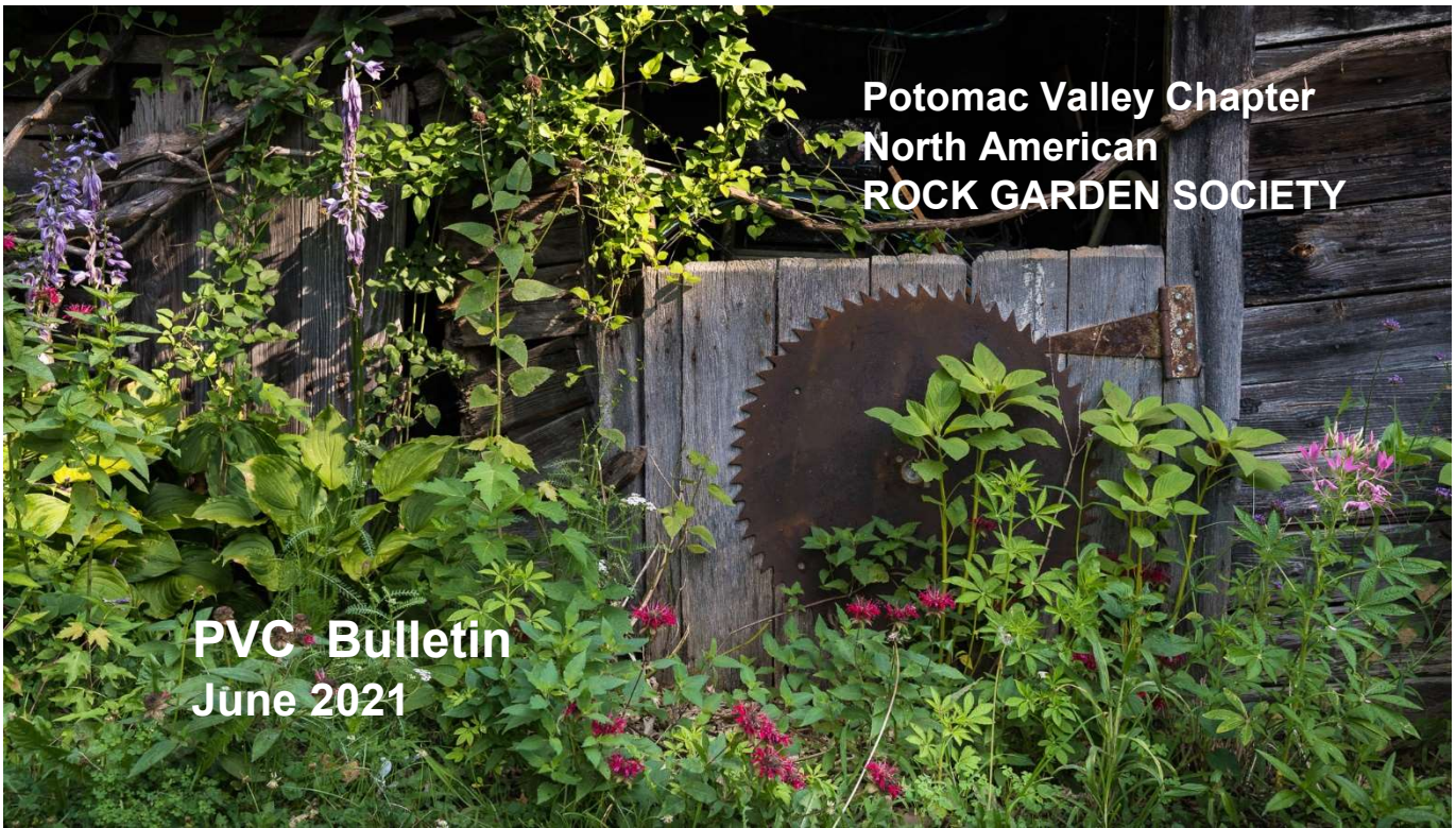
Wollam's Flower Farm, Jeffersonston, Virginia

PVC web page: https://nargs.org/chapter/potomac-valley-chapter