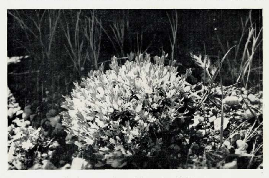
Orophaca caespitosa (Astragalus gilviflorus) a white flowering bun plant of the western wastes.

What surprise to wander out along an almost barren bad land ridge in late May, toward a vague patch of color, and come upon a colony of Astragalus, tridactylicus glowing in pink-purple or lavender-rose, the edges of the buns a soft silvery green of tiny sharp tipped tri-part foliage. First there is a delighted contemplation of the perfection of form of this gem, its color, its harmony of settnig on the light gray clay, more or less mulched with lighter limestone rubble — then of the novelty of beauty in isolation. Companion plants if any are a few stunted