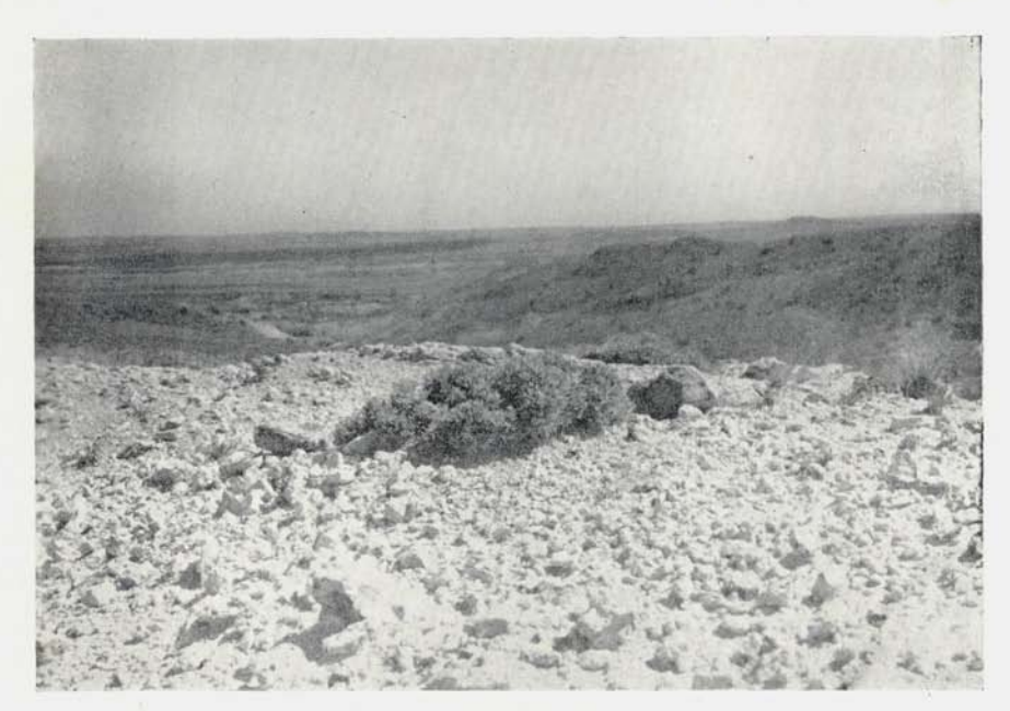
Astragalus tridactylicus in its typical habitat of clay with limestone fragments.

weeds, now and then if the footing is a bit more loam-like, a tuft or two of unthrifty grass. Very old specimens may appear to be raised on little eminences, partly because the surrounding soil has weathered away, partly because these plants gather and hold soil that blows or spatters in.