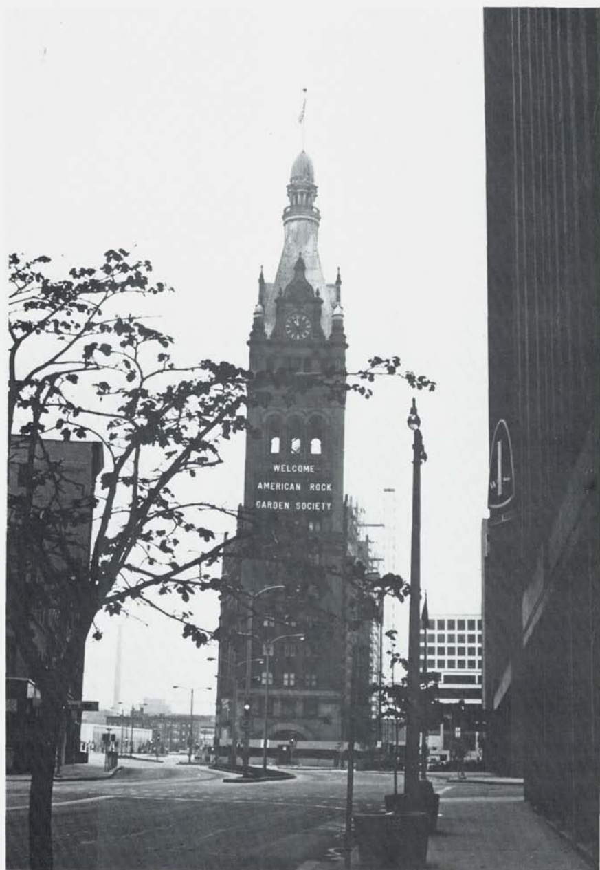
Milwaukee's City Hall and our welcome