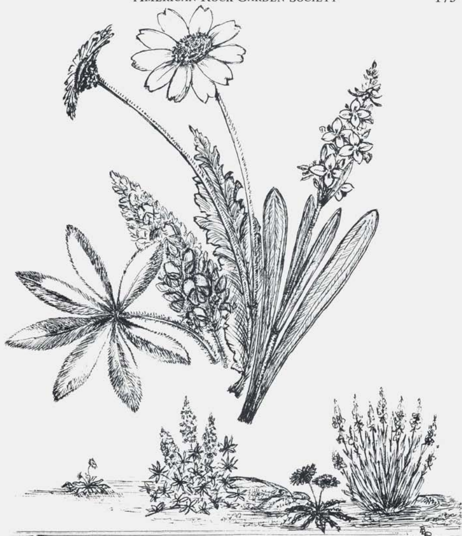
Lupinus lepidus aridus , Balsamorhiza rosea and Frasera albicaulis .