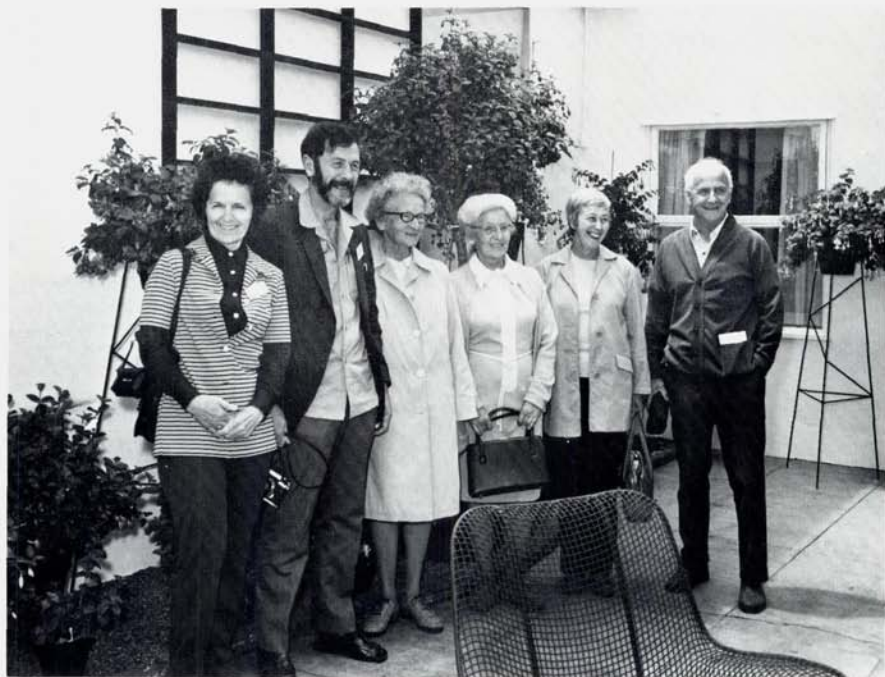
ARGS is truly International—Four countries represented in this picture taken at West of the Lake