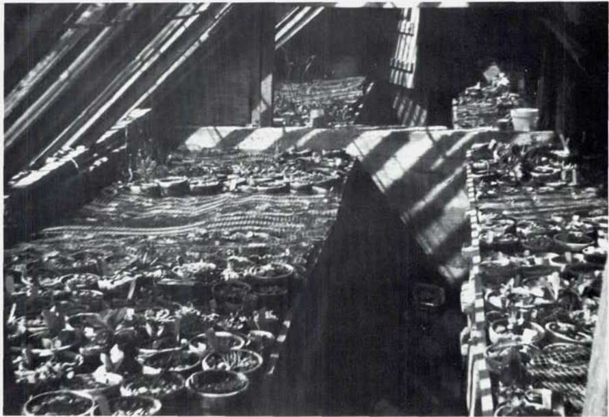
View of the Alpine House from the Entrance