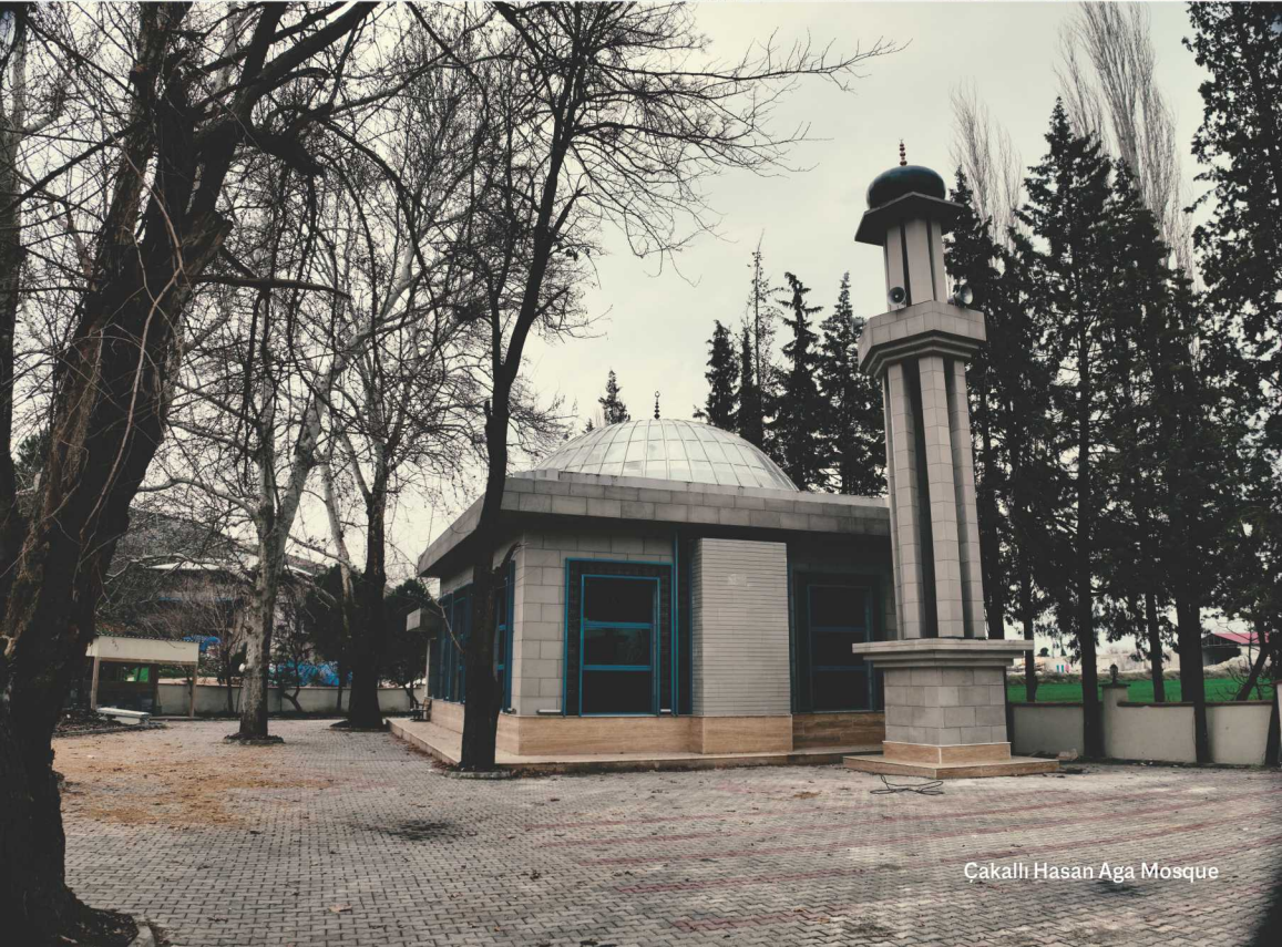
Çakallı Hasan Ağa Mosque