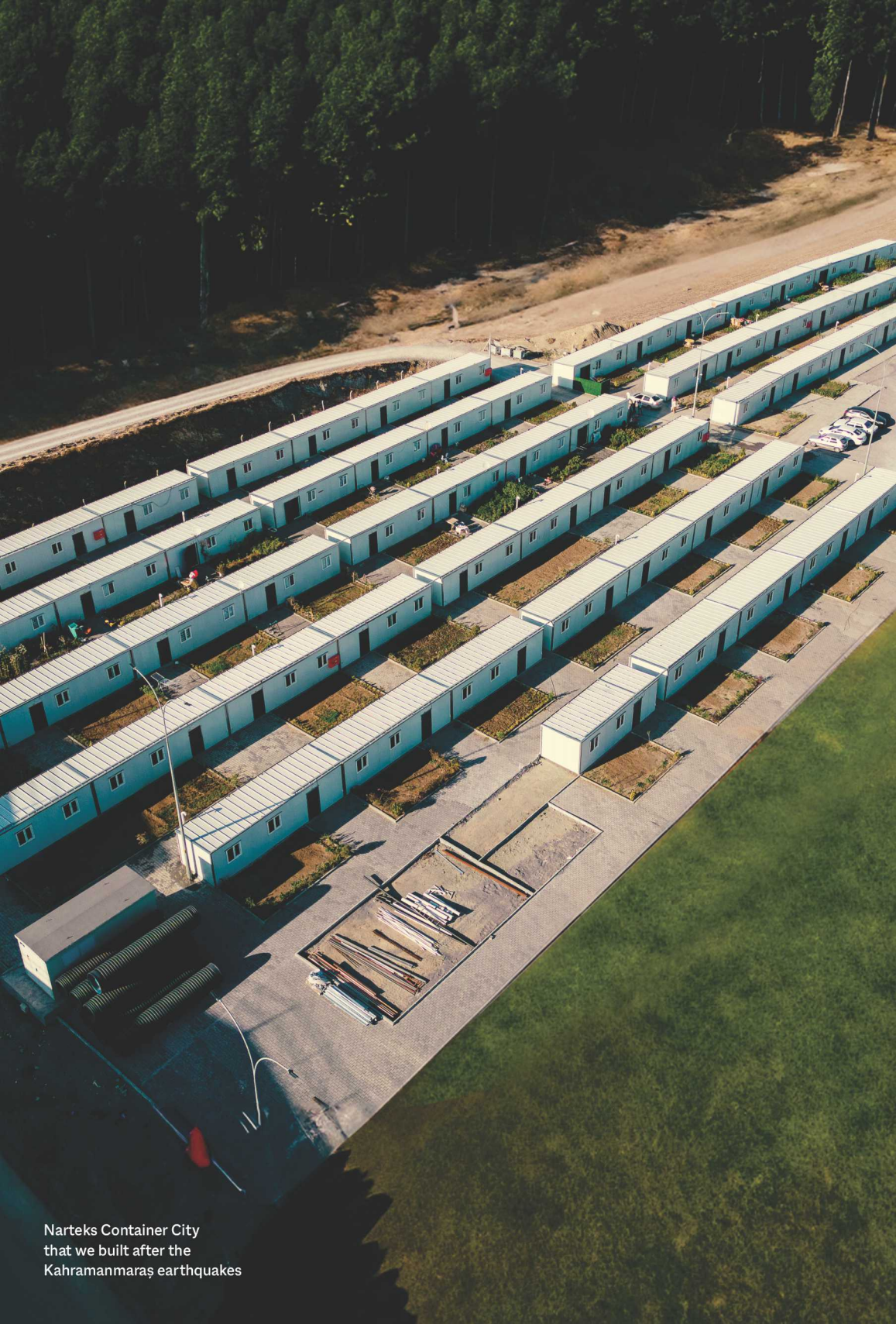
Narteks Container City that we built after the Kahramanmaraş earthquakes