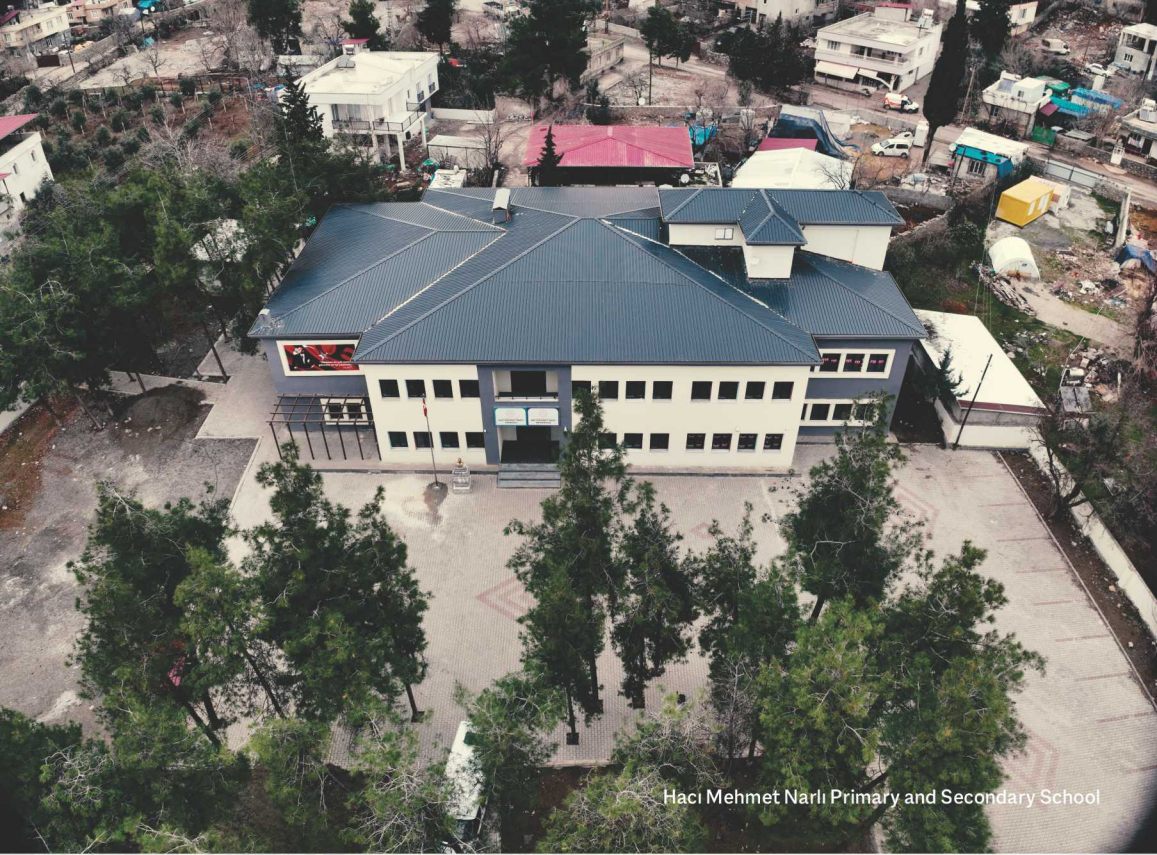
Hacı Mehmet Narlı Primary and Secondary School