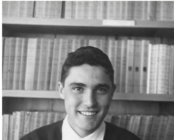
Gian-Carlo Rota, 1943.

Rota did his doctoral research under the direction of Jacob T. Schwartz and defended his thesis, “Extension Theory of Differential Operators,” in 1956. His account of the time he spent at Yale (“Light Shadows,” Chapter 2 of Rota 1997) was uncharacteristically mellow, even nostalgic: “In New Haven...the light shadows are softened in a silky white haze, which encloses the colleges in a cozy aura of unreality.”