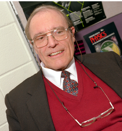
Above and right: Gian-Carlo Rota, circa 1996.

always the hope that others might work his beloved areas of mathematics and philosophy better than he did. Or, as Ariosto put it, Forse altri canterà con miglior plectro (“Perhaps another will sing with a better plectrum”). 5