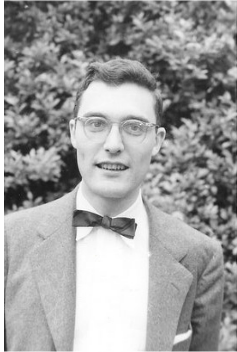
Gian-Carlo Rota, 1955.

During what turned out to be his later years, Rota was haunted by the fear that, like two of his closest friends—Stanislaw Ulam and Nick Metropolis—he would succumb to the infirmities of old age—“go gaga”, as he put it. He wrote that “the etiquette of old