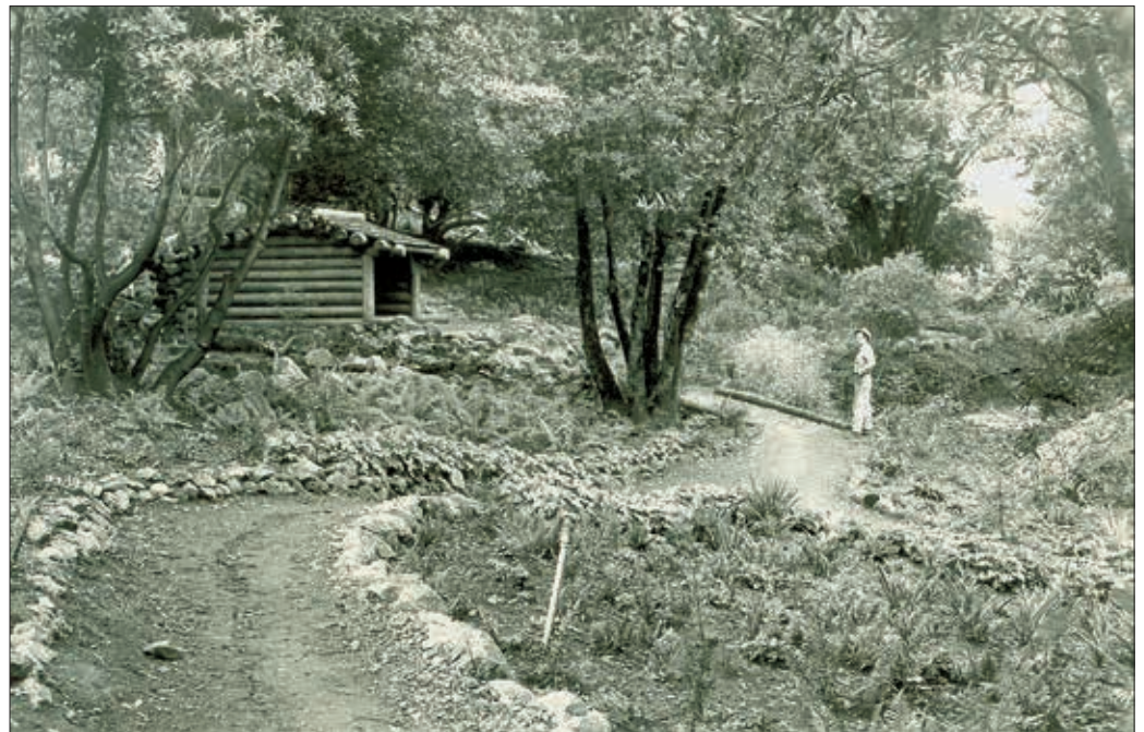
Jim Roof in a south-facing view of the Ferndale section of the garden along Wildcat Creek in November 1941. The small building was relocated to the garden from Norway's ski lodge exhibit at the 1939 Golden Gate International Exposition on Treasure Island.