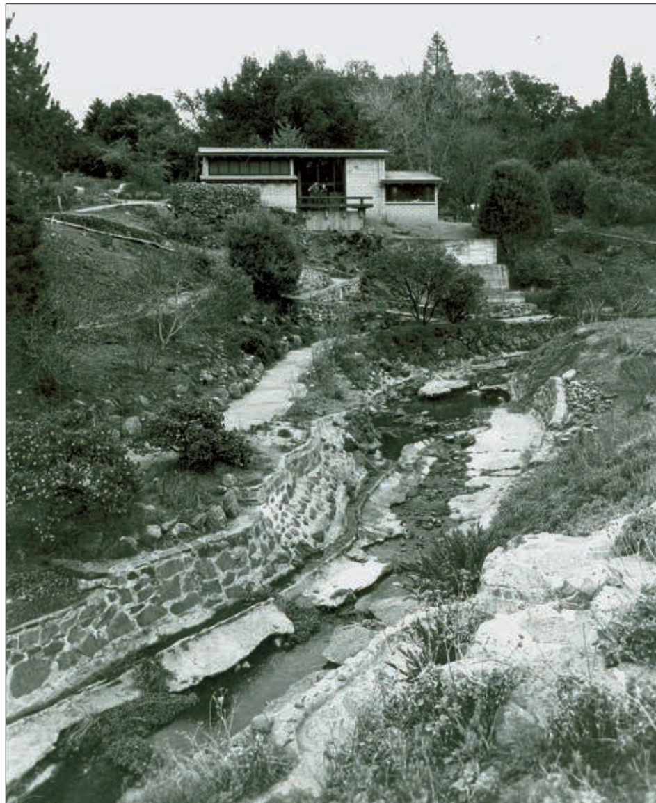
Current Visitor Center building and stone work along the creek in the early 1970s