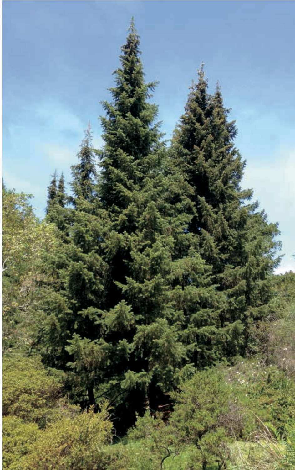
Santa Lucia firs ( Abies bracteata ) in Botanic Garden bed 208

saplings in containers for nine years before Contra Costa Hills Club volunteers planted them in two groves in the garden on Arbor Day (March 7) 1947.