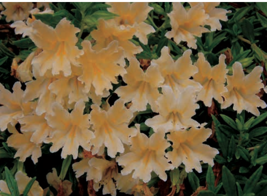
Large-flowered bush monkeyflower ( Mimulus aurantiacus var. grandiflorus )

T he future of most gardens is shady—literally. Gardeners plant young trees and shrubs amongst showy annuals and perennials, and as time passes, there are more and larger woody plants and fewer wildflowers. Here at the Regional Parks Botanic Garden, we have deliberately followed that trajectory in most of the northern half of the garden, but thankfully, also by diligent effort, the southern portions of the garden have retained their original sunnier dispositions.