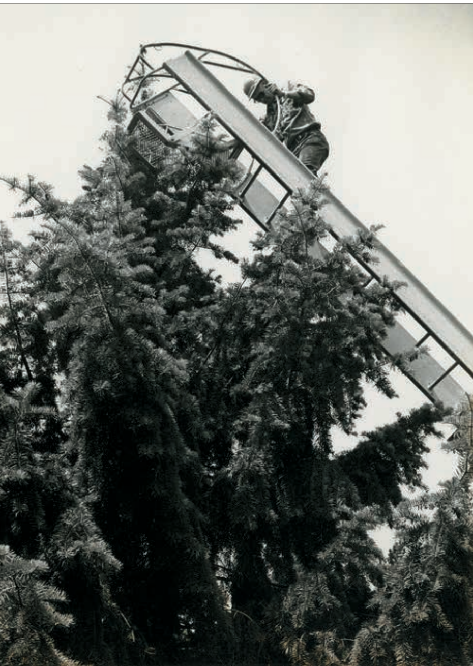
When the Marble Cone fire of 1977 burned 175,000 acres in the Santa Lucia Mountains and killed many of the firs, foresters were able to collect quantities of good seed from trees in the Botanic Garden.