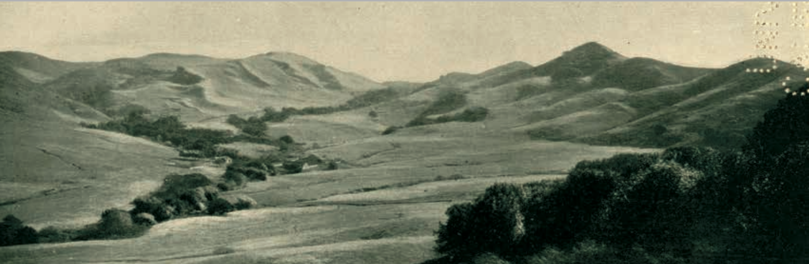
Southeast-facing view of the Botanic Garden site and the head of Wildcat Creek between San Pablo Ridge (left) and Frowning Ridge (right) in 1901

Volume 19, Numbers 1 & 2 • Published by the Friends of the Regional Parks Botanic Garden • Winter/Spring 2015