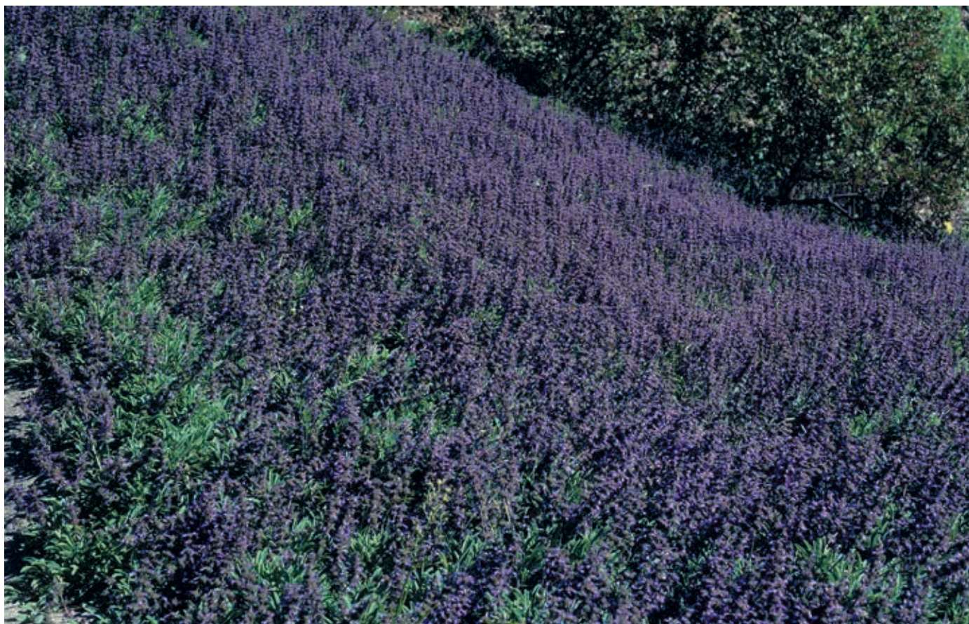
Sonoma sage ( Salvia sonomensis ) covers a slope in the garden's Valley-Foothill section.