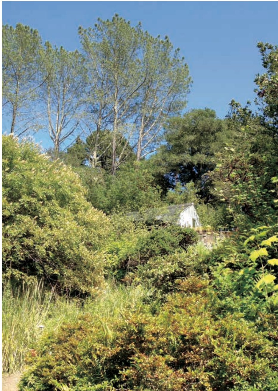
Torrey pine ( Pinus torreyana ssp. insularis ) from Santa Rosa Island growing in the Botanic Garden

On October 31, 1940, 22 young pines were planted at the far end of the Channel Island section, all around the then-new original garden office. At the time the trees were planted from five-gallon cans, they measured 48 inches tall. Mrs. Marion Copley reported that they produced their first cones when they were 27 years old, in September 1965. The seeds were viable, and a seedling was noted in 1967. Currently, there are nine mature specimens in this grove. I suspect that the trees planted across Wildcat