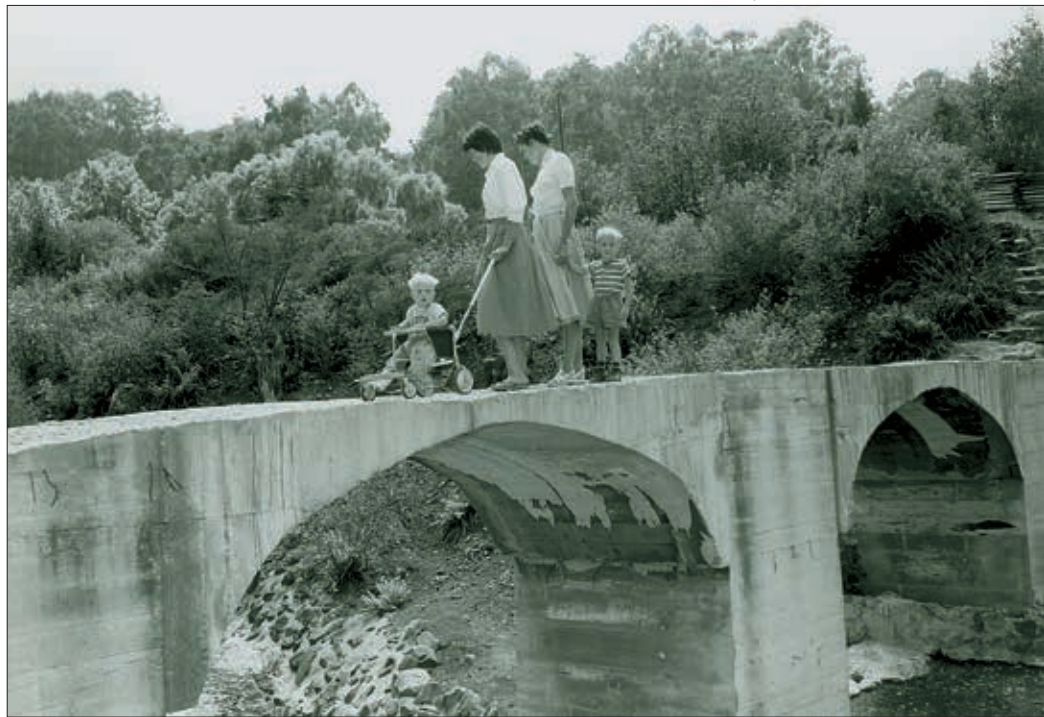
The biggest bridge in the garden without railings or decorative rock facing in 1959

For example, Jim recognized that there were many different forms of white fir ( Abies concolor ). He collected a form of white fir from Meeks Bay at Lake Tahoe that displayed beautiful, sweeping branches, hoping that such a form would maintain itself in garden cultivation. There was also a blue-leaved form of white fir he selected from Mount Pinos and grew in the garden. Jim told me white firs often lose their lower branches in cultivation, so he was always looking for forms that would hold them. It was his hope that the Meeks Bay and Mount Pinos forms would do so. Unfortunately, neither did for long. Jim also relished a particularly low and prostrate form of dwarf juniper from Point Saint George in Crescent City. He later described this juniper as the