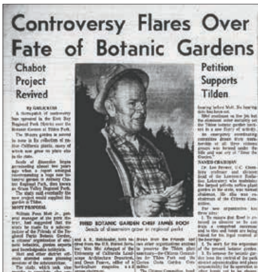
Oakland Tribune, April 1, 1965