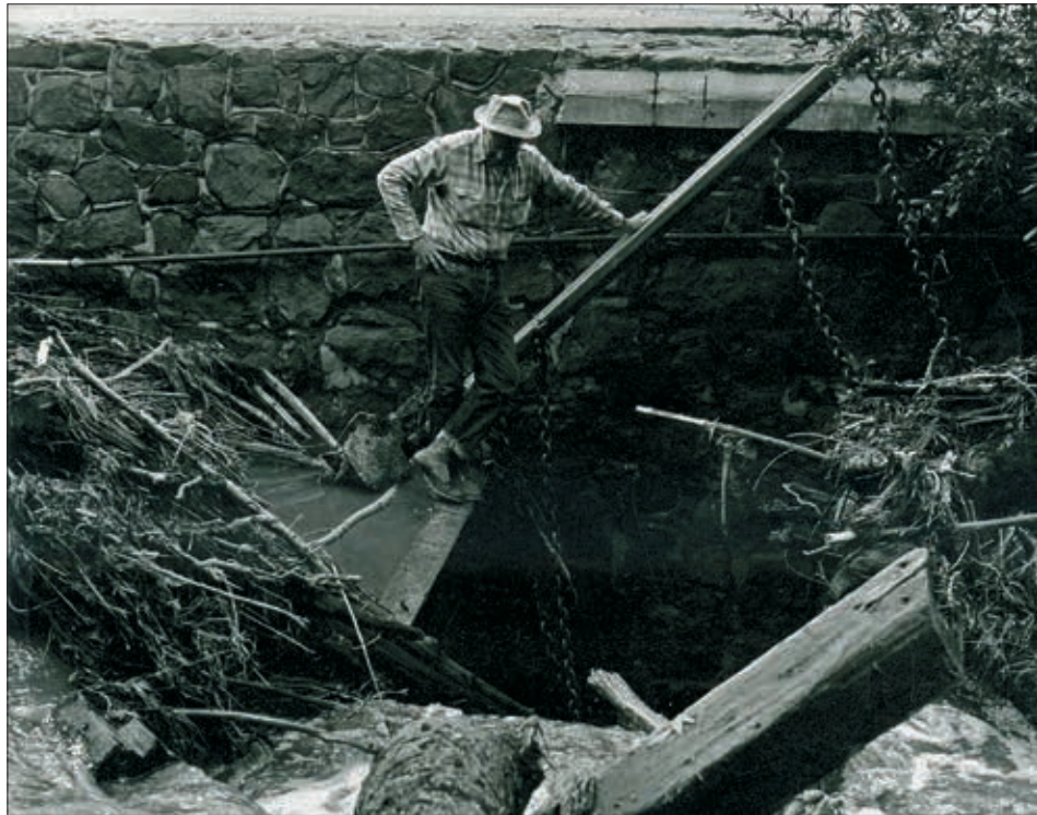
Jim Roof inspecting storm damage to the main culvert that channels Wildcat Creek under Wildcat Canyon Road and into the Botanic Garden

minute and put in the camouflage corps in Europe. When he got back in 1946, he deliberated for two months about whether he should come back and take this job on again. There was 15-foot-high poison oak covering much of the garden along with big oak and bay laurel saplings and coyote bush. The thousands and thousands of plants that came from