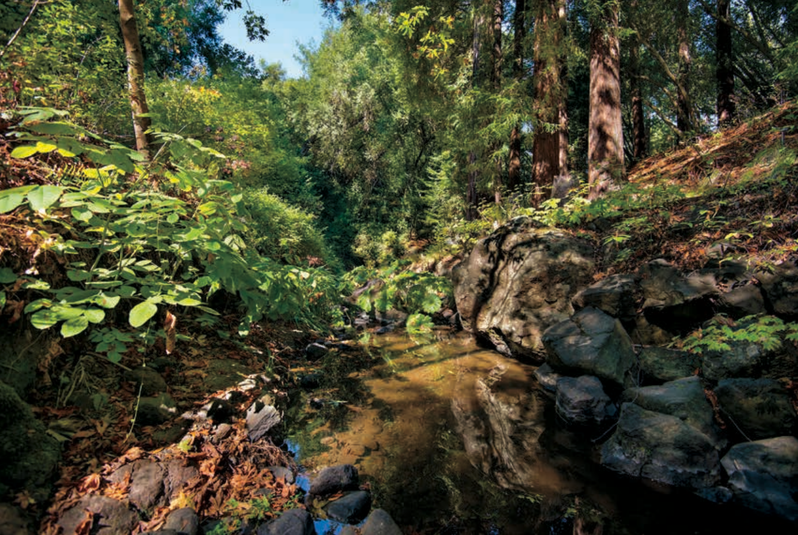
Wildcat Creek in the Regional Parks Botanic Garden