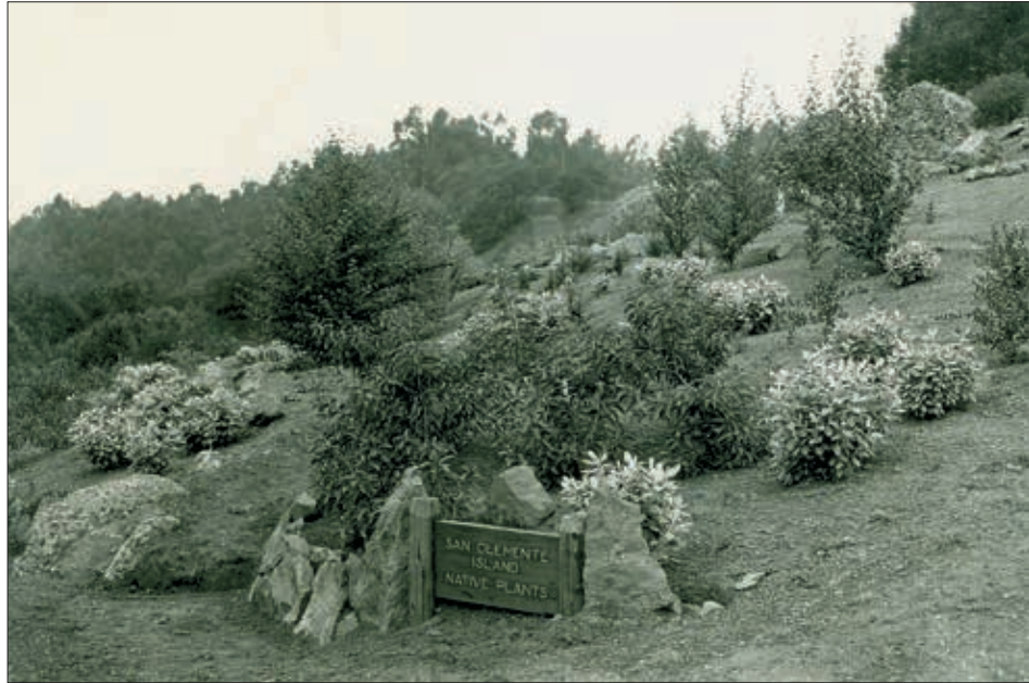
San Clemente Island area, one of eight Channel Island units comprising the original Garden of the Channel Island Plants, circa 1941