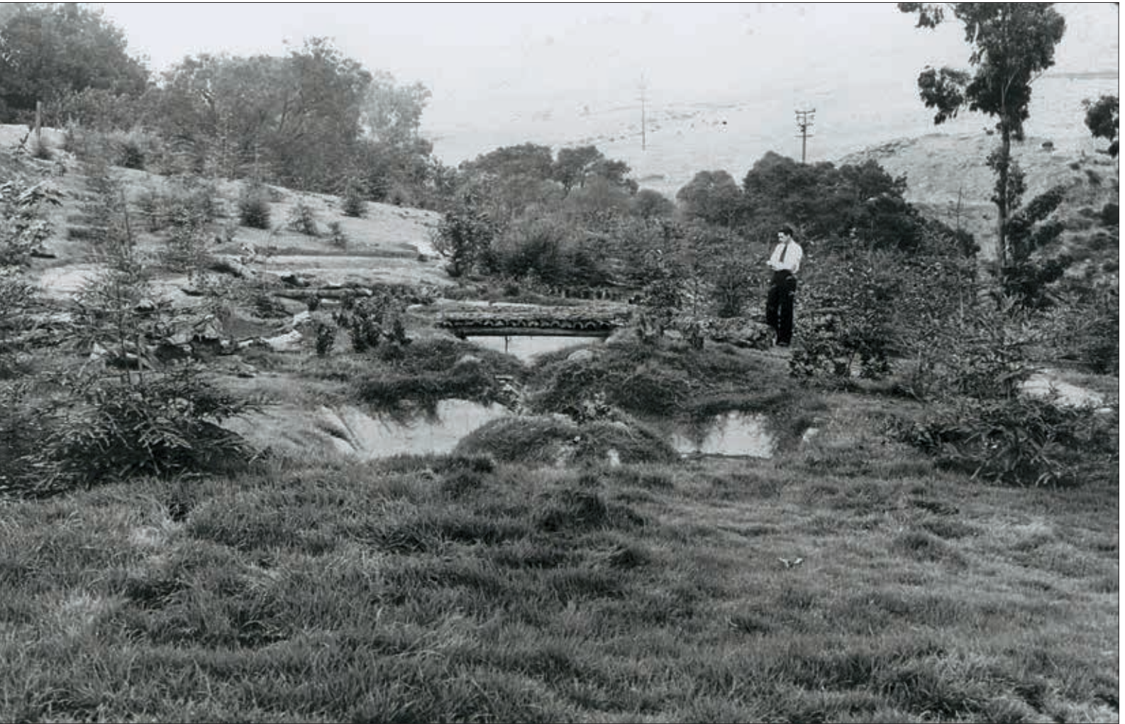
North-facing view of the original Redwood Garden in November 1941. The redwood trees survived Jim Roof's absence during WWII and are now nearly 150 feet tall.