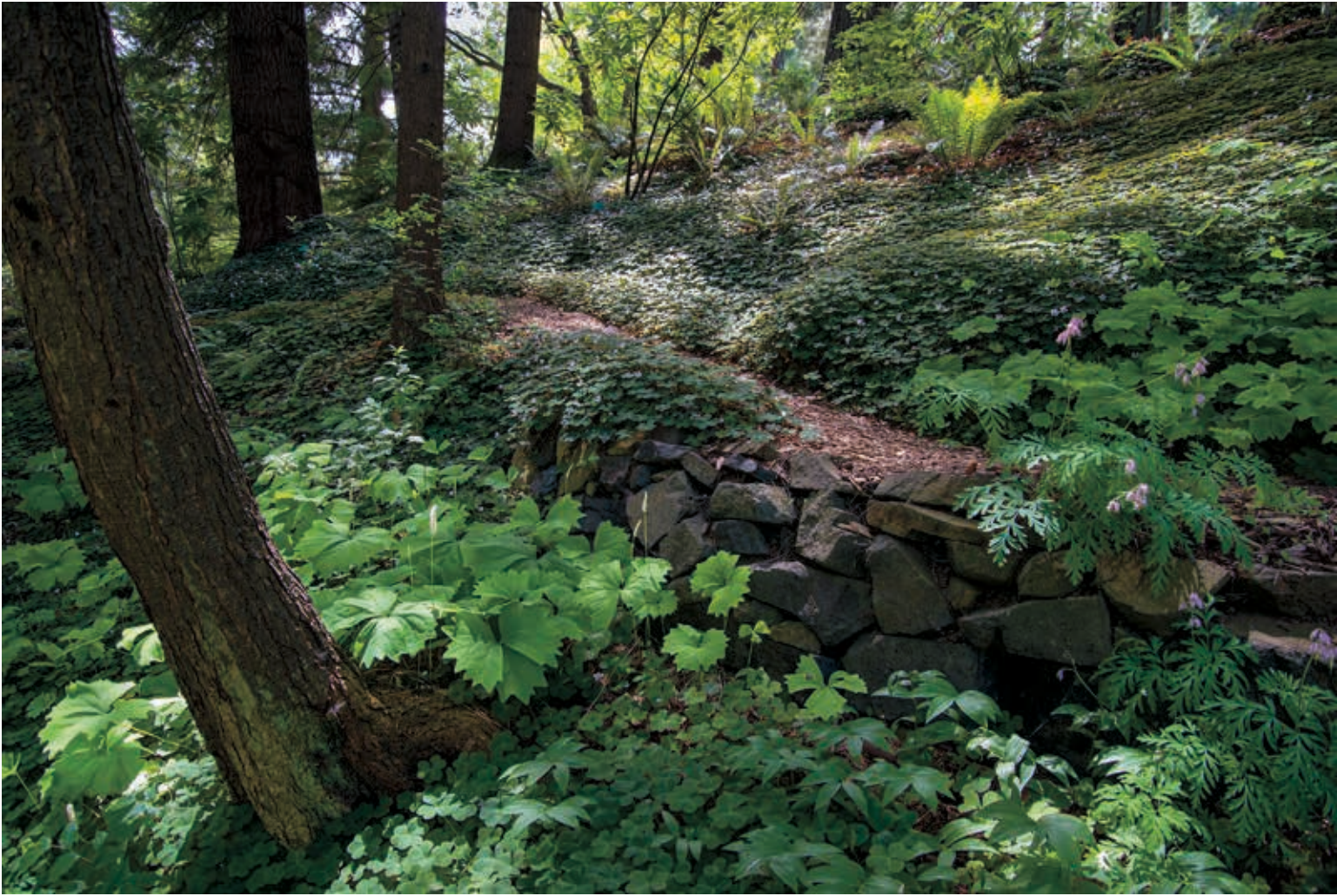
The Botanic Garden's shady and beautiful Pacific Rainforest section