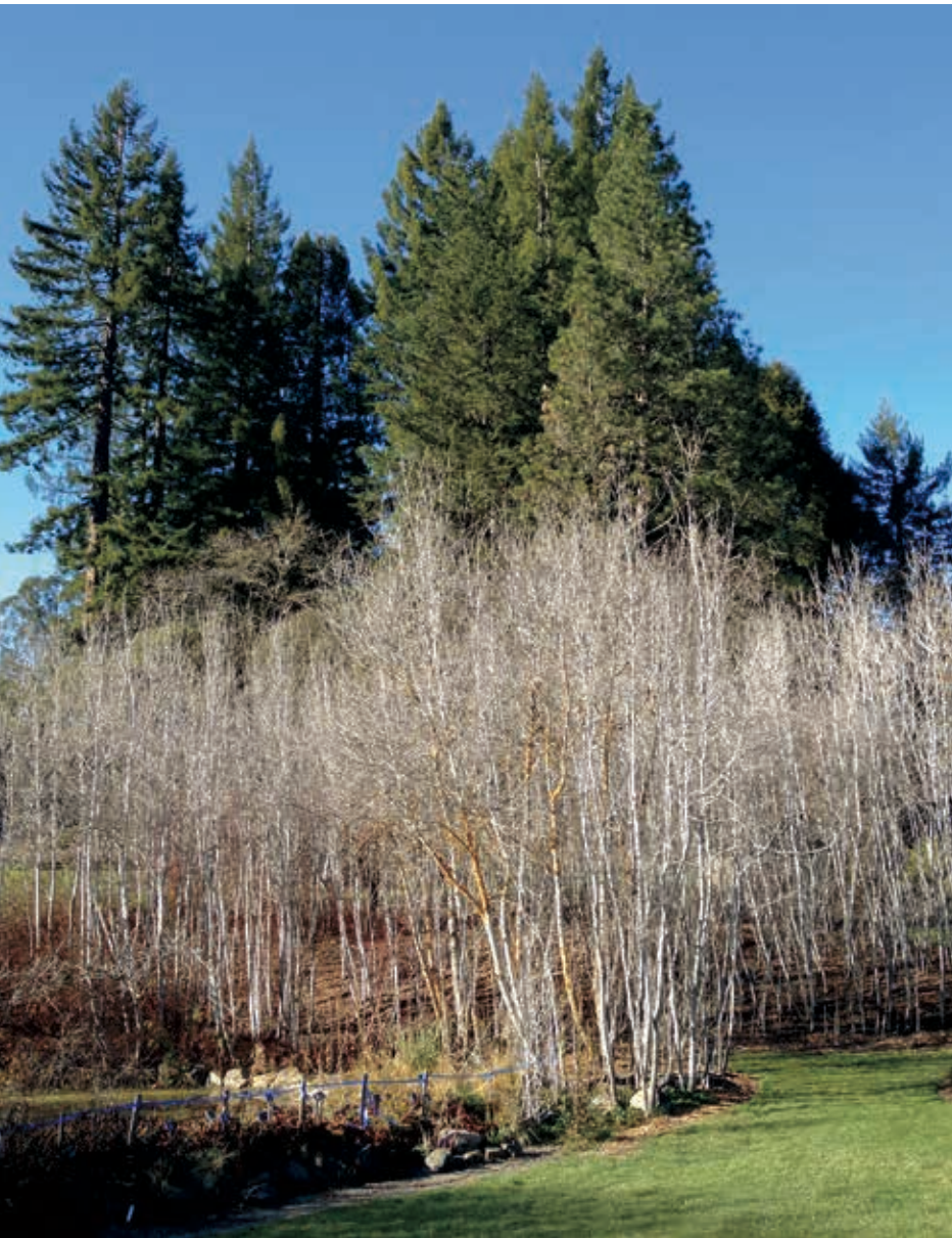
The garden's largest grove of quaking aspens ( Populus tremuloides )