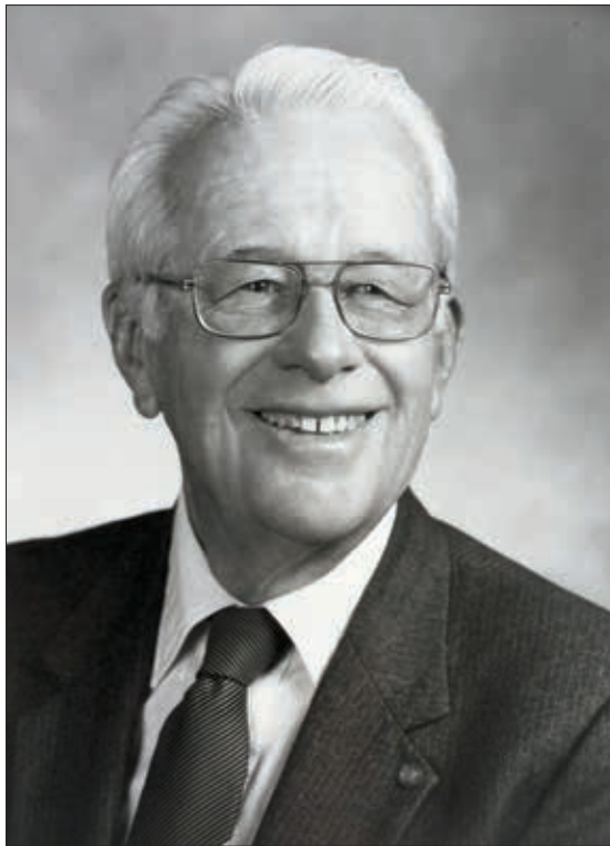
William Penn Mott, Jr.

The Park District's first four parks, including the Botanic Garden, were developed over a six-year period between 1936 and 1942, largely with CCC (Civilian Conservation Corps) and WPA (Works Progress Administration) labor and federal funds. During World War II, Roof and most other park employees were drafted, leaving the two-year-old garden abandoned until he returned to rescue surviving plants that had been overgrown with weeds. Long stretches of backbreaking work and extensive collection from the wild were required to re-establish