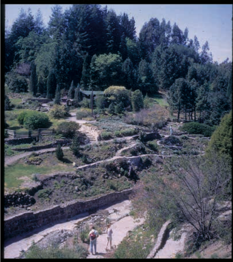
Above: Northwest-facing view of Wildcat Creek and the Juniper Lodge building in 1970