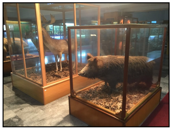
Figure 2. Cases containing stuffed mammals in the natural history collection, Aristotle University of Thessaloniki

During a visit to the collection in May 2019, a heavy infestation of carpet beetles was noted in cases containing the skulls of different species of caprid (Figure 5). The pest species was subsequently identified as A. flavipes . The beetles had caused a great deal of damage (Figure 5). The larvae were concentrated in the younger keratin layers close to the bone whilst the tougher, outer horn was largely undamaged. The infestation must have been present for at least two years since