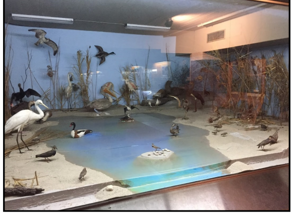
Figure 4 . A diorama illustrating typical avifauna in Greek wetlands, Aristotle University of Thessaloniki.