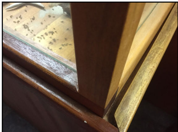
Figure 6. Wooden casing used to house natural history specimens, Aristotle University of Thessaloniki.

Holloway and Pinniger (2020) described how to identify the species of Anthrenus likely to be found in museums in the UK. The common species encountered are A. verbasci and A. sarnicus . A. fuscus is occasionally found inside buildings. Despite the name, A. museorum is virtually never found indoors, at least in the UK.