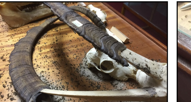
Figure 5 . Damage to horny material on wild goat (Capra aegagrus) skulls by Anthrenus flavipes, Aristotle University of Thessaloniki. Many larval exuviae and adult insects, along with dust from feeding activity, can be seen around the specimens.

many live larvae at different stages were present along with dead adults and the life cycle takes one year to complete in India (Kumar et al., 2013). It is not clear how the carpet beetles got into the caprid case. Although the case is never opened, it is unlikely that the caprids were introduced into the cabinet in an infested condition since they were brought into the collection at least 15 years ago. Anthrenus species are found on the wooded university campus, but mostly A. verbasci and A. isabellinus Küster 1848 (Holloway et al., 2020). Whilst A. verbasci is a serious museum pest, A. isabellinus is not.