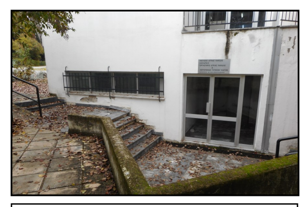
Figure 1 . Natural history collection, Aristotle University of Thessaloniki.

An extensive collection of stuffed animals is housed at the School of Forestry and Natural Environment in the Aristotle University of Thessaloniki, Greece. The building housing the collection (Figure 1) was opened in 1992 and the collection hall covers approximately 500m<sup>2</sup>. The building sits amongst other university buildings within a forest-botanic garden. Prior to 1992, the specimens were scattered throughout the old university buildings, but in their current cabinets. Many of the specimens date from 1935-1950,