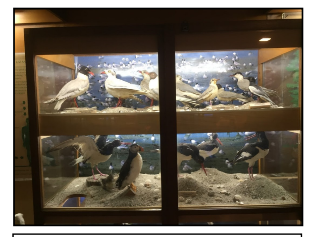
Figure 3 . A case containing stuffed birds in the natural history collection, Aristotle University of Thessaloniki.