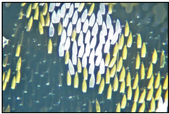
Figure 10 . Anthrenus verbasci elytral scales (x200 magnification).