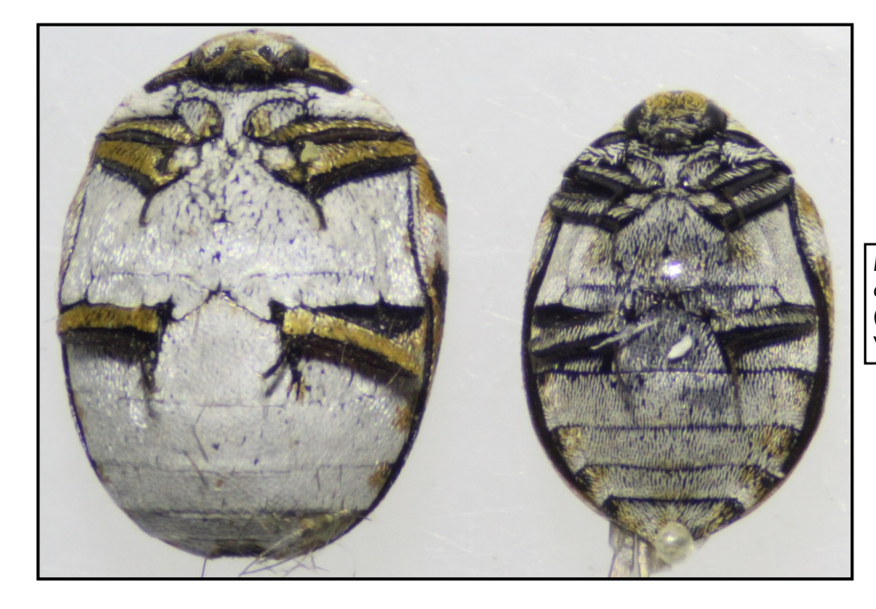
Figure 8 . Ventral surfaces of Anthrenus flavipes ( left ) and Anthrenus verbasci ( right )

Figure 7. Dorsal surfaces of Anthrenus flavipes ( left ) and Anthrenus verbasci ( right ). Scale = 1 mm.