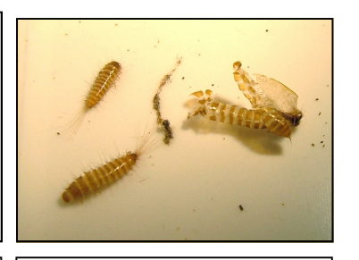
Fig 3 Trogoderma angustum larvae and cast skins