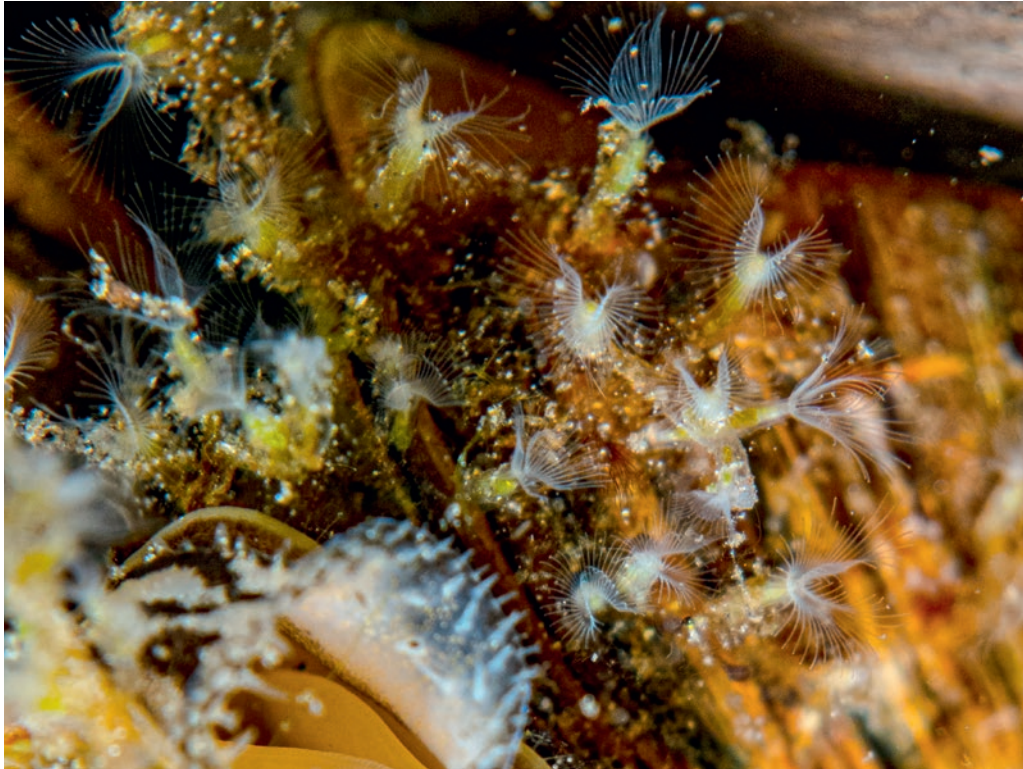
Fig. 5: Underwater macro photograph of Plumatella sp. on a zebra mussel Dreissena polymorpha at 2 m depth in the Large Lake of Monticolo/ Montiggl on May 31 st , 2015 (Photo by Andrea Falcomatà).

It may be assumed that Cristatella mucedo is also present in other water bodies in South Tyrol. Further studies are required to be able to assess the actual distribution in the Province of Bolzano/Bozen.