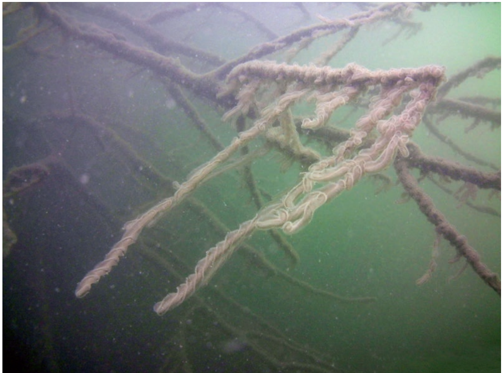
Fig. 3: Underwater picture of colonies of C. mucedo on submerged branches in the Large Lake of Monticolo / MontiggI at a depth of 4 m on October 3 rd , 2019. Numerous long colonies twisted between them forming cords up to about 40 cm long hung from the thinnest branches of the submerged tree. The cordons of colonies are arranged diagonally because they were moved by a light water current at the time of the shot.