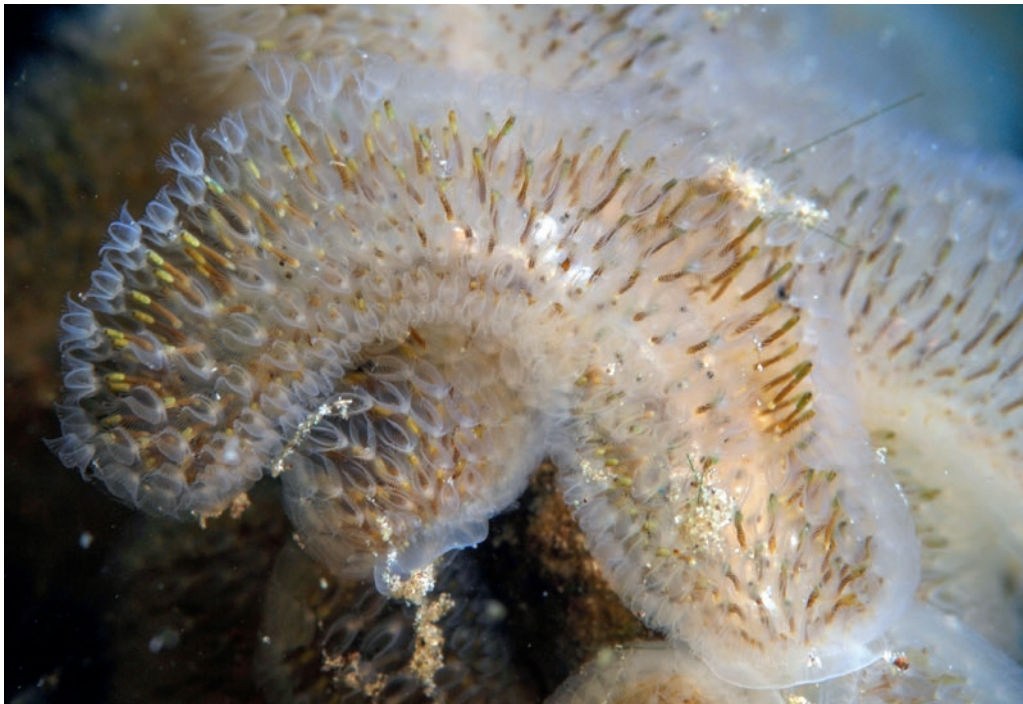
Fig. 1: Underwater macro photograph of a colony of Cristatella mucedo (about 3 cm in length) at 4 m depth in the Large Lake of Monticolo / Montiggel on September 26 th , 2019.

scuba dive computer Uwatec Aladin Prime. Underwater macro photographs of bryozoans were taken with digital SLR camera Nikon D80 with 60 mm macro lens in underwater housing Sealux CD80 and one flash Sea & Sea YS-110 alpha in manual mode. Underwater wide-angle images and video were taken with an action cam Coouu CU-SPC05 with natural light. Colonies of bryozoans were measured underwater with a steel Vernier caliper in mm ( \pm 1 mm).