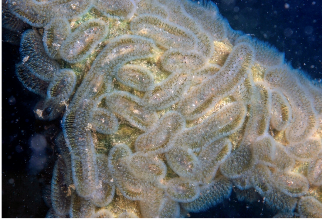
Fig. 2: Colonies of C. mucedo on a submerged branch at 3 m depth in the Large Lake of Monticolo / MontiggI on September 26 th , 2019 (Photo by Massimo Morpurgo).