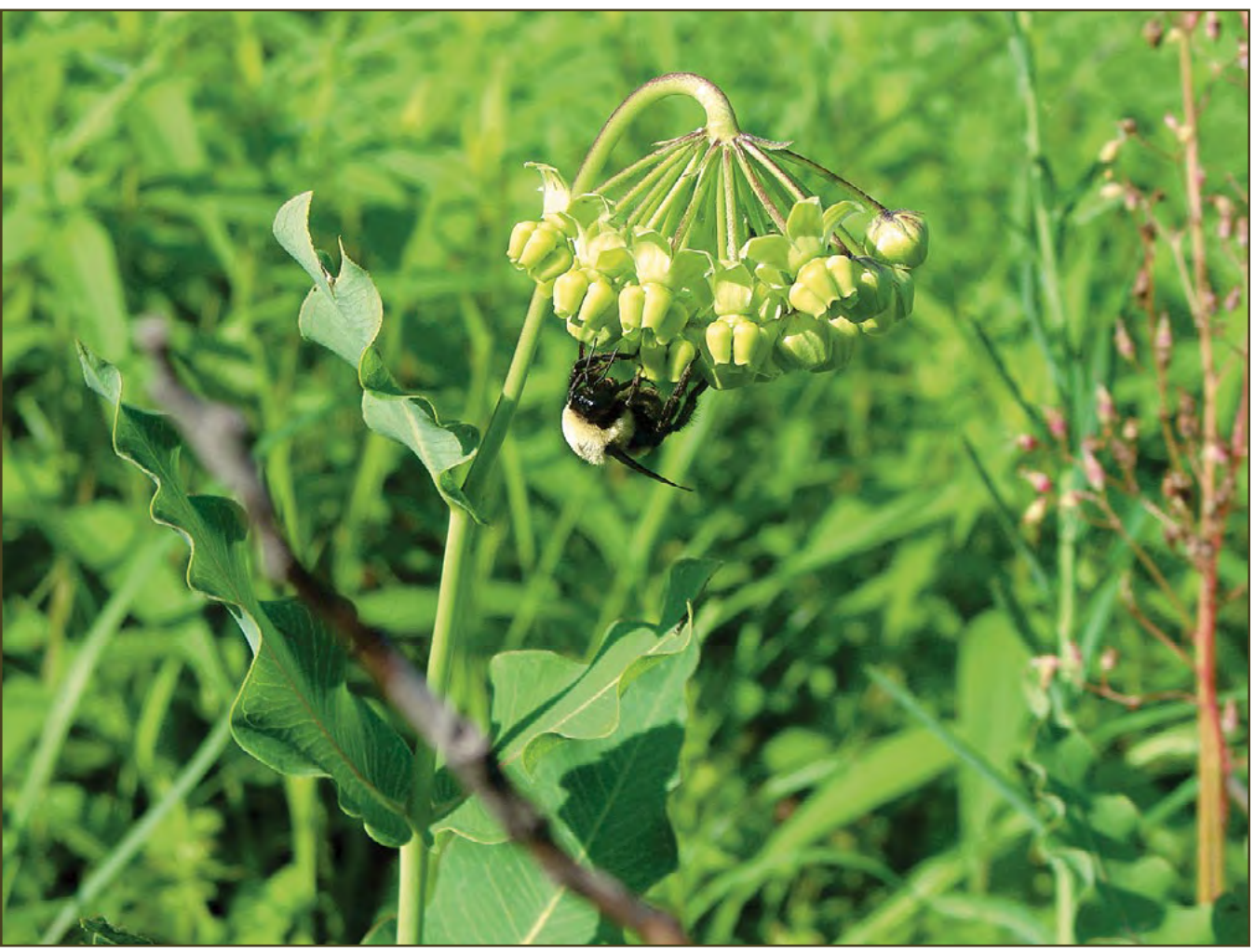
Image 2. A Mead's milkweed flower possibly pollinated with the help of a Brown-belted bumblebee (Bombus griseocollis.)

rugged terrain of the St. Francois Mountains, including the igneous glades containing populations of Mead's milkweed. Hog damage control on federal, state, and private lands include trapping, aerial gunning as well as electric fencing to deter hogs from entering glades with the best populations of Mead's milkweed. These efforts are instrumental to protecting populations from severe damage. Control efforts are making significant progress on feral hog eradication, but feral hogs remain a known threat in the region.