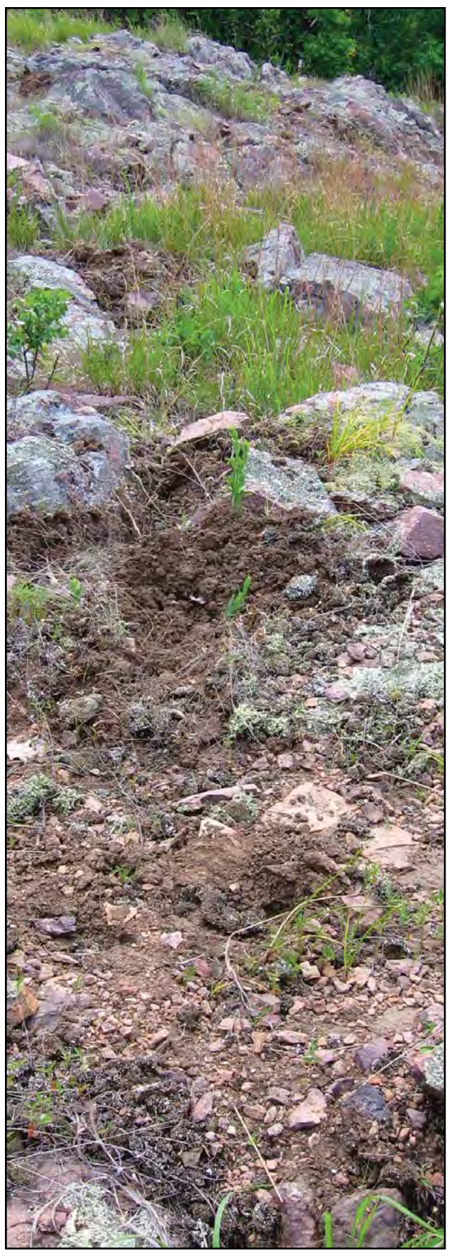
Image 1. Mead's milkweed and other vegetation uprooted and destroyed by feral hogs in the St. Francois Mountains.

protected, high-quality remnants. The species is currently listed as federally threatened and state endangered in Missouri.