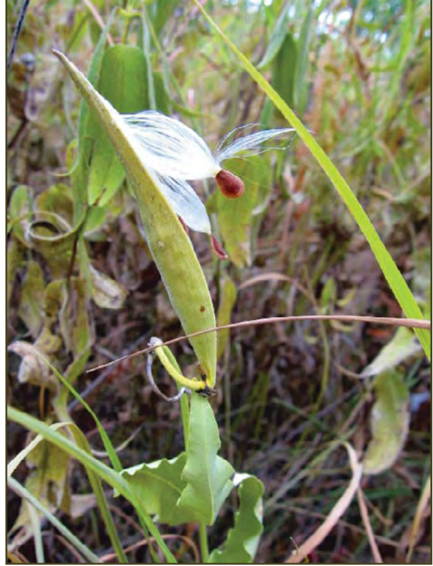
Image 3. Wind-dispersed seed of Mead's milkweed waiting for the next breeze.

Since 2011, biologists have planted over 700 Mead's milkweed seedlings throughout the tallgrass prairie range in Missouri. Eight sites were selected based on three criteria: suitable habitat, having a management plan for those lands that included burning or having at least once every 3 years, and the proximity to only a few remnant plants or historic locations of Mead's milkweed. Twenty to thirty percent of seedlings have persisted at sites planted 13 years ago. Data also show that stems remain dormant on occasion. Between 2011 and 2017, 600 transplants were monitored each year. Presence data was collected at each transplant location. Observations of extended periods of dormancy were recorded as plants remained dormant for I or more years,