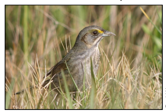
Seaside sparrow is a common but declining denizen of tidal marshes.