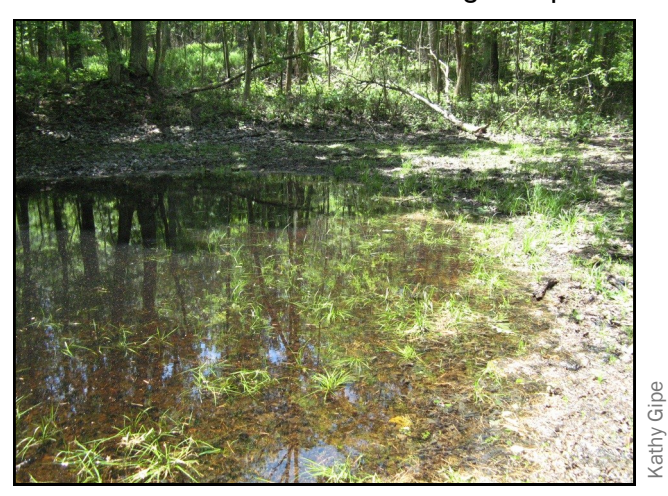
Eastern spadefoot toads require fish-free, isolated ephemeral ponds for breeding.

After heavy summer rains, we sampled vernal pools in Centre County for evidence of breeding of the eastern spadefoot. One pool was documented as a breeding site for the elusive toad, a state endangered species.