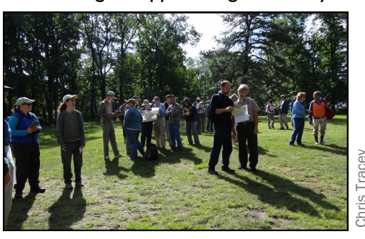
Bioblitz leaders organized taxa groups before heading out to survey areas of the park.

On June 2 and 3, PNHP and DCNR coordinated a BioBlitz at Kings Gap Environmental Education Center situated on South Mountain in Cumberland County. The BioBlitz, which is a popular term for an effort to document as many living things as possible in one place in one 24-hour period, was an opportunity for PNHP and state parks staff to work together with the public and experts from across the state on a comprehensive inventory of Kings Gap. Over 80 people participated in the BioBlitz including professionals from several state agencies, non-profits, museums, universities, and clubs, such as the Carnegie Museum of Natural History, Duquesne University, Dickinson College, York College, Shippensburg University,