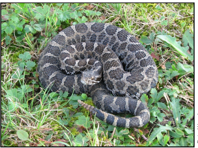
Eastern massasauga rattlesnake

Timber rattlesnake surveys were conducted in Fayette, Centre, Clearfield, Lycoming, Somerset, and Sullivan Counties, and a good number of critical basking areas have been documented. Survey efforts also targeted the state-endangered eastern massasauga, at both known populations and at potential habitats.