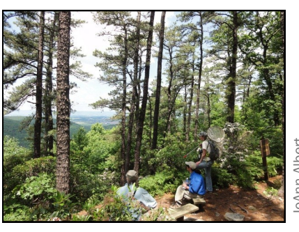
The insect team installed blacklight traps along the Scenic Vista Trail.

The insect team documented a total of 222 insect species in both terrestrial and aquatic habitats. Despite the low diversity, the surveyors recorded four uncommon dragonflies and damselflies as well