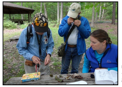
The Eastern Penn Mushroomers identified 58 species of mushrooms.

The Eastern Penn Mushroomers provided expertise for the fungi taxa at the BioBlitz and noted the unexpected diversity of species recorded at a time of year when fungi are usually sparse. Of note were two