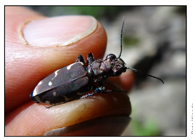
Appalachian tiger beetle

Surveys on State Forests continue to yield interesting finds. In Forbes State Forest, PNHP surveyors found a population of the globally rare Appalachian tiger beetle ( Cicindela ancocisonensis ). Although Pennsylvania is in the middle of the range of this species, there are very few recent records from the commonwealth.