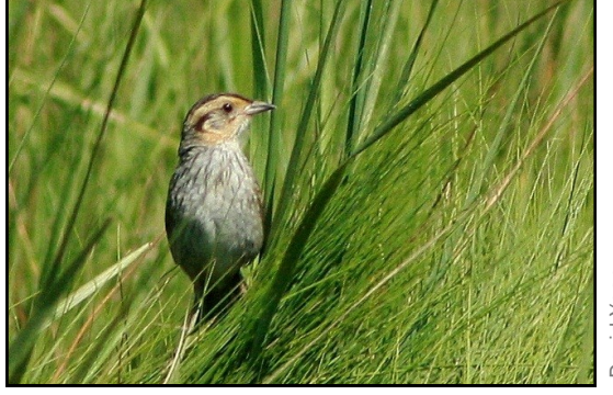
Saltmarsh sparrow is a globally vulnerable species confined to the high marsh zone of Atlantic coastal wetlands. Nests are constructed in patches of short smooth cordgrass and saltmeadow hay found in the high marsh zone.

In total, we recorded 138 bird species with some of the highlights including each of the focal species: 97 American black ducks, 833 clapper rails, 434 willets, 999 seaside sparrows, 211 saltmarsh sparrows, and 5 Nelson's sparrows (total detection). Adding to the success of the survey we also detected 219 Virginia rails, 33 least bitterns, 10 king rails, 9 common moorhens, one pied-billed grebe, and an American bittern. These data will be used to estimate population numbers for tidal marsh birds, map breeding distributions, determine population changes over the past two decades, and identify the most critical areas for tidal marsh bird conservation and habitat protection.