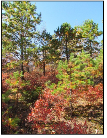
Pitch pines and low shrubs thrive in the sandy soils of barrens habitats.

In 1993, the Clinton County Natural Heritage Inventory noted the Slaughtering Ground Barrens located on the rolling terrain of the High Allegheny Plateau about 13 miles westnorthwest of Lock Haven. The barrens actually extend beyond the mapped Natural Heritage Area and include Bureau of Forestry (BOF) and