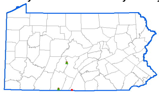
current data • records > 30 years old (1975) Pennsylvania Natural Heritage Program data 2005