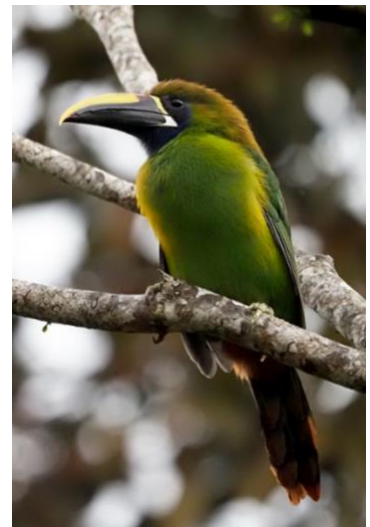
Northern Emerald Toucanet

Prong-billed Barbet Semnornis frantzii —We saw several of this bird that is a near-endemic to Costa Rica, with 4 each at BNBR and Santa Elena, then 2 at Mirador San Fernando during the extension.