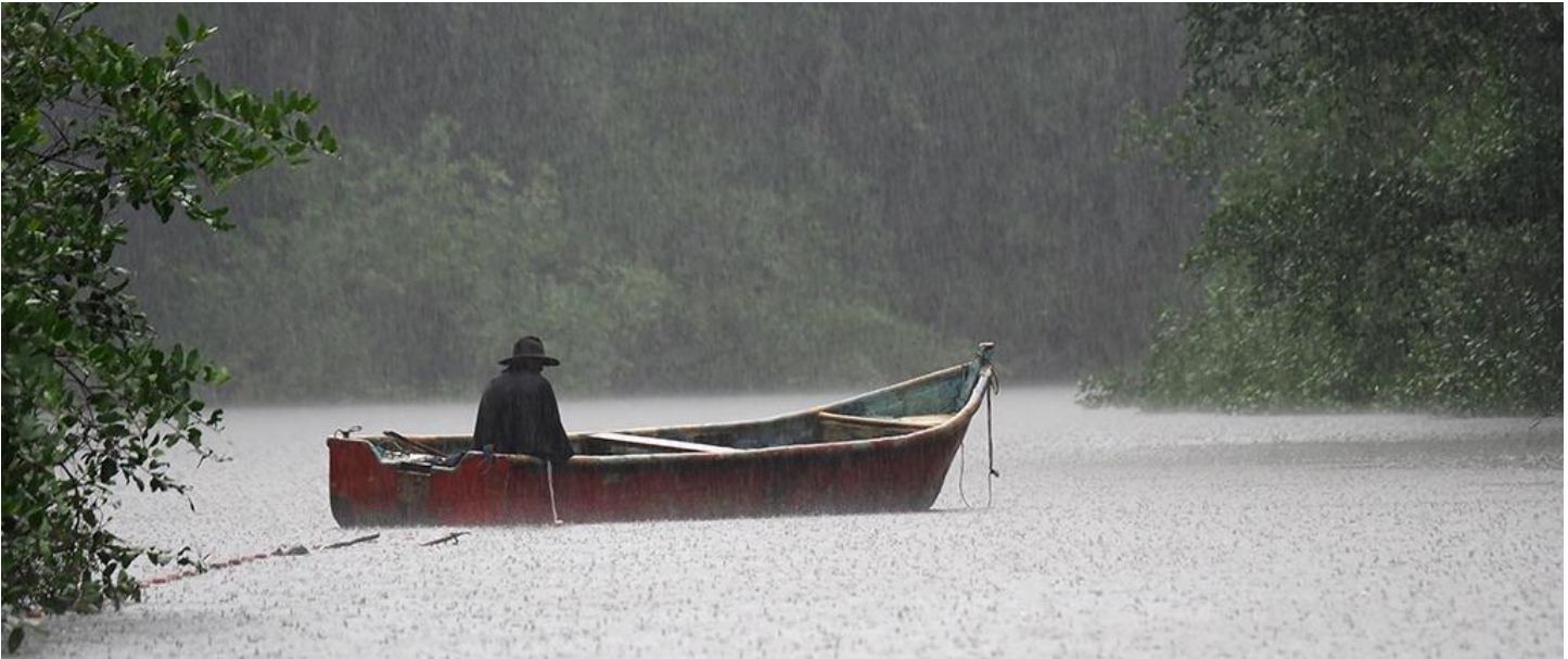
Rain on the Tarcoles River

Snowy Cotinga Carpodectes nitidus —(1) XO, a major highlight of the extension, this all-white bird was seen at