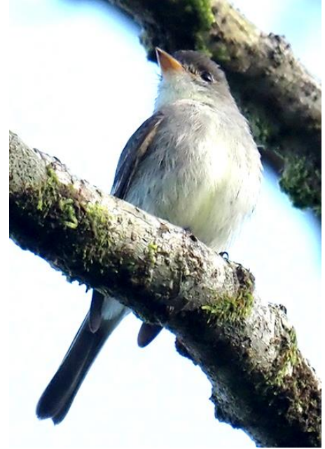
Northern Tropical Pewee

Great Kiskadee Pitangus sulphuratus —(10) Bar far the most widespread and most common flycatcher, seen or