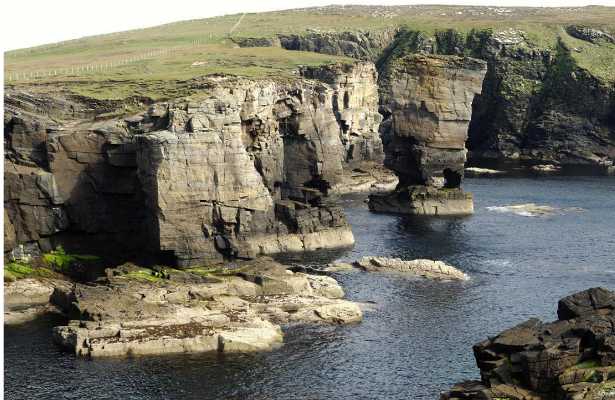
A sea stack and sea cliffs at Yesnaby, Orkney© Lorne Gill/NatureScot.

The relief of West Orkney Mainland is in the form of a basin tilted up at the north and east. Hill land, generally below 200 metres elevation, forms a gently sloping rim; flat land, with the lochs of Harray and Stenness and the smaller lochs of Boardhouse, Hundland and Swannay, forms the basin floor. The hill land of the West Orkney Mainland is generally smoothly undulating, with locally steep relief associated with the larger hills, for example Wideford Hill, Costa Hill, and the ridges around Settiscarth and Stenness. East Orkney Mainland and South Ronaldsay reach heights of over 80 metres, but lack strong relief. The highest areas are smoothly domed hills, for example Warthill on East Orkney Mainland and Ward Hill on South Ronaldsay. East Orkney Mainland also has an extensive plateau ridge which constitutes the main high ground. Tankerness and Deerness are both comparatively low, with smooth and undulating topography.