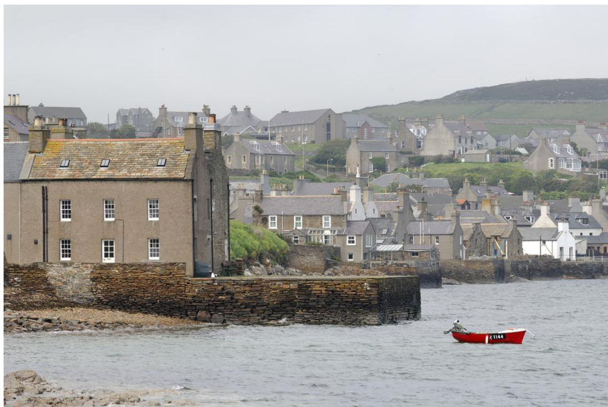
Stromness, Orkney.

The harbour towns and villages are generally densely developed with houses tightly packed around the bay, seeking to maximise access to the sea. Their development has often been concentric, as later developments were forced to locate inland behind the main road and harbour frontage. In some cases the raison d'être for the village has been lost, such as herring fishing ports like Whitehall on Stronsay, and their populations have declined.