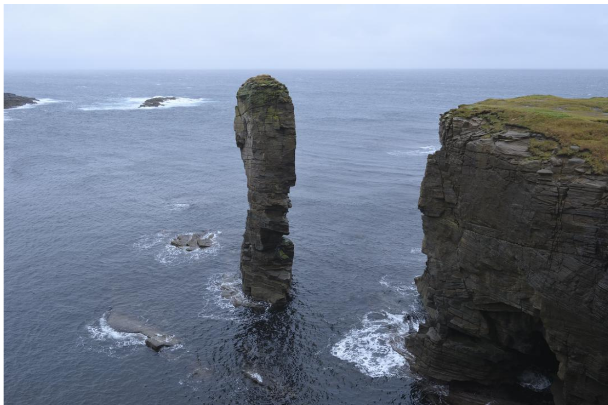
A sea stack and sea cliffs at Yesnaby, Orkney

The rise of sea level since the last glaciation is responsible for the "drowned" topography of Orkney. The submergence of the land, coupled with frequent strong winds and the erosive force of the sea, has been responsible for rapid marine erosion along the exposed coasts, particularly along the west coasts of Hoy and Orkney Mainland. This has produced the impressive cliffs with their geos (clefts), gloups (blow holes), natural arches, and stacks. The most famous stack is the Old Man of Hoy. The submergence of the landscape has also created the distinctive coastal valleys or 'voes' (narrow inlets).