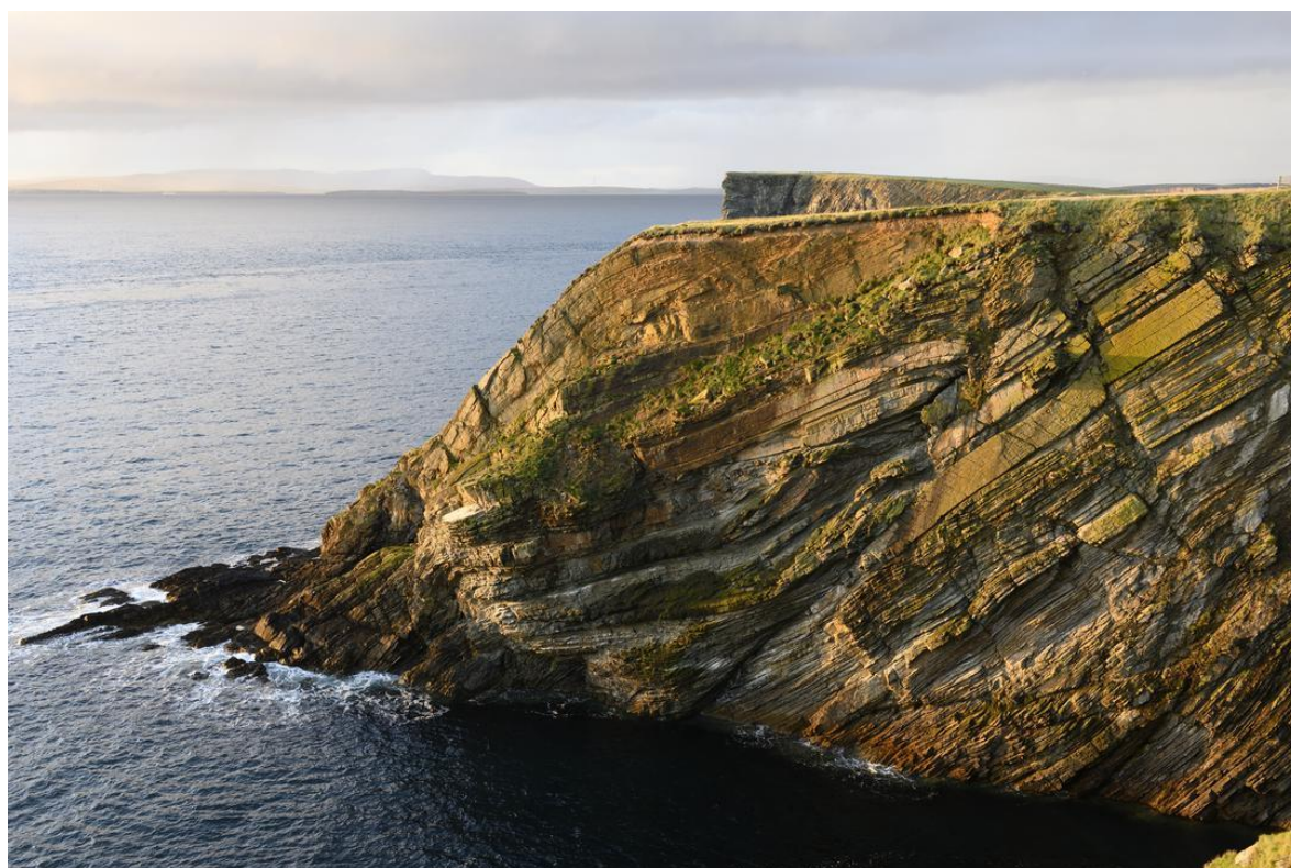
Folded Geology, Orkney

Sandstone age. The middle Old Red Sandstone falls into two major groups. The lower group comprising Stromness flags and Rousay flags is the dominant type through much of the area, on Orkney Mainland, Rousay, Stronsay, Shapinsay, Westray and Sanday. These rocks comprise sequences of thinly bedded grey and black siltstones and mudstones with alternating thin beds of sandstones. These flags vary in colour from pale to dark browns and greys. The upper group (Eday beds) comprises the lower, middle and upper Eday sandstone, and is generally confined to the North Isles and parts of East Orkney Mainland, although it is also present along the North Scapa and Brims Risa faults.