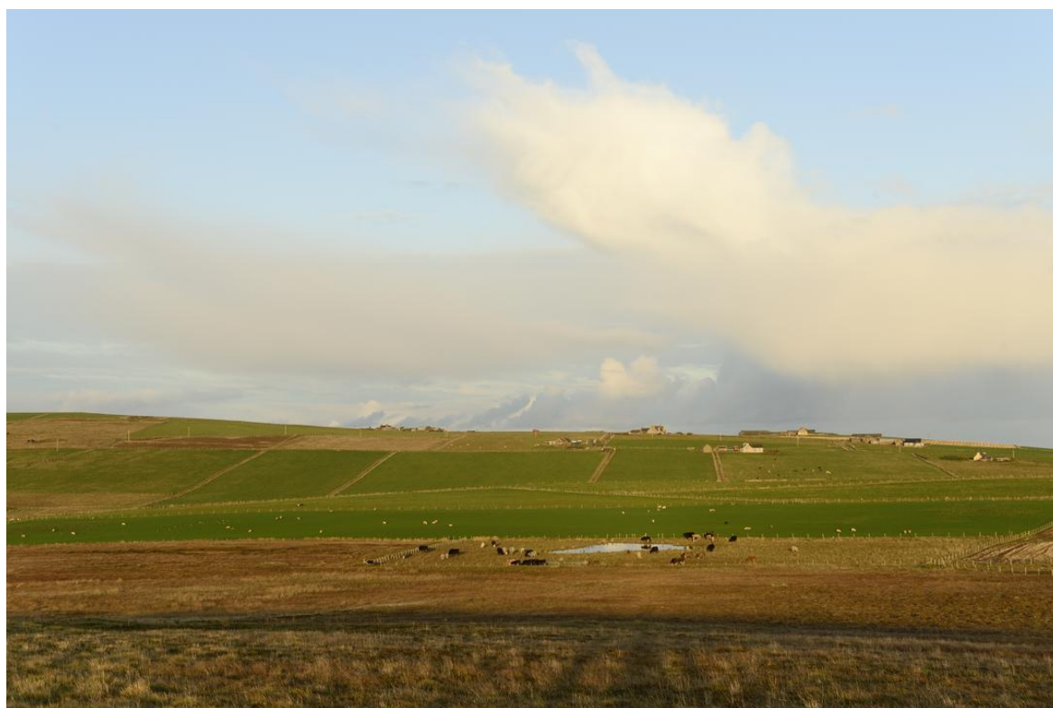
Burwick, South Ronaldsay

grey seals breed on the coasts of the Calf of Eday, Farray and Stronsay.