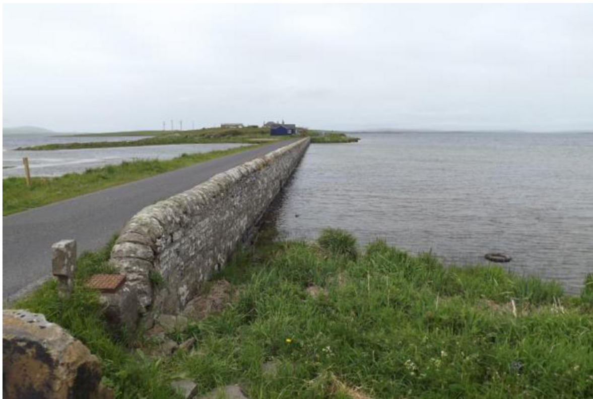
Brig O'Brodgar, Lochs of Harray and Stenness

The central streets in the harbour village are not materially changed since then although there are less whalers and more tourists present than 200 years ago.