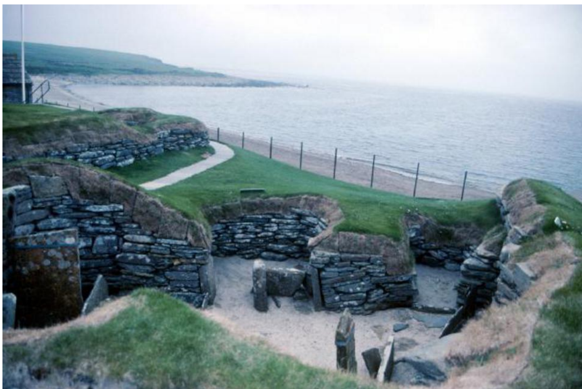
Skara Brae