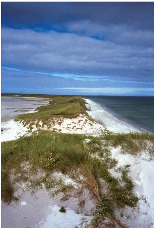
The Newark dunes (tombolo) on Sanday

The tidal nature of the main lochs of Harray and Stenness provides an outlet for excess water during periods of heavy rain. Elsewhere on the islands small burns and ditches carry runoff to the sea down coastal inclines, into small bays or through coastal basins. In Hoy the discharge of water is more dramatic, particularly where streams terminate as waterfalls down the high cliffs of the north and west coasts of the island.