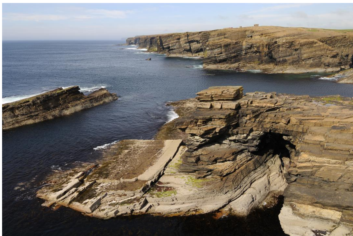
Sea cliffs at Yesnaby, Orkney Mainland

A stretch of cliffs on the west coast of Mainland Orkney is designated a Special Area of Conservation (SAC) as an example of extremely exposed cliffs in the north of Scotland. The combination of high, hard, acidic rock cliffs and exposure to wind and salt spray results in one of the largest examples of maritime vegetated cliff in Scotland, associated with well-developed cliff-top transitions. Grazed cliff-top maritime grassland supports red fescue, thrift, spring squill and sea plantain. Further inland this grades into maritime heath, rich in species such as Scottish primrose and with an unusual maritime form of crowberry-rich heath present on deep, free-draining mineral soils, and cross-leaved heath on wetter soils.