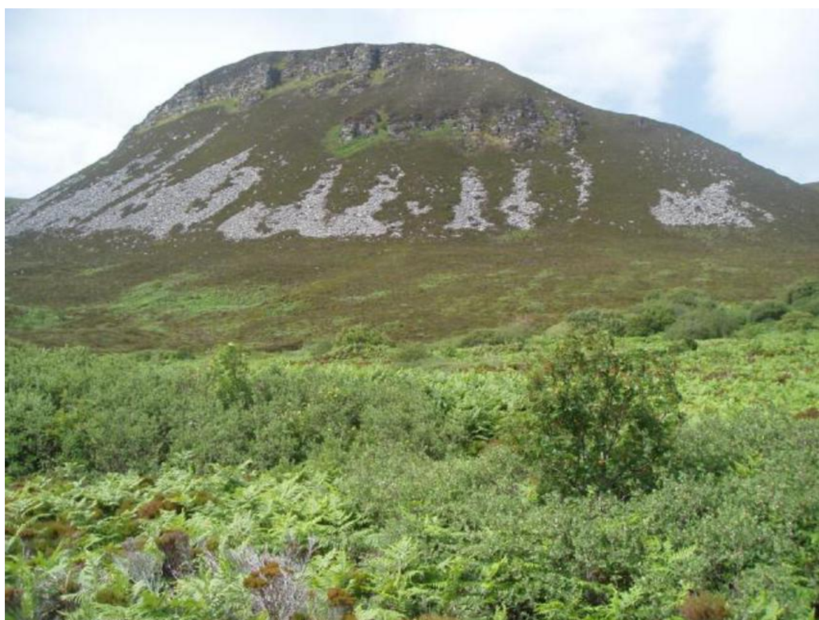
Scrub woodland at Berriedale, Hoy

Some of the largest planted woodlands in Orkney originated in the 19 th Century and relate to the properties of large estate owners. These woodlands were generally dominated by broadleaves, including sycamore, planted in close proximity to the country house, castle or the home farm. The largest of these woodlands is at Balfour on Shapinsay, where it creates the backdrop for Balfour Castle and provides shelter for the walled garden. Other notable estate woodlands include Berstane, east of Kirkwall; Binscarth, west of Finstown; Trumland House and Westness Farm on Rousay; Melsetter House on Hoy; and Carrick House on Eday. The last is interesting in that it illustrates the experimental use of mixed broadleaves and conifers. A more modern example of designed woodland includes Olav's Wood on South Ronaldsay, established in the 1970's.