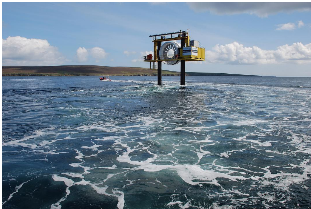
European Marine Energy Centre test rig, Eday Orkney.