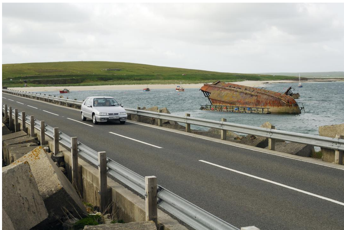
Churchill Barrier No.3 with Shipwreck or Blockship

The largest features from this period are the Churchill Barriers: concrete block causeways that link the South Isles to the Orkney Mainland and close the eastern passages into Scapa Flow. In conjunction with the Barriers, coastal defence structures were built to guard the remaining passages into Scapa Flow. These comprise concrete gun emplacements and grey searchlight towers with projecting flat roofs and slot windows, and they are most visible when approaching the islands by ferry. Air defences were also developed, using flat areas of Orkney Mainland for fighter and bomber aerodromes. Airstrips were developed at Twatt, Skeabrae and on the site of the present Kirkwall Airport. Only the last is still in use: the other sites retain the remains of buildings and air raid bunkers which are largely overgrown.