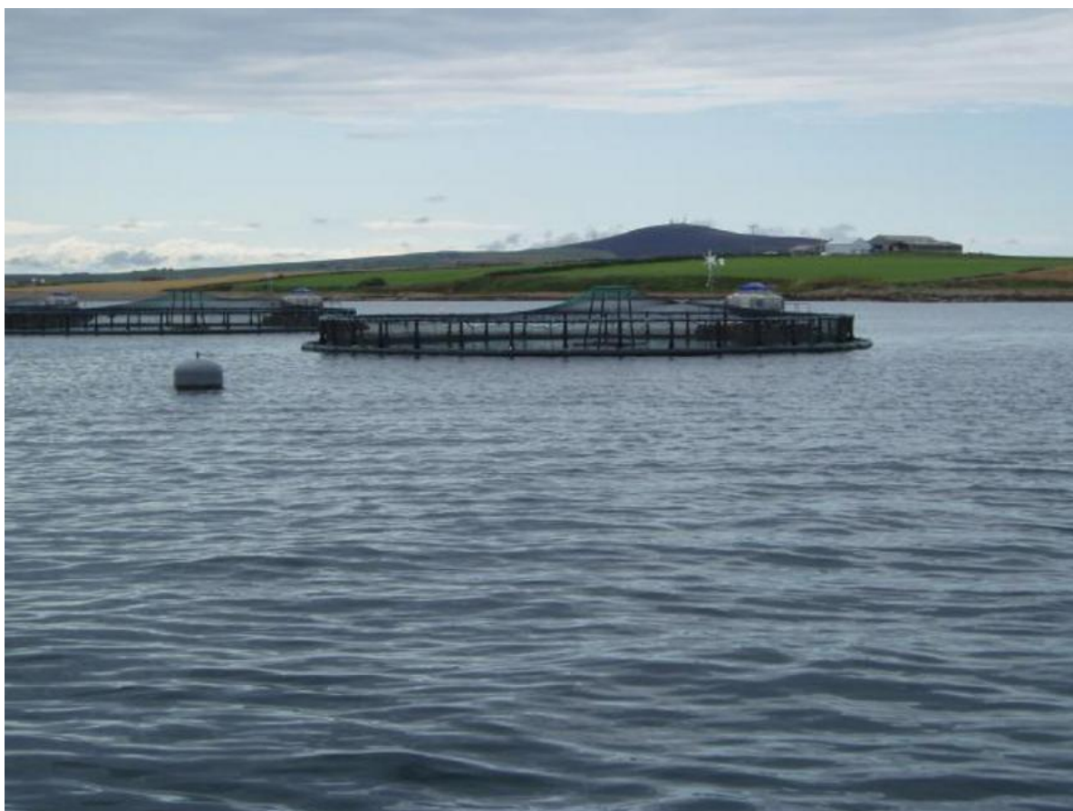
Aquaculture, Rousay