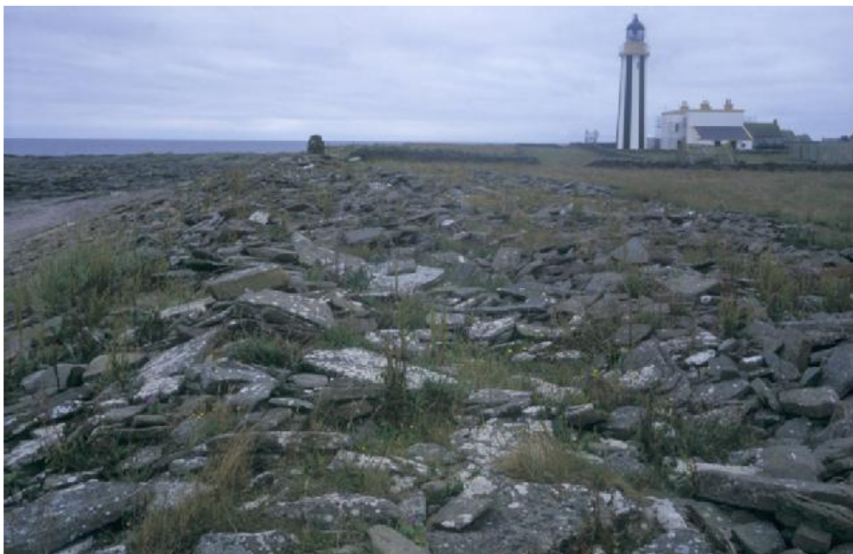
Lighthouse, Start Point

Almost all of Orkney's lighthouses were built by the Stevenson family in the 19 th Century. Two of the earliest lighthouses in Britain were built to prevent ship losses in Orkney's northern waters, and they are still operational: Pentland Skerries (1794) and Start Point (1806) which is painted a distinctive black and white. All the lighthouses are elegant structures and prominent landmarks with their livery of white, or white with black or red stripes. The other notable light houses are at Noup Head, Westray; Dennis Papa Stronsay; the Brough of Birsay; Graemsay; Cantick Head, South Walls; and at Rose Ness, East Orkney Mainland. The last built in Orkney was Tor Ness in 1980. All are still in use marking potentially dangerous promontories and aiding maritime navigation.