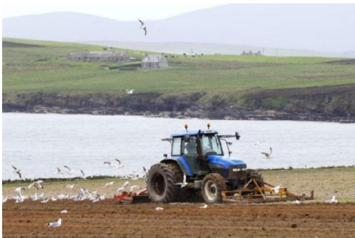
Modern pastoral and arable farming

Since 1940, there has been a gradual shift from arable to pasture fields, and the traditional hay has been largely replaced by silage. Cattle and sheep numbers increased steadily between 1940 and 1960, while horses, pigs and poultry declined. Arable farming continues on a smaller scale with fields of spring barley, oats, seed potatoes and turnips breaking up the dominance of improved grasslands.