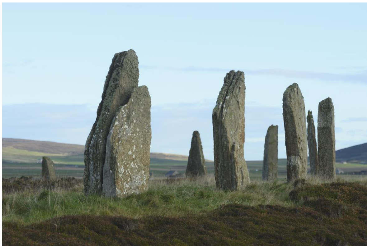
Standing stones at the Ring of Brodgar.

The change from the use of stone to bronze for tools and weapons is not as apparent in Orkney as in other parts of Britain, as very few bronze objects have been recovered which date to this period. However, the differences between the Bronze Age and the Neolithic are stark.