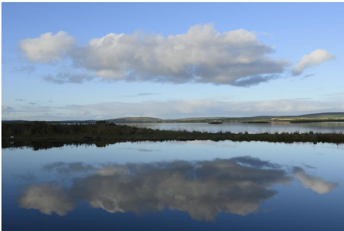
Loch of Harray, Orkney

nevertheless, important features particularly as sources of fresh water and for wildlife. A common characteristic is their absence of marginal scrub vegetation which emphasises the flooded appearance of the landscape. Many of the island lochs are close to the coast in low ground behind bays or formed as 'ouses' (small enclosed lochs), trapped behind sand or shingle bars locally known as 'ayres'. Hoy and Rousay are distinguished by their higher inland water bodies cradled within heathy valleys and on peat covered plateaux.