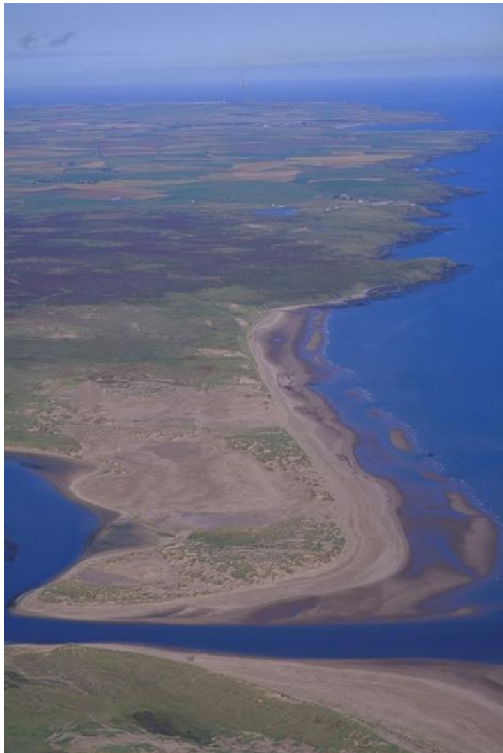
Aerial shot of Forvie NNR looking north

Forvie is a triangular area of extensive and complex dune systems, with three distinct parts. At the north end of the reserve the sand has been deposited on top of a high rock plateau, with varying depths of glacial deposits sandwiched between the rock and the sand. Along the Forvie peninsula, the sand rests on raised beach terraces and buried ridges of glacial origin. At the most southern tip of the reserve, where the River Ythan meets the North Sea, there is a dynamic spit and bar formation. Today natural processes including winds, waves and tides continue to shape the dunes.