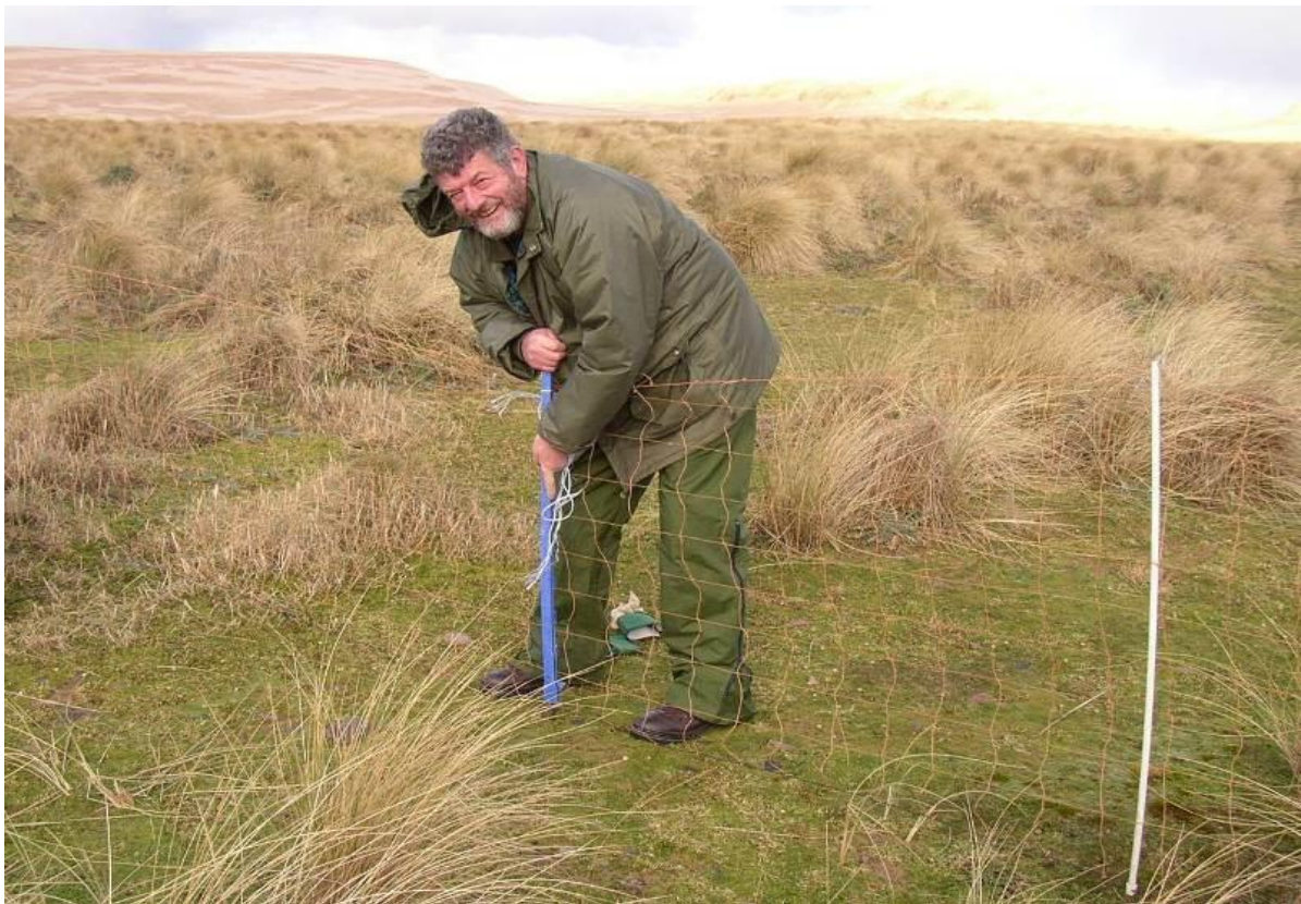
Erecting an electric fence to protect nesting terns

In the early years we introduced some innovative management practices, many are still used today. Tern nesting areas were marked off for the first time in 1961 to reduce disturbance by restricting public access. In 1974 we used electric fencing to try to restrict foxes moving into the southern part of the dunes favoured by ground nesting birds. Each year we erect temporary fencing to protect the terns during the breeding season. The fence prevents people, dogs and predators such as foxes and otters from entering the tern nesting area. Dogs can eat the eggs or scare away the adult birds exposing eggs and chicks to predators like gulls and crows, or death from the cold. Notices explain the reason for the fence and request people to keep out.