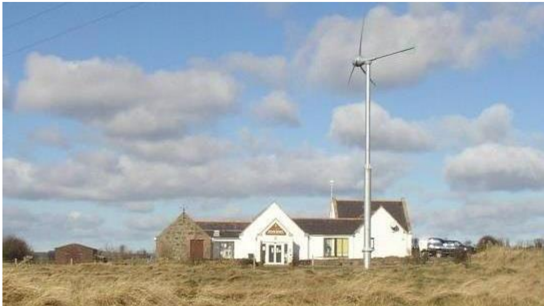
Forvie Centre and wind turbine

The 2006-13 plan continued with 12 objectives, set out around the policy for NNRs, they related to heritage, people and property management. The general direction of heritage management continued to focus on keeping the coastal features, breeding and wintering birds in good condition and protecting the biodiversity of the reserve. The people-related objectives focused on creating a high quality visitor experience, compatible with the wildlife interest of the reserve, for tourists, education users and the local community. Property management was about keeping the site well maintained and increasing the use of renewable energy.