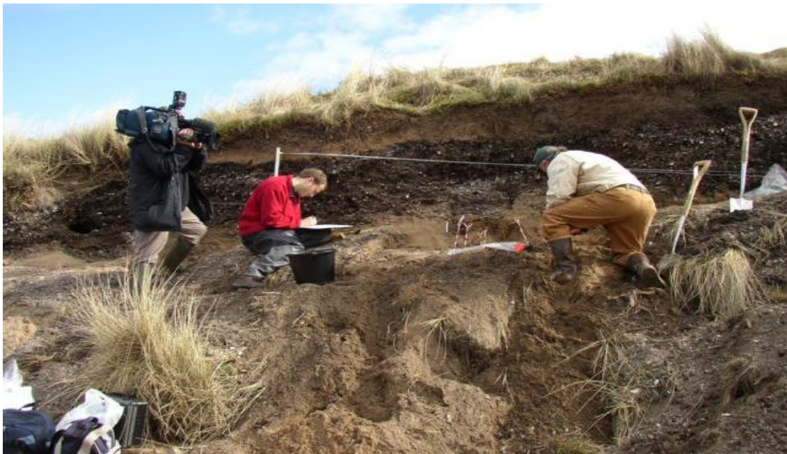
Archaeologists excavating a midden

The cairns, hut circles and Forvie church and deserted ancient village are all Scheduled Monuments. The church, dedicated to St Adamnan, is first mentioned in the 13th-century records of the Chartulary of Arbroath. Excavations date the church to the 12th-century but burials inside the church suggest that it had become ruinous by the 15th-century. Sometime in the 15th-century, the area was smothered in sand, possibly in August 1413, when legend has it that a nine-day storm moved huge quantities of sand. Excavations in 1953 near the church revealed the foundations of medieval square huts, built of roughly shaped stones and red clay. Further excavations in 1955 revealed a paved floor and yielded 13th/14th-century pottery. The font from the church is on loan from the Church of Scotland and can be seen at the Forvie Visitor Centre. For the next 400 years, the historical record shows a gradual population decline in Forvie parish and various records and of sand blowing over agricultural land.