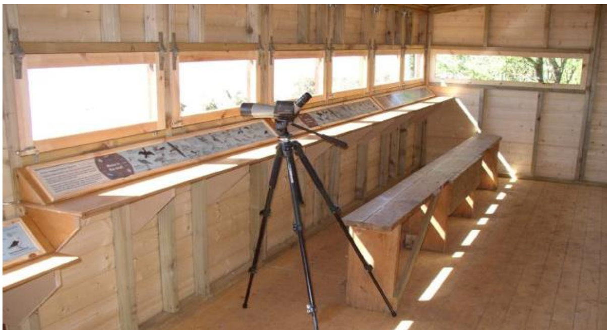
Waulkmill wildlife viewing hide

In 2008 we upgraded the path from the visitor centre to Sand Loch to ensure it is suitable for wheelchairs and buggies and installed seating looking over the loch. In 2010/11 we replaced the hide at Waulkmill providing a viewing point on the upper section of the estuary. Interpretive panels providing an introduction to the reserve and images with identification of the main bird species were installed below the viewing windows.