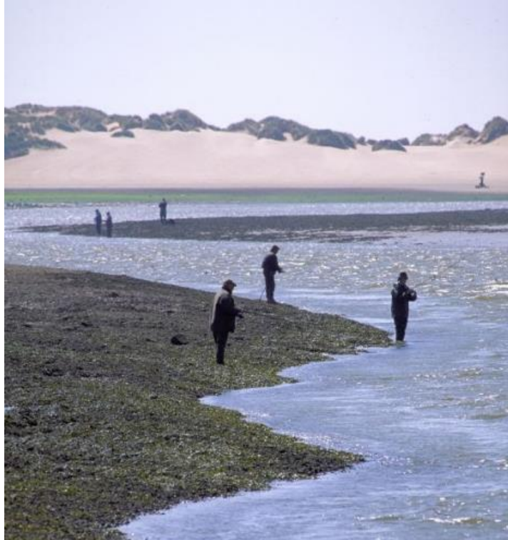
Angling on the Ythan Estuary

Shellfish harvesting – in the past mussels were collected commercially from the estuary, but this ceased in the 1960's. The right to collect winkles, for personal use, from the foreshore still exists although it is seldom seen at Forvie. Bait digging for worms takes place by private individuals for sea fishing but cockles are few and rarely removed.