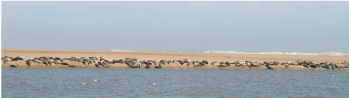
Seals hauled out beside Ythan Estuary

Mammals – mammals typical of this part of northeast Scotland are found on Forvie, including roe deer, foxes, badgers and stoats. Water voles have been recorded in burns adjacent to the reserve. The more unusual species include a healthy population of otters on the River Ythan and the grey and common seals that haul out at the mouth of the estuary. Offshore there are regular sightings of bottlenose dolphins.