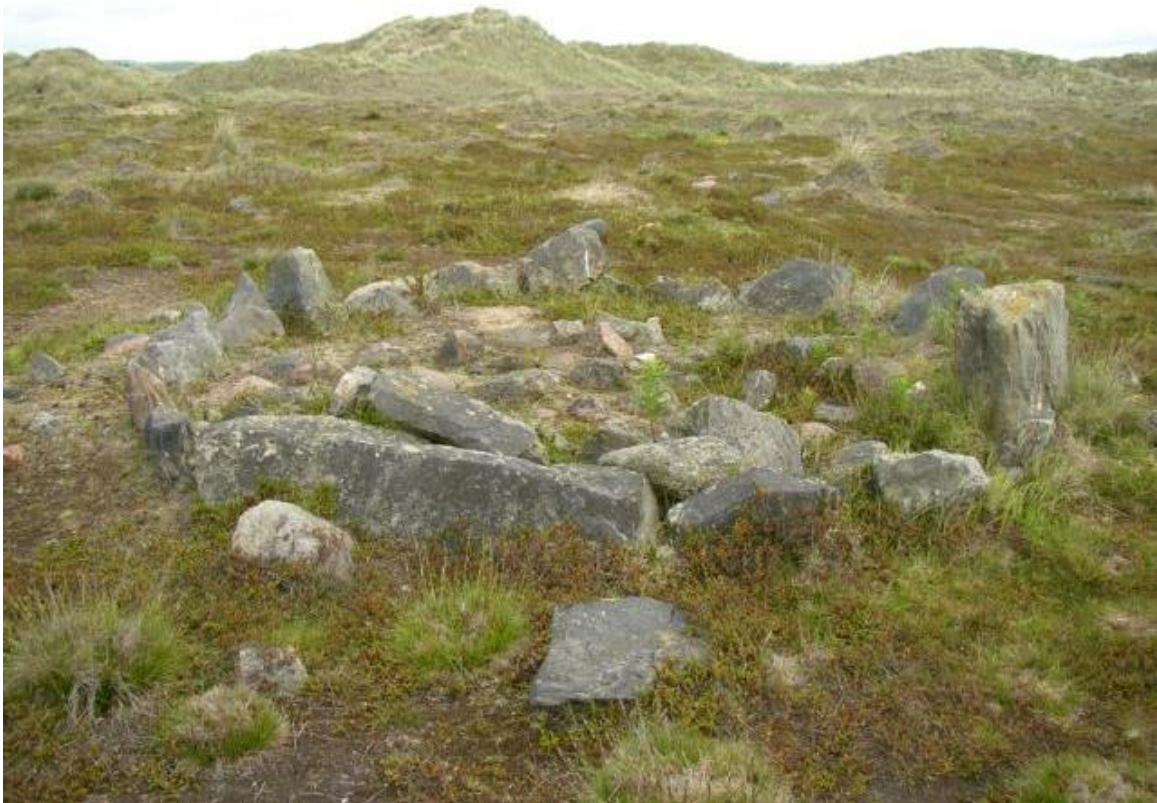
Kerb cairn at Forvie NNR

The first farmers appeared in Britain around 4,000 BC, marking the beginning of the Neolithic (new stone age) period. At this time people began to bury their dead in cairns, leaving behind traces such as the small circular foundations which at Forvie, are now mostly buried by sand. During the Bronze Age, about 3,000 BC, kerb cairns were built to hold cremation sites.