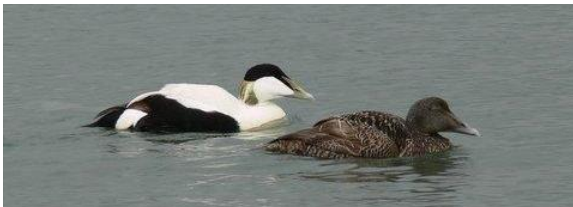
Eider duck on Ythan Estuary

Eider colony – The eider colony at Forvie is one of the largest in Britain. Between 1991 and 1995 there were around 4,000–5,000 birds, with some 1,500 breeding pairs at Forvie. More recently, the breeding population has halved with no more than 800 pairs counted in spring. In winter some birds remain while the rest of the population over winters further south on the Tay Estuary. The breeding success of the colony has been mixed. In 1971 and 1976 as many as 1,200 fledglings were counted on the estuary, but in more recent years breeding has been less successful.