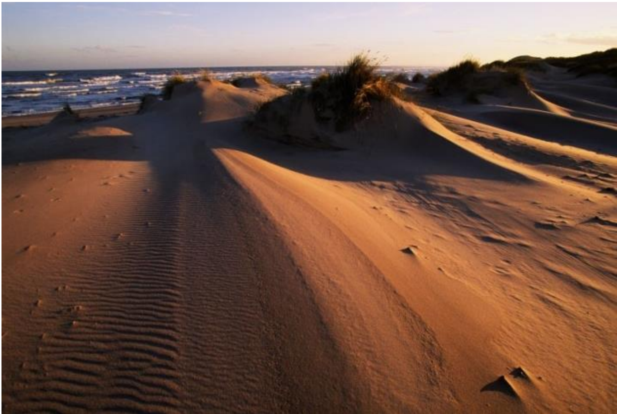
Looking across mobile dunes towards the North Sea.

Among the dunes are wet areas known as dune slacks. Slacks are low-lying areas between dune ridges that are seasonally flooded. They are mainly found in the larger dune systems in the UK, especially in the west and north, where the wetter climate favours their development, and are less common in the warmer and drier dune systems of continental Europe. In the wet slacks at Forvie, plants like common sedge and marsh pennywort are usually found, while damp slacks have crowberry, cross-leaved heath and occasional creeping willow. In the north of the reserve, the vegetation on the oldest, most stable dunes has developed into dune heath. Here there is an extensive area dominated by heather, although crowberry remains abundant along with heath mosses and lichens.