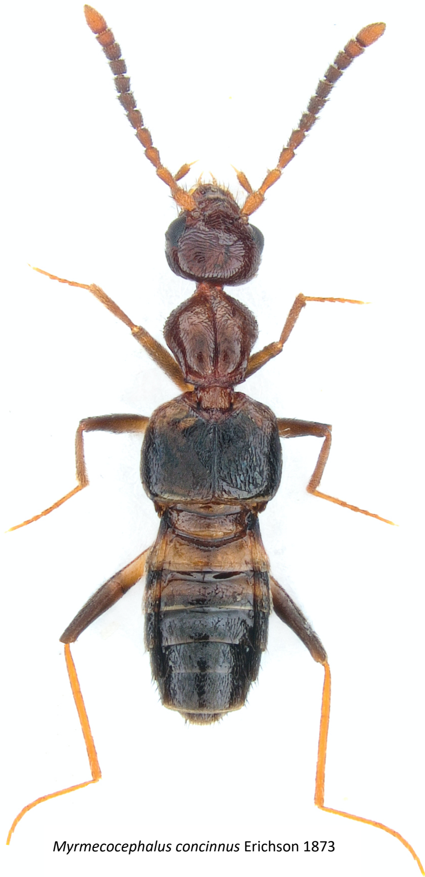
Myrmecocephalus concinnus Erichson 1873