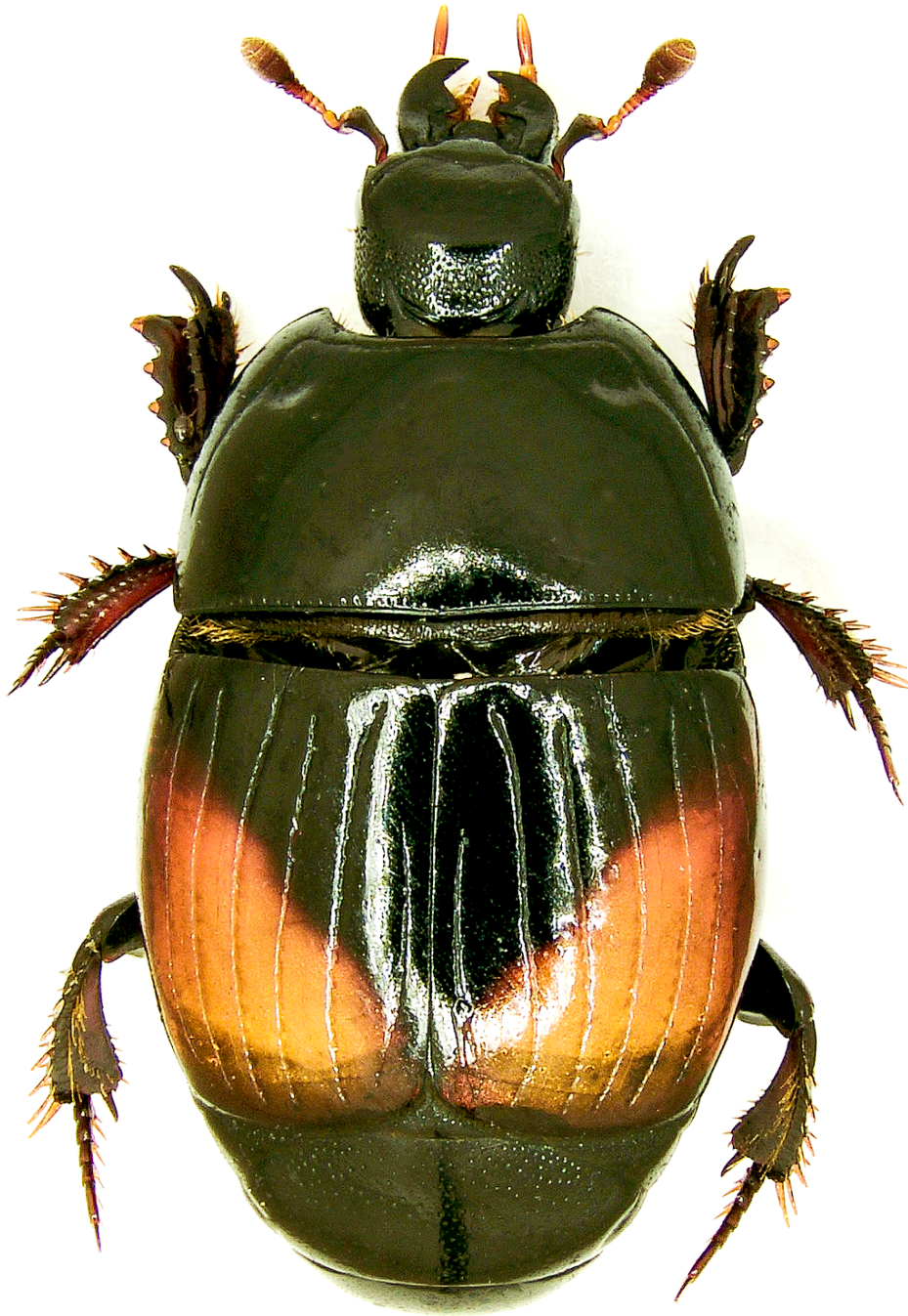
Atholus bimaculatus Lineaus 1758