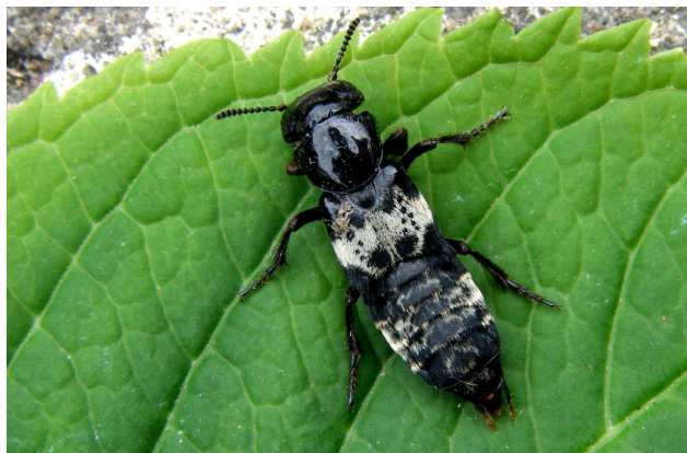
Creophilus maxillosus (Graham Calow)