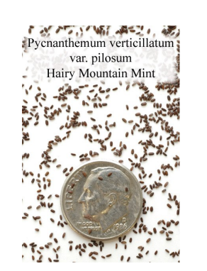
Seed size. Prairie Moon Nursery

Propagation of mountain mint is primarily done by seed and division. It is difficult to propagate stem cuttings as the shoots quickly develop into woody stems. However the emerging herbaceous stems can be propagated as cuttings. (Peter Borchard, Companion Plants, personal communication, February, 2015). Mountain mint is easily divided in late spring into summer and the divisions can be quite small and still survive. It can self-seed in the garden, but seedlings are easily identified by their fragrance and can be removed if they are overabundant or in the wrong place.