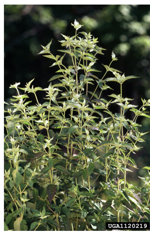
Pycnanthemum incanum, hoary mountainmint.

The essential oil content of Pycnanthemum varies by species and ranges from the pleasant floral and mint to pulegone, the