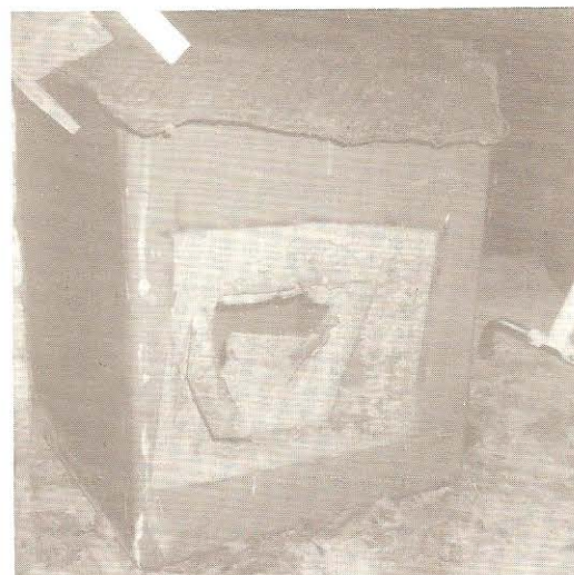
The fated safe