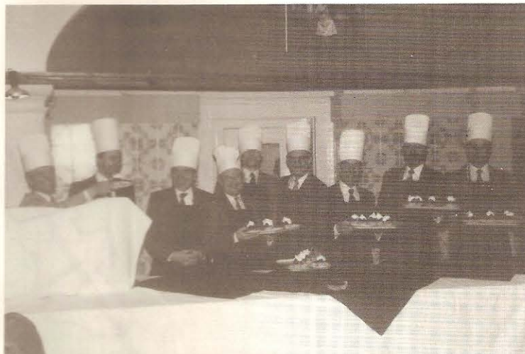
What year was this FED convention, at Blenheim Palace? And what are all the chefs about?