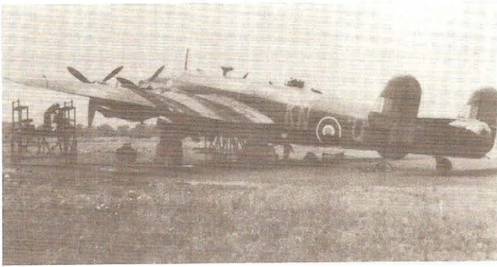
A Halifax of No. 77 squadron being serviced at Elvington. The part played by the Halifax squadrons has often been ignored, the aircraft living in the shadow of the Lancaster.