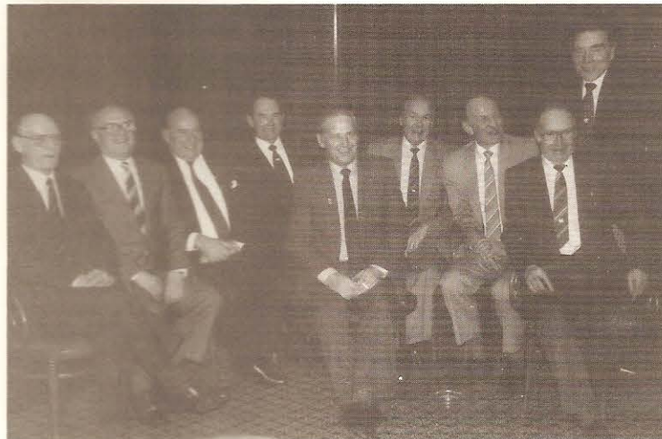
Location and date please, of this FED convention