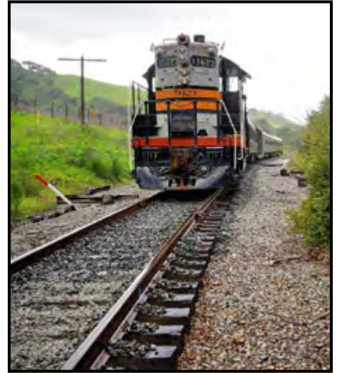
SP 5623 heading East toward Pleasanton.