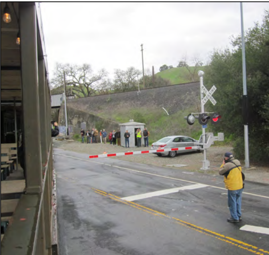
Verona special train crossing Pleasanton-Sunol Road.