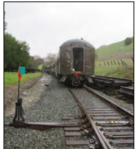
Special train just East of the Verona switch.