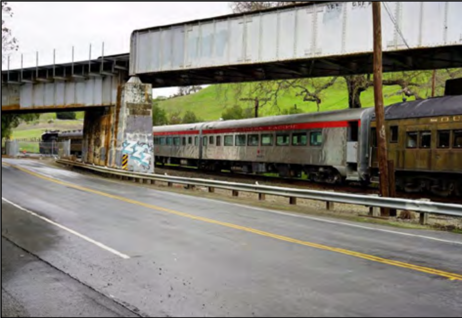
Verona Extra under UP's bridge.