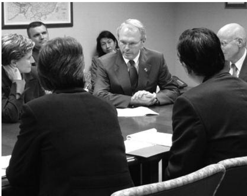
A discussion with Assistant Secretary of State Christopher Hill and Director of Policy Planning Stephen Krasner

The first meeting of the National Committee's Public Intellectuals Program (PIP) Fellows was held in Washington, D.C., September 22-27.