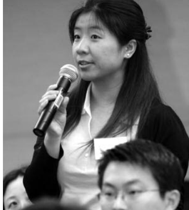
A participant asks a question following the keynote address by Ambassador Sasser at the opening night of FPC 2005.

“I hope as a result of the colloquium not only the students get ideas/knowledge about U.S. foreign policy through listening to the lectures/speeches from U.S. officials and scholars alike but the latter can listen attentively to what Chinese students who are the future elite of China and will shape China’s foreign policy in a big way think of America.”