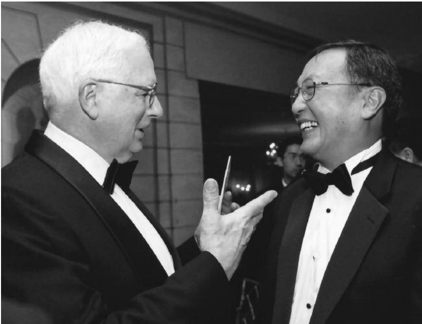
Former Ambassador to China J. Stapleton Roy congratulates honoree Liu Chuanzhi, chairman of Legend Holdings Limited and founder of Lenovo.

Four leaders in the fields of communications, finance and education were recognized for their outstanding contributions to U.S.-China relations at the National Committee's Gala Dinner, held on September 21 in New York City. Five hundred and fifty guests were on hand to honor Karen Elliott House, publisher of The Wall Street Journal and senior vice president of Dow Jones & Co., Inc; Liu Chuanzhi, chairman of Legend Holdings Limited and founder of Lenovo; Frederick W. Smith, chairman, president and chief executive officer of FedEx Corporation; and John L. Thornton, director of the Global Leadership Program at Tsinghua University and former president and co-chief operating officer of Goldman Sachs.