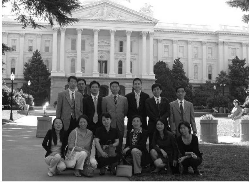
The delegation of Chinese labor contract law drafters, after a meeting with the California State Senate Labor Committee in Sacramento.

Under a contract from the U. S. Department of Labor, the National Committee and its two consortium partners – The Asia Foundation and Worldwide Strategies, Inc. – are working with the Ministry of Labor and Social Security (MOLSS) on a multi-year effort to assist the Chinese government in its efforts to strengthen protection of workers' rights and to comply with internationally recognized labor standards. Now into the second year of the program, the Committee's most recent efforts have focused on labor contract legislation. This article describes several of these activities.