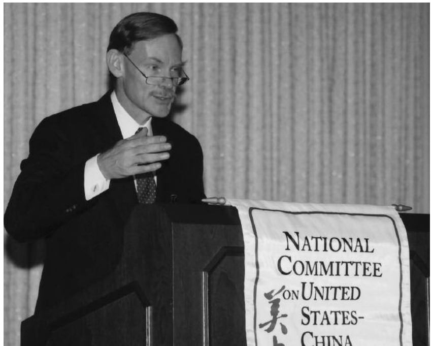
Deputy Secretary of State Robert B. Zoellick gives a major foreign policy address in which he laid out the Bush Administration's views on engaging China as a stakeholder in the international system.

From China's perspective, it would seem that its national interest would be much better served by working with us to shape the future international system.