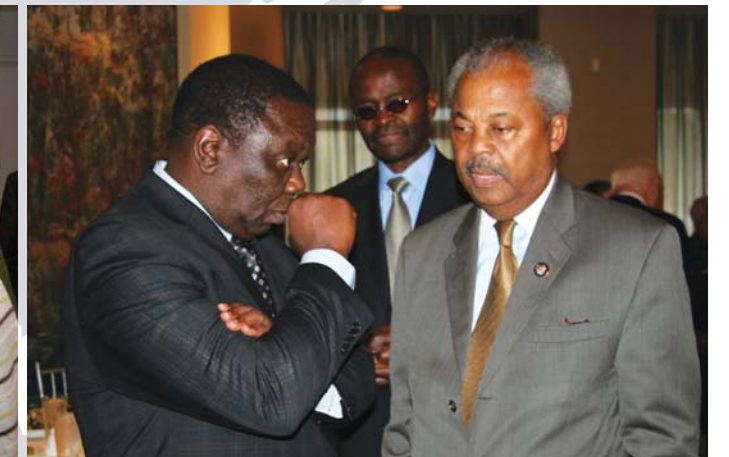
Zimbabwe Prime Minister Morgan Tsvangirai and Congressman Donald Payne

Good governance and political accountability are in the interest of everyone, including the private sector. NDI can help corporations develop a greater understanding of global political challenges and provide an opportunity to join the discussion on how the private sector can contribute to advancing democracy and human rights around the globe.