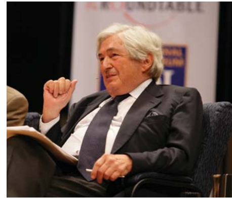
Thomas Daschle and James Wolfensohn at NDI's 2008 International Leaders Forum during the Democratic National Convention in Denver