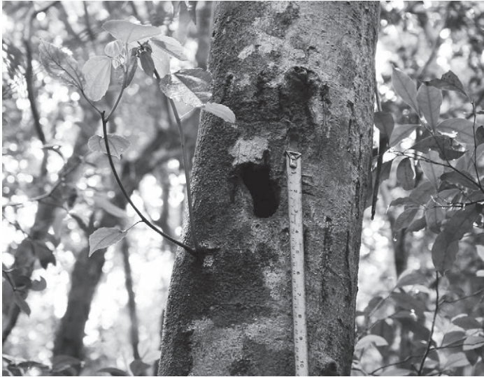
Figure 1. Nest of Blue-bellied Parrot Triclaria malachitacea in the trunk of a live Alchornea triplinervia tree, Serra Furada State Park, Santa Catarina, Brazil (Karoline Ceron)