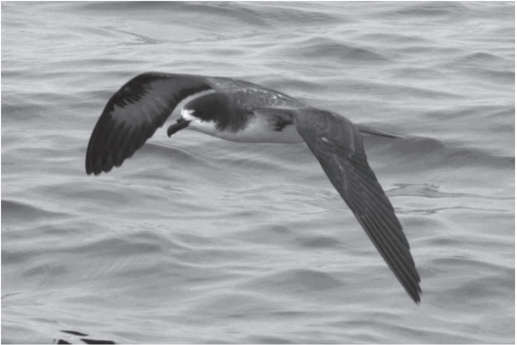
Threatened by introduced pests and trampers, the Galapagos Petrel Pterodroma phaeopygia wanders to continental Ecuadorian waters during the non-breeding season