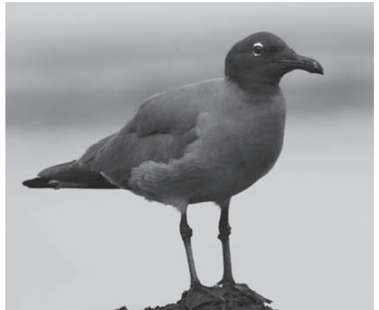
Right: The population of Lava Gull Leucophaeus fuliginosus is estimated at <800 pairs; the Vulnerable category probably under-estimates its true status

and Masked Mountain Tanager Buthraupis wetmorei (Vulnerable) will be waiting for you!