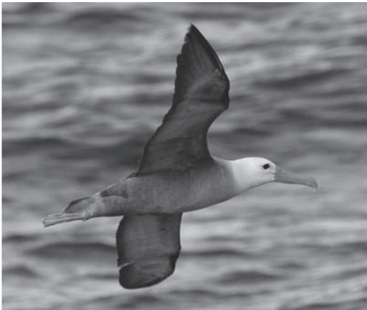
Left: Although all of its breeding colonies are protected, the main threat to Waved Albatross Phoebastria irrorata is at sea: long-line fishing