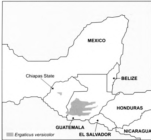
Figure 1. The northern Central American distribution of Ergaticus versicolor .

and only occasionally working above 7 m, but we observed males singing and foraging at the tops of 15 m trees on several occasions during March and April. At Huitepec, males with attendant females were easily observed from late February; at this time the birds appeared in second-growth on forest edge, and even foraged and sang conspicuously as much as 80 m from the cloud forest edge in patches of advanced second-growth in open, overgrown fields. By late March, however, the females became very secretive, and males became equally difficult to locate by mid-April. This cryptic behaviour in breeding birds at Huitepec was perhaps due to very low population densities, as it was not apparent in birds observed at Volcán Tacaná during a visit in June 1995 nor during a study in western Guatemala 9,10 .