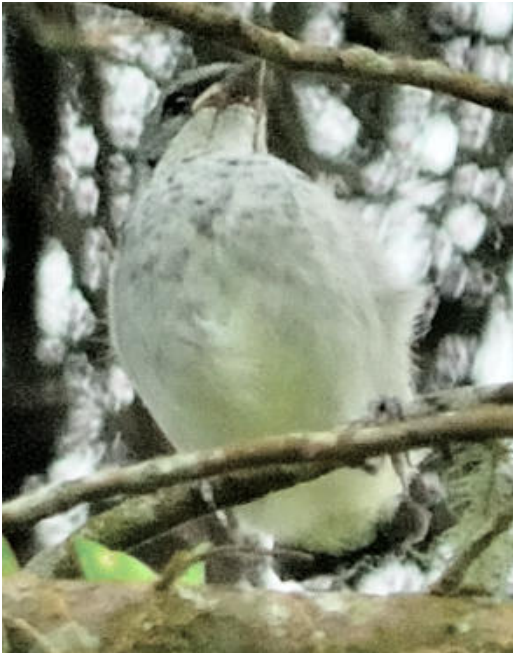
Figure 3. Fully-grown juvenile Azure-rumped Tanager Tangara cabinisi , Loma Linda, Guatemala, 29 October 2009 (K. Eisermann)

Figure 2. Fledgling Azure-rumped Tanager Tangara cabinisi from nest 2, Los Tarrales Reserve, Guatemala, 17 August 2008 (K. Eisermann)