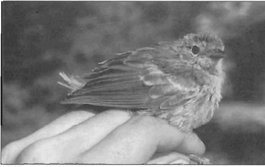
Figure 1. Fledgling Slender-billed Finch Xenospingus concolor , Ocucaje, Peru. (Oscar González)