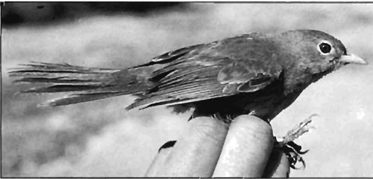
Figure 2. Slender-billed Finch Xenospingus concolor , first juvenile plumage, Tacna, Peru. (Tor Egil Høegsaas)