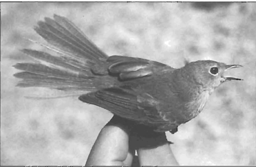
Figure 3. Slender-billed Finch Xenospingus concolor , second juvenile plumage, Tacna, Peru.