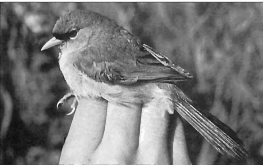
Figure 4. Adult Slender-billed Finch Xenospingus concolor , Tacna, Peru.

chin is almost grey. Wings have some grey and no wingbars are present. The bill is yellow, but on some individuals it has a dark tip; the legs are dark. The white orbital ring is normally less obvious than in younger birds with browner heads and brown irides.