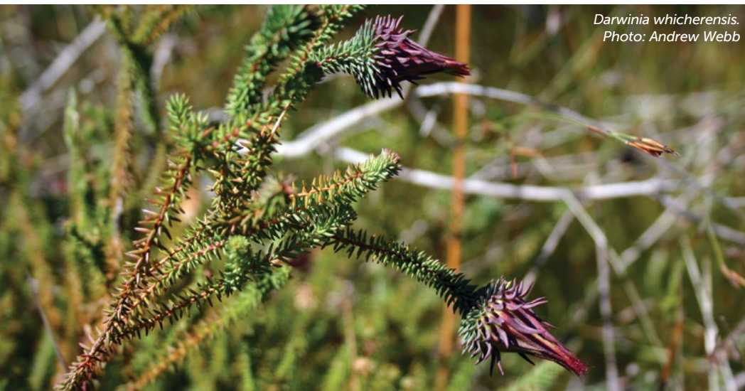
Darwinia whicherensis .