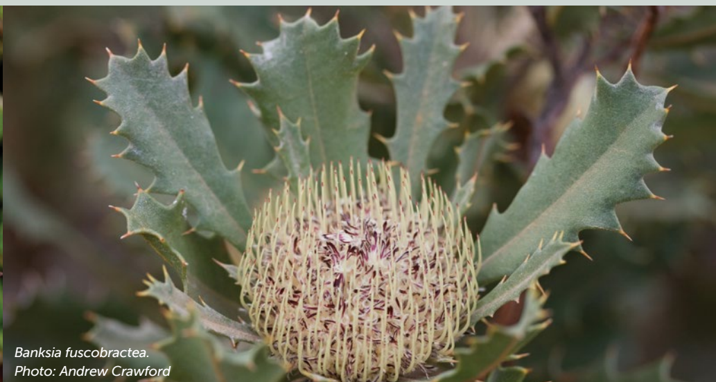
Banksia fuscobractea .