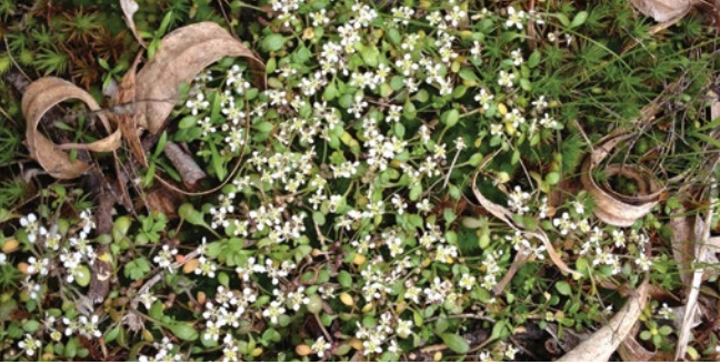
Ballantinia antipoda .