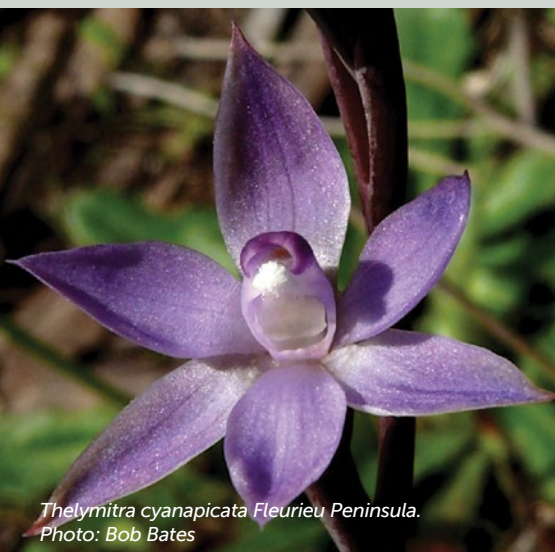
Thelymitra cyanapicata Fleurieu Peninsula.

Many poorly known species are also at risk, but a lack of information impedes conservation assessments and action. The National Action Plan will also identify a priority 'Amber' list of poorly known species considered at risk of extinction as well as the actions needed to determine their conservation status.