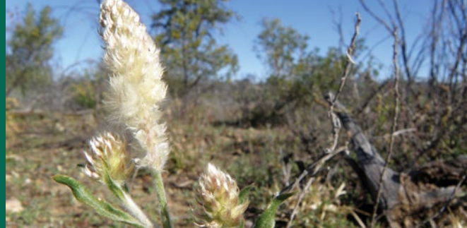
Ptilotus brachyanthus .