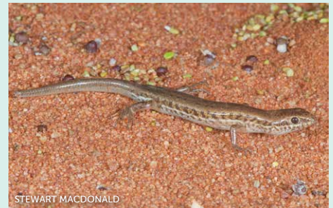
Ornate soil-crevice skink (Notoscincus ornatus) Big eyes, and coppery brown colour. Black side-stripe and sometimes dots on the back.