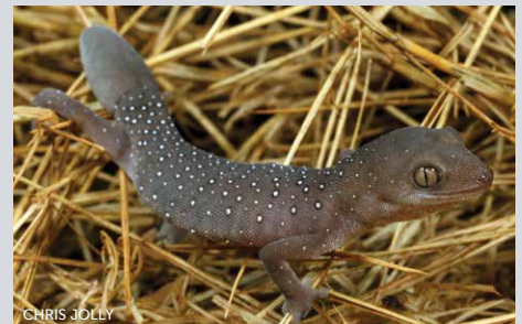
Jewelled gecko ( Strophurus elderi ) Brown or grey with tiny white spots which have a black border. Has a short, swollen tail.