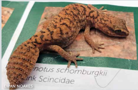
Desert fat-tailed gecko ( Diplodactylus laevis ) Fat tail and skinny fingers and toes with no toe pads.

Do not have eyelids, have long toes and padded fingers, soft skin.