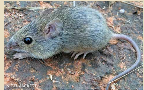
Sandy inland mouse ( Pseudomys hermannsburgensis ) Brown to grey-brown fur with white belly and cheeks. Looks very similar to the delicate mouse.