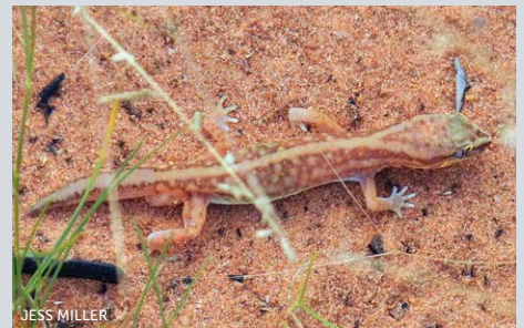
Sand-plain gecko ( Lucasium stenodactylus ) Pinkish to reddish-brown with white spots or a white stripe which branches to form a Y shape near the head. Colour and pattern can vary. No toe pads.