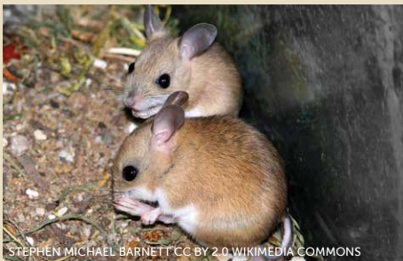
Spinifex hopping mouse ( Notomys alexis ) Big mouse with big ears and eyes. Hops on back legs. Very long tail with hairy tuft on the end.