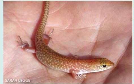
Mosaic desert skink (Eremiascincus musivus) Pale yellowish to orange-brown with a pale stripe running down the centre of the back from head to tail and spots all over the body forming a net-like pattern.