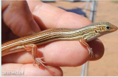
Fourteen-lined skink (Ctenotus quattuordecimlineatus) Reddish brown with 14 black or whitish stripes running down the back and tail.