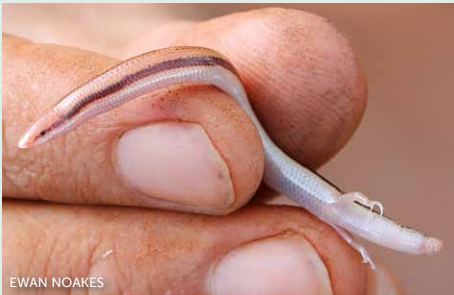
North-western sandslider (Lerista bipes) Pointed head. No front legs, back legs have 2 toes each.