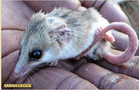
Lesser hairy-footed dunnart ( Sminthopsis youngsoni ) Small with a pointed nose, big black eyes, big ears, sharp teeth and broad, hairy feet. Brownish-yellow in colour above and white below. Base of tail is swollen.