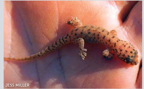
Robust termitaria gecko ( Gehyra kimberleyi ) Pale to dark brown in colour with alternating rows of dark and light spots. Has toe pads for climbing.*