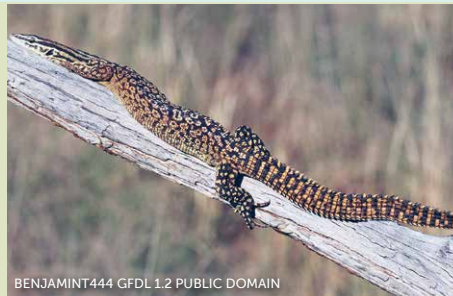
BENJAMINT444 GFDL 1.2 PUBLIC DOMAIN