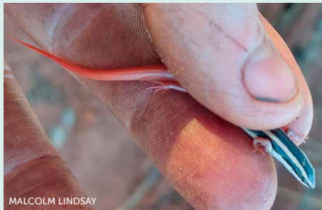
Lined fire-tailed skink (Morethia ruficauda) Five fingers and 5 toes. Black and white stripes down the side of the body. Tail is red.