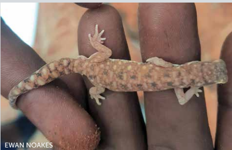
Western beaked gecko ( Rhynchoedura ornata ) Reddish brown with pale spots which have dark edges. Have dark markings or stripes on the back. Colour and pattern can vary. No toe pads.