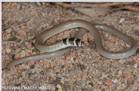
Rusty-topped delma ( Delma borea ) Brown to grey in colour with 3-4 black bands on the head which extend down on either side to the throat.*

No front legs, small flaps where the back legs would normally be, thick tongue (snakes have a thin, forked tongue) and obvious ear holes. Sometimes have re-grown tail, which a snake never has.