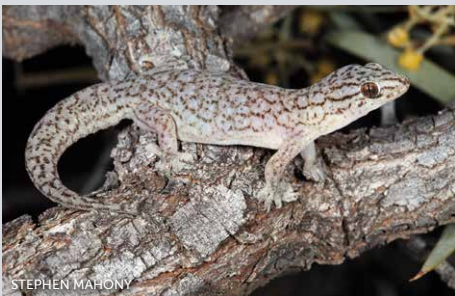
Purple dtella ( Gehyra purpureascens ): Pale purplish grey in colour with dark grey or brownish-grey spots or streaks which form a net-like pattern across the body. Toe pads for climbing.*