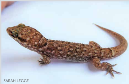
Bynoe's gecko ( Heteronotia binoei ) Covered with scales which look prickly but are soft when you touch them. Colour and pattern can vary greatly. No toe pads.