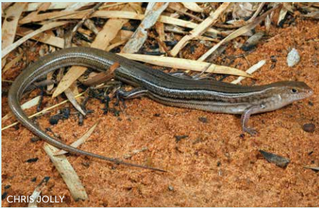
Rock ctenotus (Ctenotus saxatilis) Olive-brown to reddish-brown in colour with a white-bordered dark stripe running down the centre of the back.*