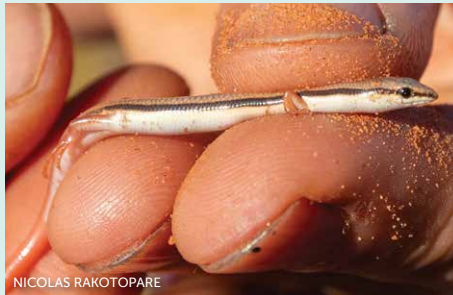
Dampierland slider (Lerista separanda) Has a dark stripe along the sides of the body. Orange tail. Has four legs with 4 fingers/toes each.