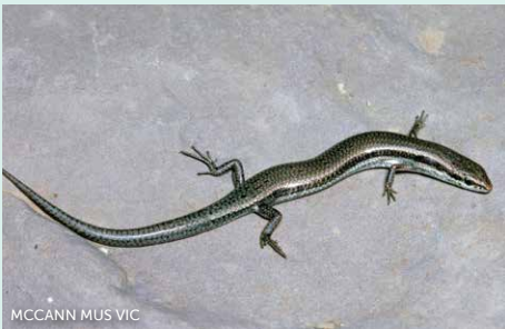
Common dwarf skink (Morethia greyii) Very small, has 4 fingers and 5 toes. Brownish grey to grey in colour with dark dashes on the back and a dark stripe running across either flank.