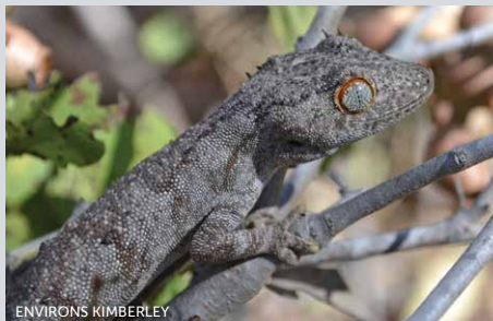
Northern spiny-tailed gecko ( Strophurus ciliaris ) Has long spines along the top of the tail and above the eye. Colour light to dark grey. Toe pads for climbing.