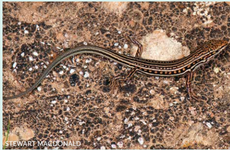
Barred wedgesnout ctenotus (Ctenotus schomburgkii) Olive to orange-brown with black stripes running down the centre of the back and two white stripes on either side. Has pale spots/ blotches on the flanks.*