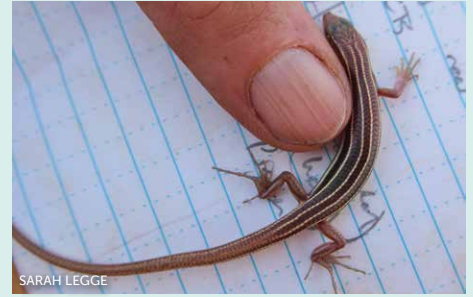
Coarse sands ctenotus (Ctenotus piankai) Reddish brown with 6-8 pale narrow stripes running down the back.*