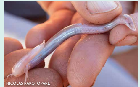
Slender worm-slider (Lerista vermicularis) Sand dunes. Thin with a flat, pointed nose. Pale yellowish brown to pinkish brown in colour. Has no front legs, back legs have 2 toes each.