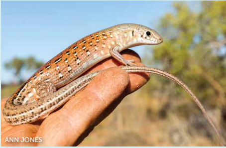
Leopard ctenotus (Ctenotus pantherinus) Copper brown to greenish-brown in colour with dark-bordered white/ pale spots.