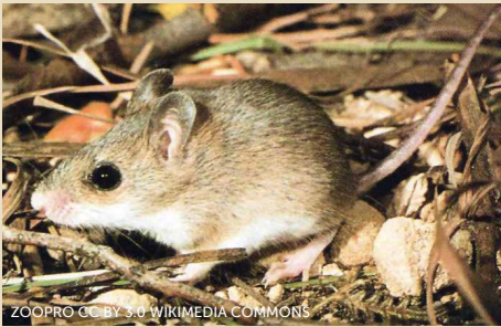
Delicate mouse ( Pseudomys delicatulus ) Smaller than a house mouse, has a long tail. Brown to orange-brown with white belly and cheeks. Nose, feet and tail are pink.