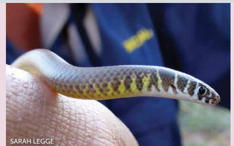
Unbanded delma ( Delma butleri ) Doesn't have strong pattern on top of head, but can have thin whitish bars on side of head. Fine dark edges to body scales.*