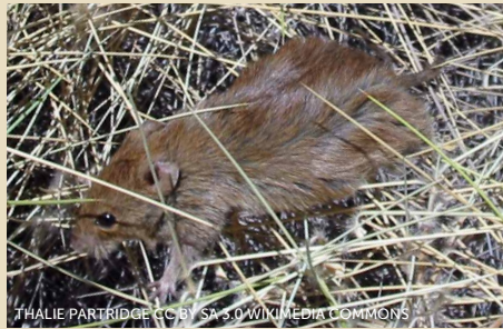
Desert mouse ( Pseudomys desertor ) Brown with light grey/brown belly, scaly tail and big eyes which have an orange ring. Has some long dark hairs which make the mouse seem spiny.