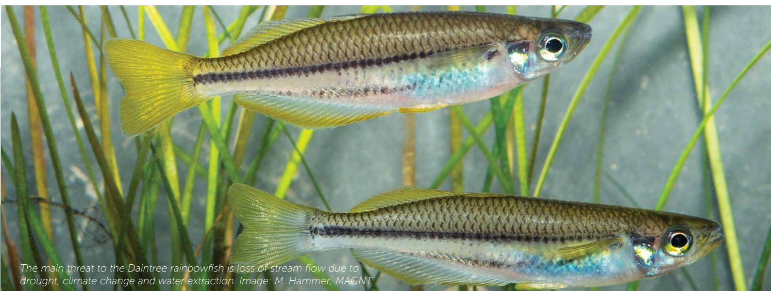
The main threat to the Daintree rainbowfish is loss of stream flow due to drought, climate change and water extraction.

The assessments were undertaken prior to the 2019–20 Black Summer bushfires, which impacted many of the species that were identified as highly imperilled in our assessment. Some species may now be on the brink of imminent extinction.