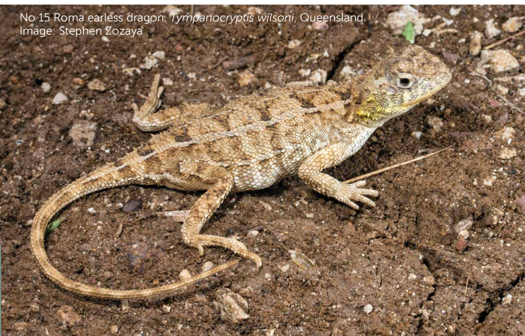
No 15 Roma earless dragon, Tympanocryptis wilsoni , Queensland.

The Australian Government has committed to averting extinctions, and this first requires identification of the species at most immediate risk. This can forewarn governments, conservation managers and the community so that they can implement emergency care and recovery actions to prevent extinctions before it is too late.