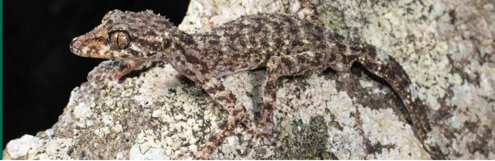
Table 1. The 20 Australian terrestrial snakes and lizards at greatest risk of extinction in Australia, their estimated probabilities of extinction in the wild by 2040, their locations, IUCN Red List conservation status and Environmental Protection and Biodiversity Conservation Act 1999 (EPBC) status – Critically Endangered (CR), Endangered (EN), Vulnerable (VU), unassessed due to recent taxonomic revision or description (N/A) and Not listed.

No 12 Pinnacles leaf-tailed gecko, Phyllurus pinnaclensis , Queensland.