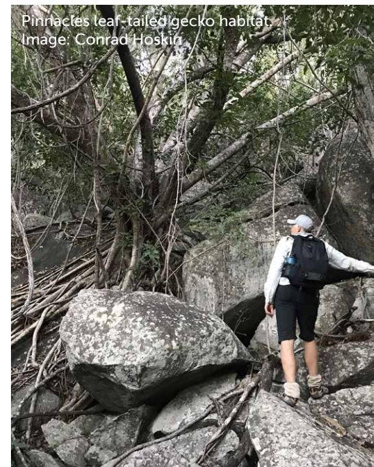
Pinnacles leaf-tailed gecko habitat.