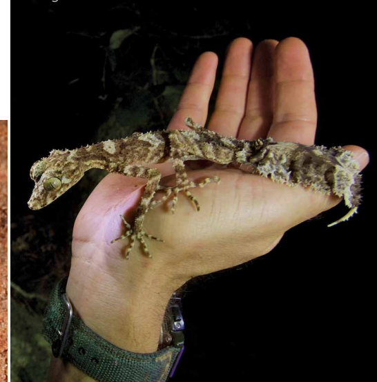
No 9 Cape Melville leaf-tailed gecko Saltuarius eximius , Queensland.