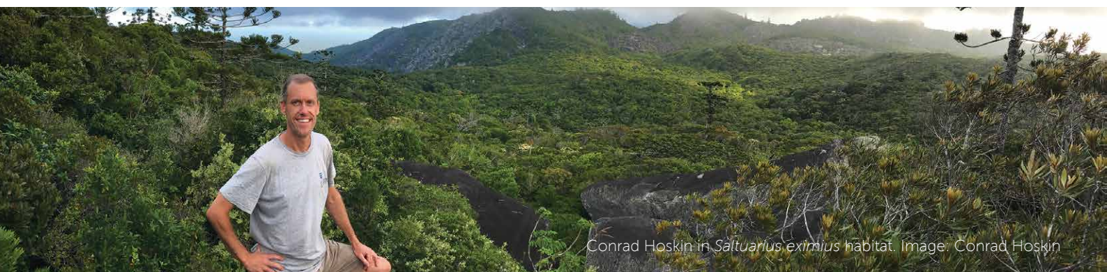
Conrad Hoskin in Saltuarius eximius habitat. Image: Conrad Hoskin

Comparable assessments have also been applied to Australian mammals, birds and freshwater fishes. The number of reptiles identified as being at high risk of extinction within 20 years is lower than for freshwater fishes, but similar to the number for birds and higher than for mammals.