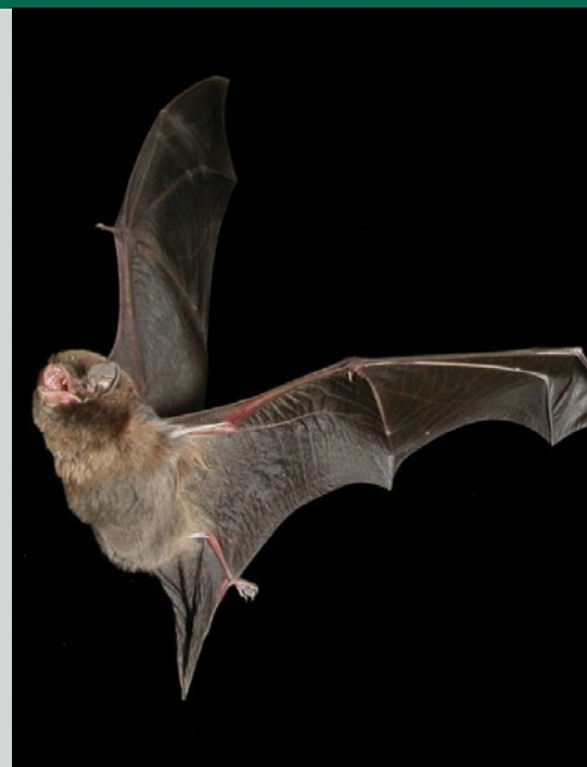
No. 17: Southern bentwing bat

To date, this project has provided estimates of extinction risk for Australian birds and mammals. In general, the information available for threatened species in these groups is more substantial than for threatened species in other groups (such as fish or spiders). However, even for the relatively well-known groups such as birds and mammals, there are significant information gaps – in knowledge of population size and trajectories, the threatening factors that are most imperilling the species, and the effectiveness of management actions that seek to control such threats – that markedly constrain our ability to predict the future for these species. It is difficult to predict the future if we don't know well the past or the present.