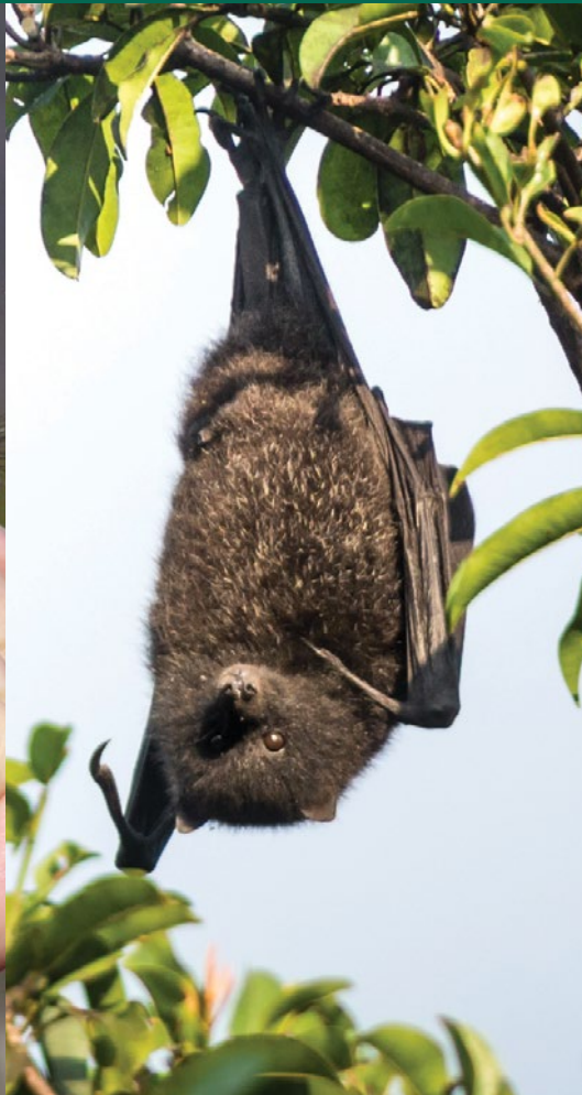
No. 4: Christmas Island flying-fox.