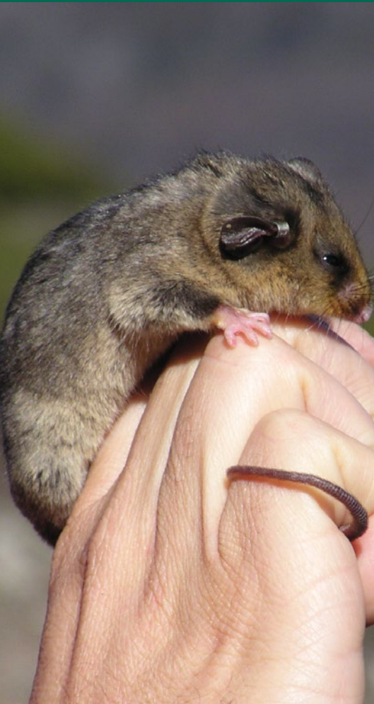
No. 13: Mountain Pygmy Possum