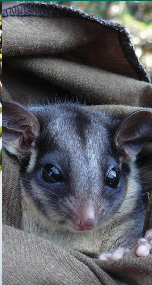
No. 7: Leadbeaters Possum

On average, one to two Australian mammal species have become extinct per decade since the 1850s. Future extinctions are more likely to be avoided if we can identify the mammals at greatest risk.