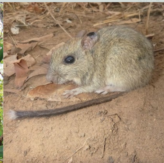
No. 10: Brush tailed Rabbit Rat.