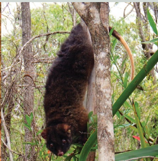
No. 11: Western ringtail possum.