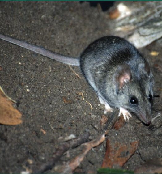
No. 14: Kangaroo Island Dunnart