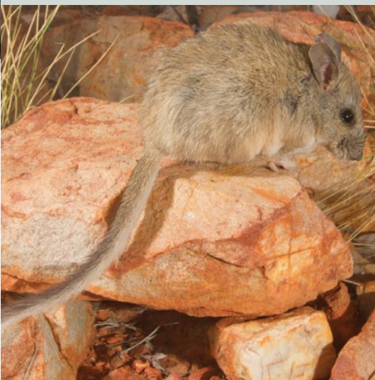
No. 1: Central rock rat.

The mammals at highest risk of extinction are spread widely: several are restricted to islands (reinforcing the conservation need and challenge of island biodiversity), but many of the mammals at highest risk of extinction are from northern Australia, an area currently witnessing a rapid and severe decline in mammal fauna generally.