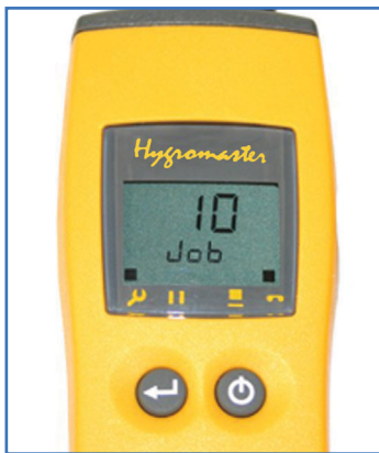
Assign job numbers to data