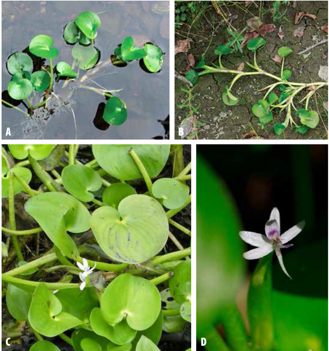
FIG. 4. Heteranthera pauciflora . (A) plant in shallow water, (B) plant on mudflat, (C) leaves and pair of flowers, (D) single open flower extending out of spathe. (A & B from Mercer Co., NJ, Sep 2014 by B. Cunningham; C from Monmouth Co., NJ, Oct 2010 by B. Keim; D from Mercer Co., NJ, Aug 2017, by B. Cunningham).