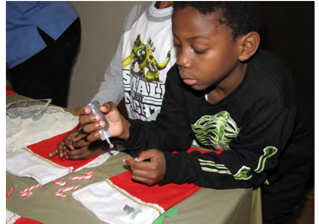
Children decorated stockings and Christmas trees with glitter glue, candy canes and other embellishments.