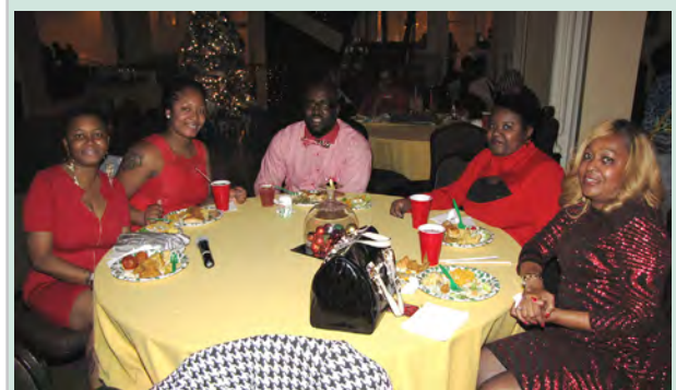
The security staff, their guests and other NCC employees celebrated together at St. Joseph Plaza.