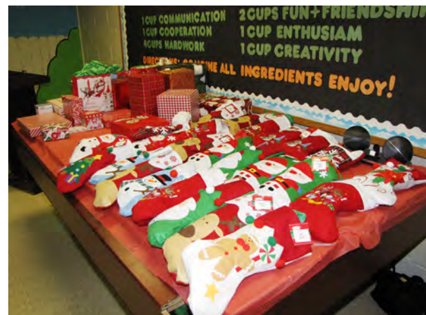
The children also received stockings stuffed with presents.