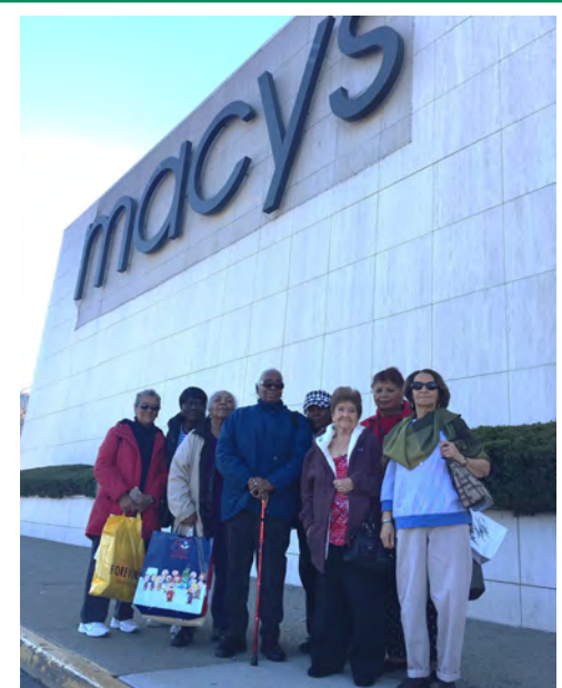
Residents of the senior and disabled adult building accomplished their holiday shopping at Macy's, among other stores, on a trip to Garden State Plaza in Paramus.