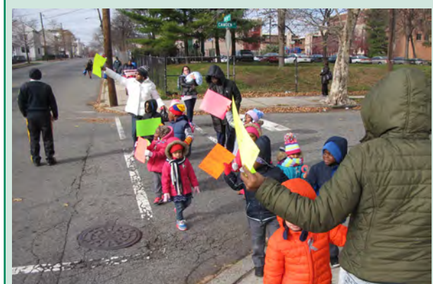
Regarding youth, the ADA reports that 208,000 Americans under the age of 20 are estimated to have diagnosed diabetes.