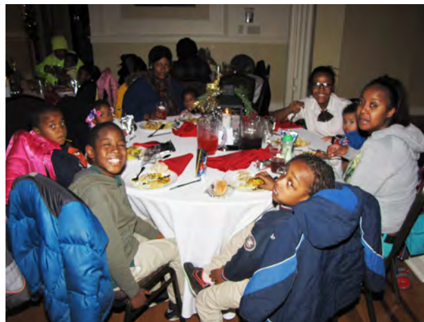
Families from Harmony House and other NCC programs attended the holiday dinner hosted by Wendy Williams' charity, the Hunter Foundation.