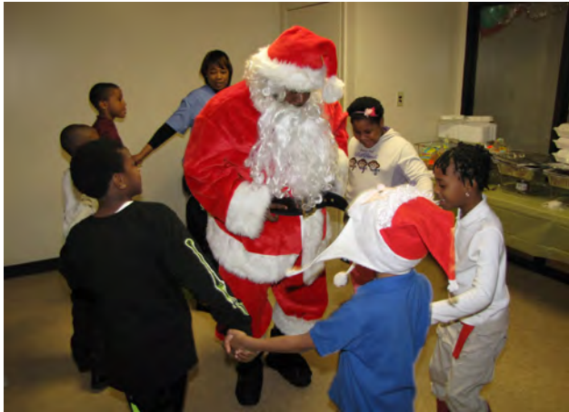
Santa Claus dances with the children whose families reside at New Community Sussex Gardens.