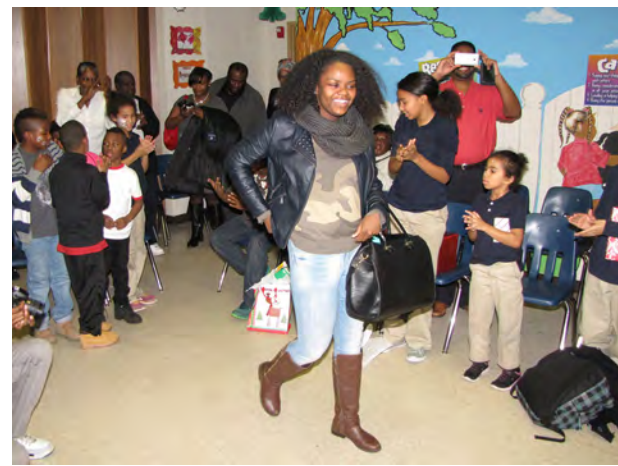
Breakout star Shanice Williams, also known as Dorothy on NBC's "The Wiz Live!"