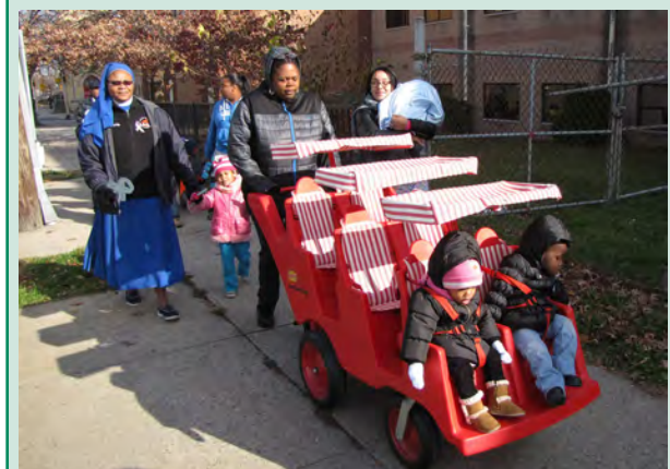
According to the American Diabetes Association, diabetes remains the seventh leading cause of death in the United States in 2010.