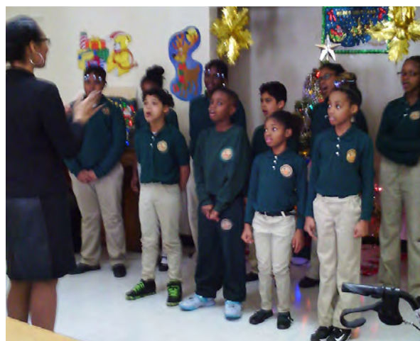
Students from New Horizons Community Charter School sang carols for the residents of New Community Gardens Senior the week of Christmas.