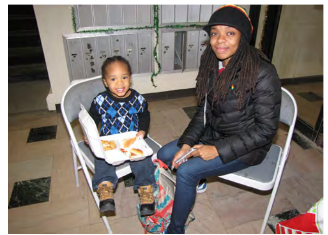
Residents of the building enjoyed dinner, dessert, holiday crafts and dancing.