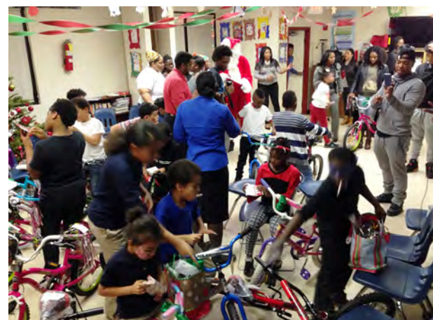
More than 20 children from Harmony House received gifts including brand new bicycles generously donated by the James Brown Family Foundation.