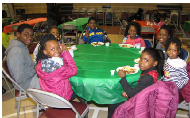
Children enjoyed a free breakfast of pancakes, sausage, potatoes and juice, and parents were also treated to bagels and pastries.