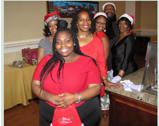
Fancy and out of uniform, members of the New Community Security Department dressed to impress for their holiday party.