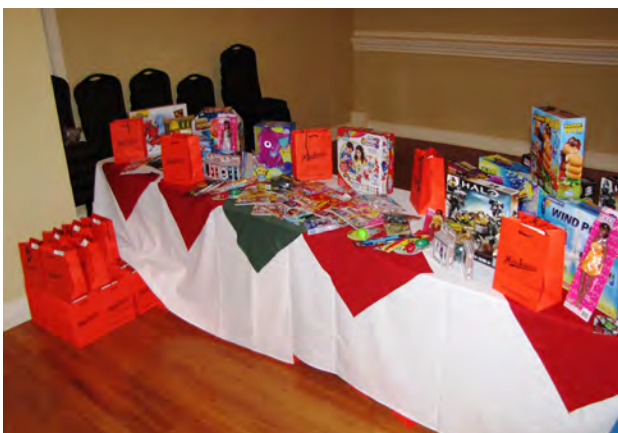
The gifts included toy cars, dolls, coloring books, games and more.