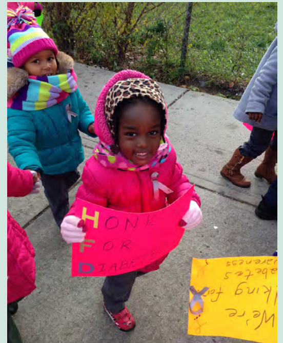
HHELIC sold grey ribbons to raise money for Newark Beth Israel Medical Center and children with diabetes.