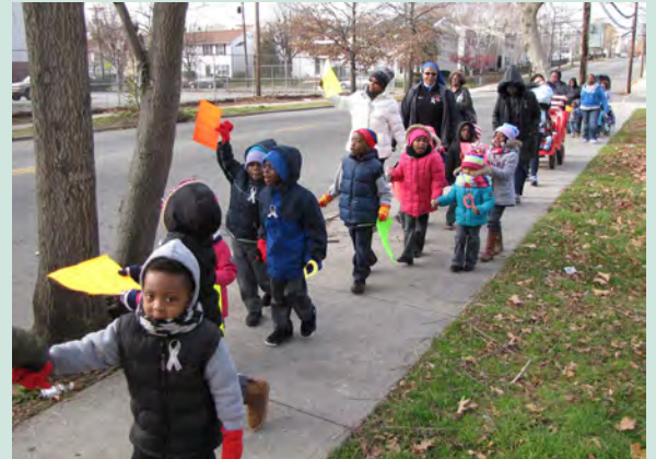
Students and staff from Harmony House Early Learning Center held a fundraising walk to raise support and awareness of diabetes.