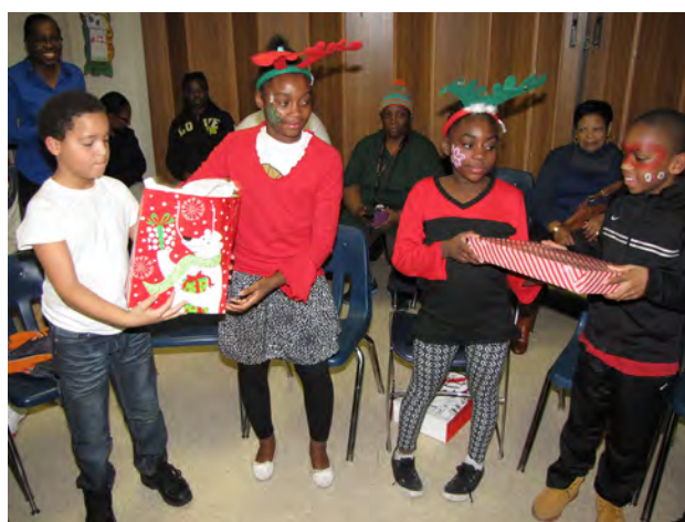
The children of Harmony House played a game where they passed gifts in a circle and got to keep the one in their hands when the music stopped.