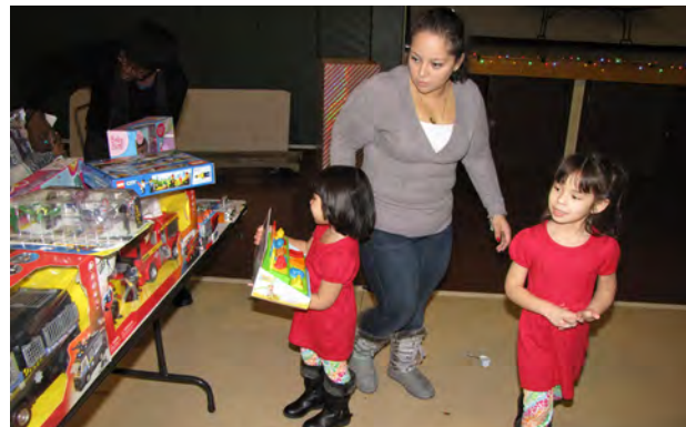
Each child that attended the holiday breakfast received a framed photo with Santa Claus as well as a toy, which was donated by New Community.