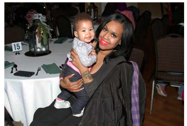
Harmony House is a transitional housing facility in Newark for homeless families where residents receive support from caseworkers to ultimately reach self-sufficiency.