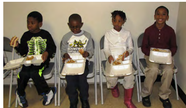
Each child feasted on hot dogs and tater tots. The parents enjoyed a dinner of baked chicken and sides.