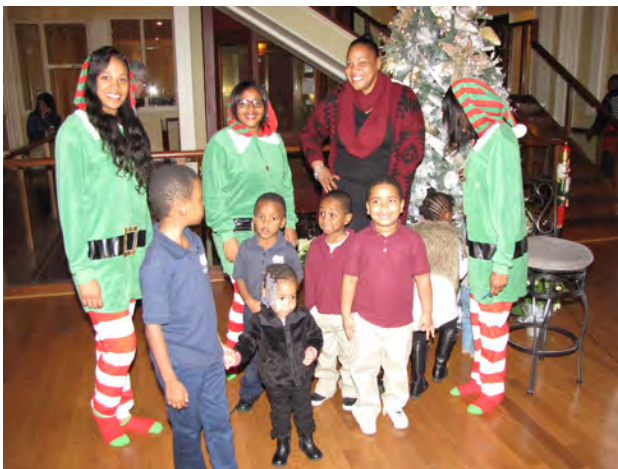
Children and parents took turns snapping photos with Santa's elves in front of the Christmas tree at St. Joseph's Plaza.

on the Tuesday after Thanksgiving weekend to fundraise for their organizations. Many thanks to the Hunter Foundation for its generosity!