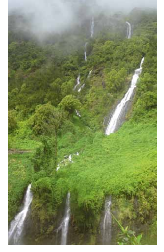
△ Waterfalls cascading down the steep forested mountainsides of the Cirque de Salazie. Jo Wilbraham

Hungary, Kenya, Madagascar, the Netherlands, Norway, La Réunion, Singapore, South Africa and the UK.