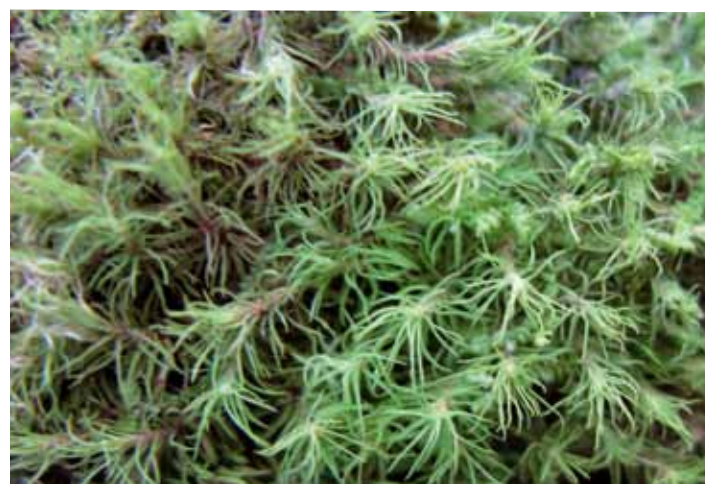
△ Macromitrium mauritianum (top) and Syrrhopodon mahensis (bottom). Jo Wilbraham

these pioneer species in this volcanic environment (Ah-Peng et al., 2007). On lava flows laid down by different eruptive episodes, the various stages of colonization can be studied and compared. Where ferns and lichens had begun to colonize the bare rocks, the diversity of bryophyte species was surprisingly high. The first successional bryophytes to colonize included Campylopus aureonitens, Bryum billardii and small hepatics. During Claudine's survey work, one lava flow had 70 species recorded, predominantly in the family Lejeuneaceae.