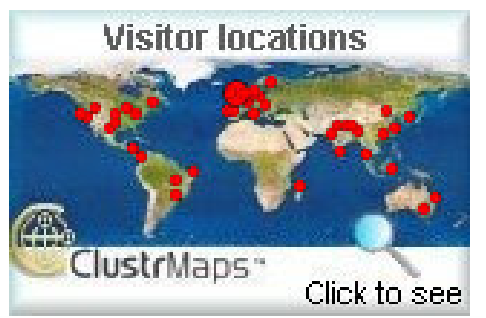
Location of visitors to the website (May-August 2009)

The addition of a visitor statistics tool in May 2009 has provided interesting information on the user base of the website. During the last 4 months the website has had 218 visitors from 33 countries.