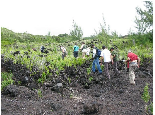
Early colonisation of the Piton de la Fournaise lava flows

island. An important aspect of the meeting was the bryological fieldwork with local botanists and conservation managers who were interested in learning more about the diverse bryophyte flora of the island.