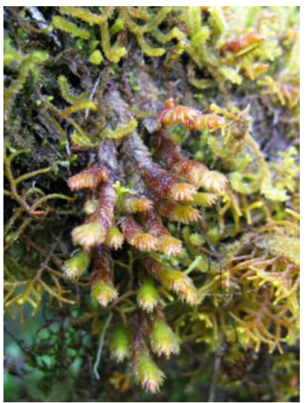
The tropical leafy liverwort Pleurozia gigantea

In September 2008, a team of 17 bryologists, mostly members of the BBS - Tropical Bryology Group, assembled on La Réunion for two weeks to participate in a taxonomic workshop and field meeting hosted by the Université de la Réunion and La Réunion Parc National. The aim of this taxonomic workshop was to bring together bryologists researching the bryophyte flora of the Mascarenes.