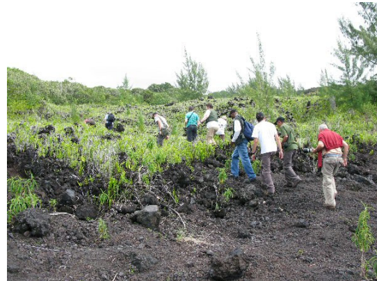
Early colonisation of the Piton de la Fournaise lava flows

island. An important aspect of the meeting was the bryological fieldwork with local botanists and conservation managers who were interested in learning more about the diverse bryophyte flora of the island.