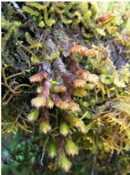
The tropical leafy liverwort Pleurozia gigantea

In September 2008, a team of 17 bryologists, mostly members of the BBS - Tropical Bryology Group, assembled on La Réunion for two weeks to participate in a taxonomic workshop and field meeting hosted by the Université de la Réunion and La Réunion Parc National. The aim of this taxonomic workshop was to bring together bryologists researching the bryophyte flora of the Mascarenes.