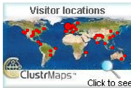
Location of visitors to the website (May-August 2009)

The addition of a visitor statistics tool in May 2009 has provided interesting information on the user base of the website. During the last 4 months the website has had 218 visitors from 33 countries.