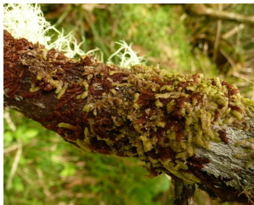
Cheilolejeunea sp. photographed on Réunion Island