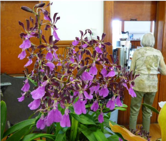
Encyclia Reese Grafazzi

Please visit their website for a complete list of speakers and topics.