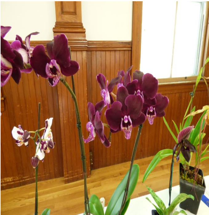
Phal. Taida Pearl