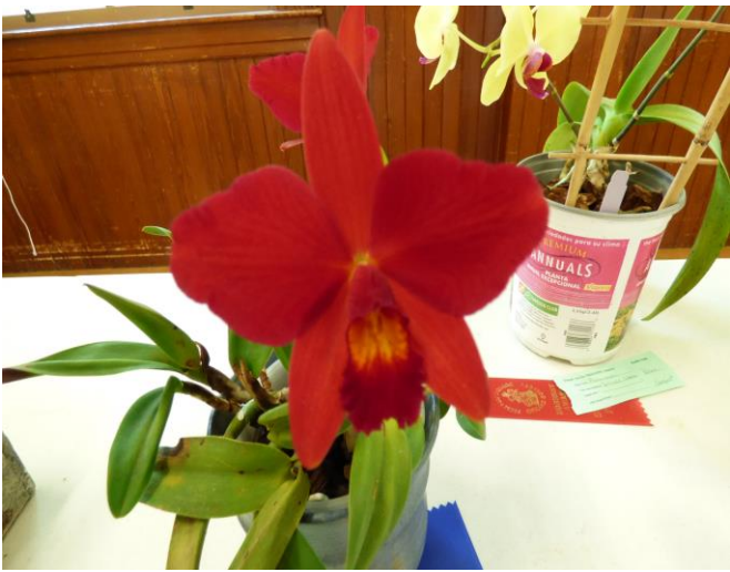
Potinara Samantha Duncan 'Red Hot'