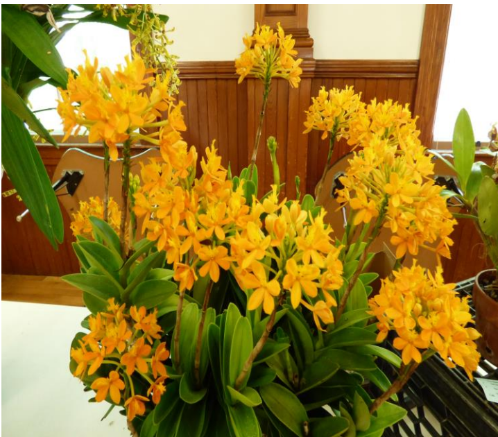
Epidendrum Noel Star Valley