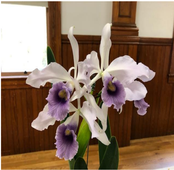
Lc. C.C. Roebling 'Beechview' var. Coerulea