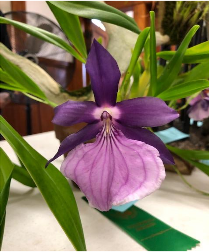
Miltonia spectabilis var moreliana HM/CCM/AOS