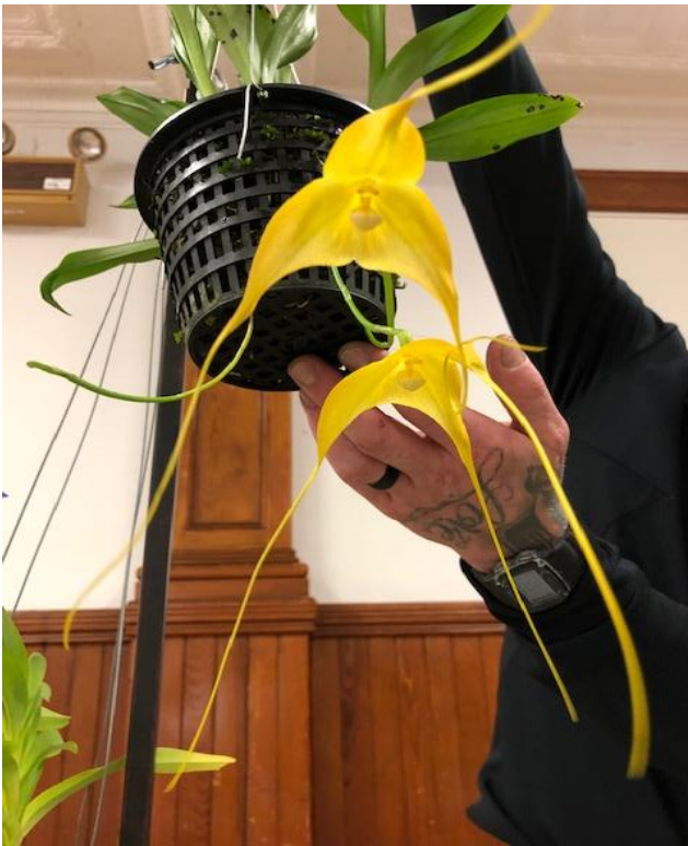
Dracula hirtzii 'New Zealand' AM/AOS