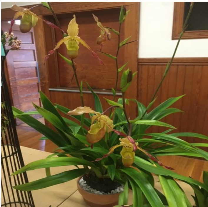
Phrag. Sorcerer's Apprentice