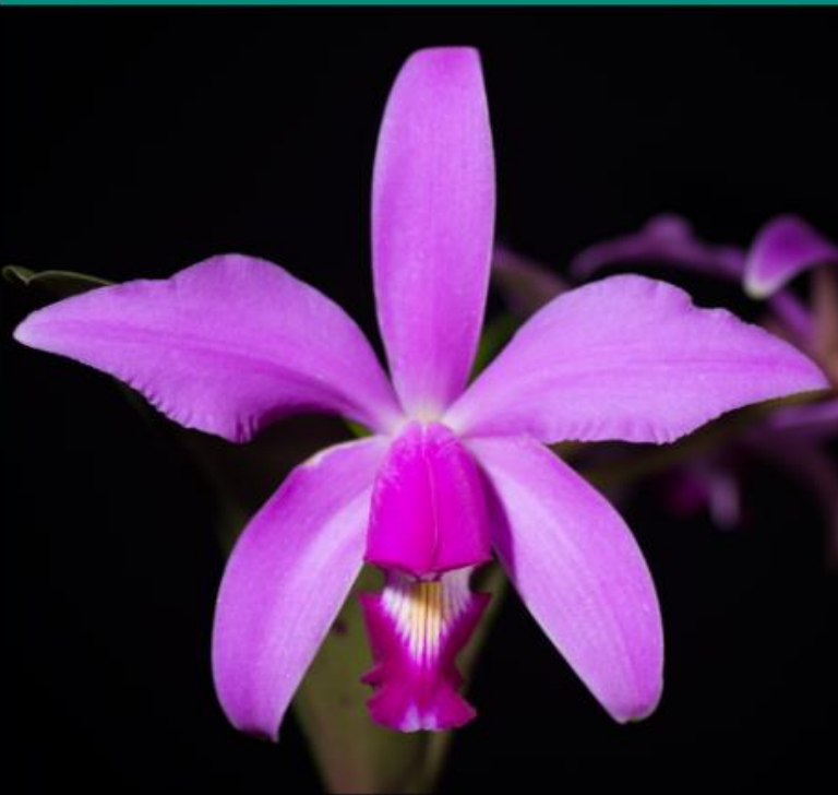
Cattleya violacea

THE MASSACHUSETTS ORCHID SOCIETY PRESENTS