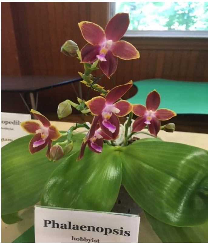
Phal Tying Shin Fly Eagle x KS Happy Eagle