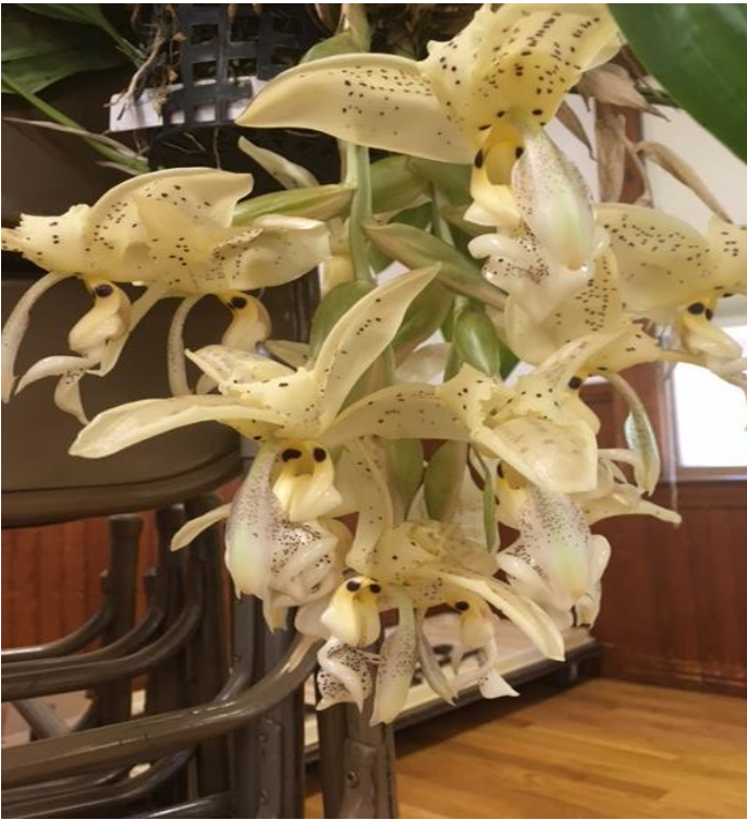
Stanhopea (oculata x warszewicziana)