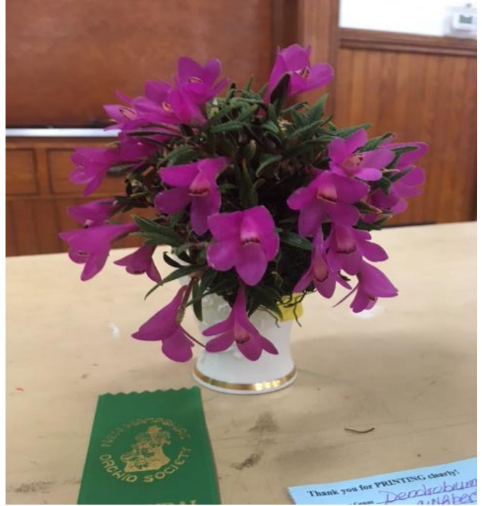
Den. cuthbertsonii '4N'