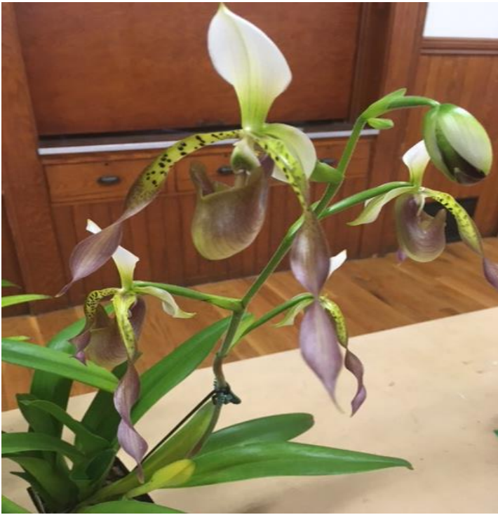
Paph. Skelton 'Cleveland's' AM/AOS