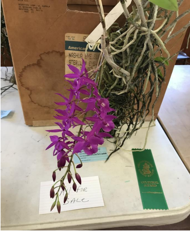
Barkeria cyclotella (B. scandens)